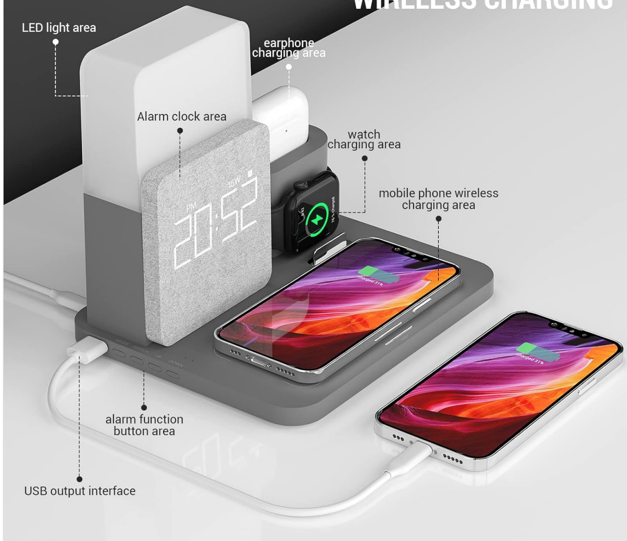
Image: An annotated diagram illustrating the various functional areas of the charging station, including the USB output interface.