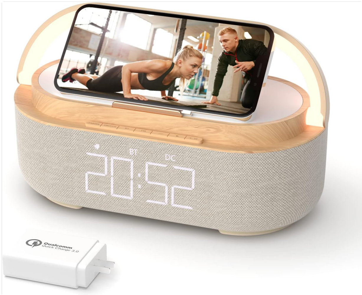
Image: The charging station connected to its power adapter, ready for use.