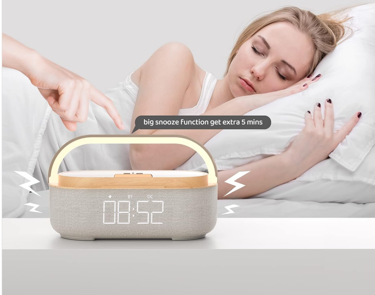
Image: The alarm clock feature, designed to be effective for heavy sleepers, with a snooze function for additional rest.