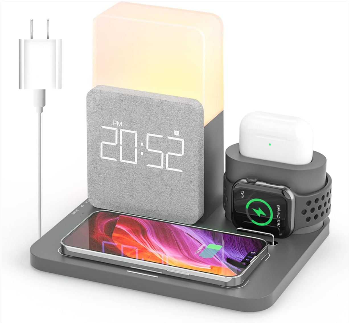
Image: The charging station with a smartphone, smartwatch, and earbuds placed on their designated charging pads, indicating active charging.