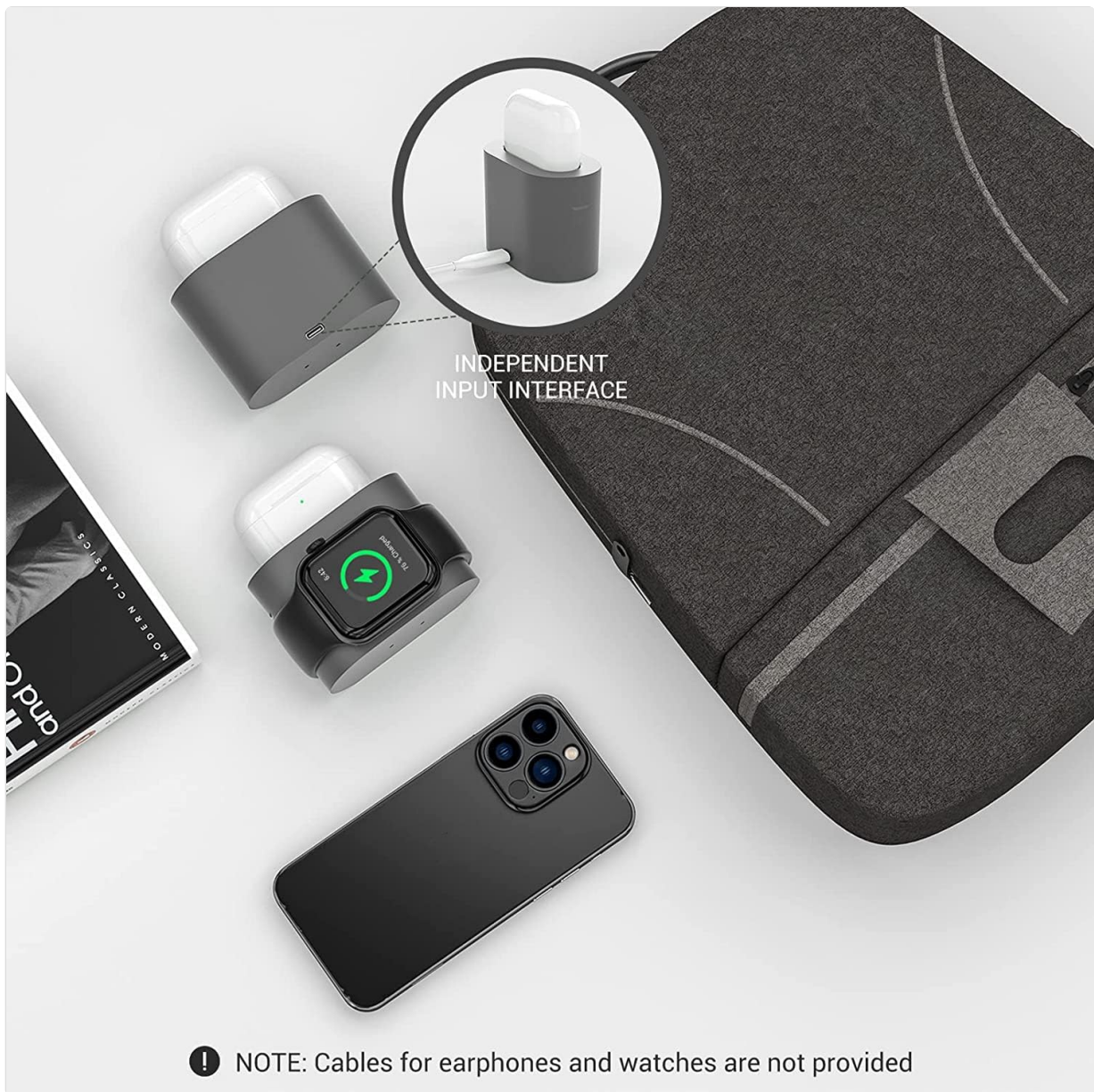
Image: A detailed view of the independent input interface for earbud and watch chargers, highlighting the cable management feature.