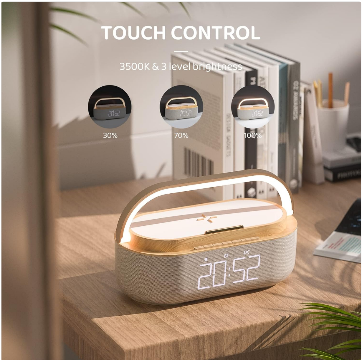
Image: The night light's touch control interface, demonstrating its 3500K color temperature and three brightness levels.