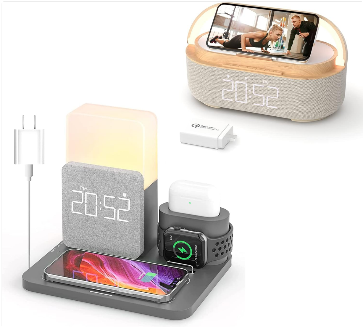
Image: The COLSUR 3-in-1 Wireless Charging Station, showcasing its ability to charge a smartphone, smartwatch, and earbuds simultaneously, with an integrated alarm clock and night light.