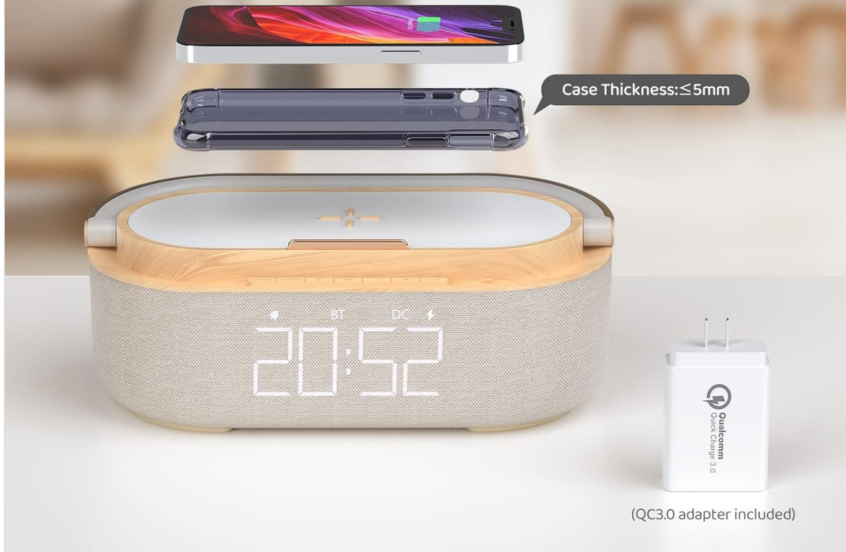
Image: A diagram highlighting the 15W fast wireless charging capability, compatible with Qi-enabled phones and cases up to 5mm thick.