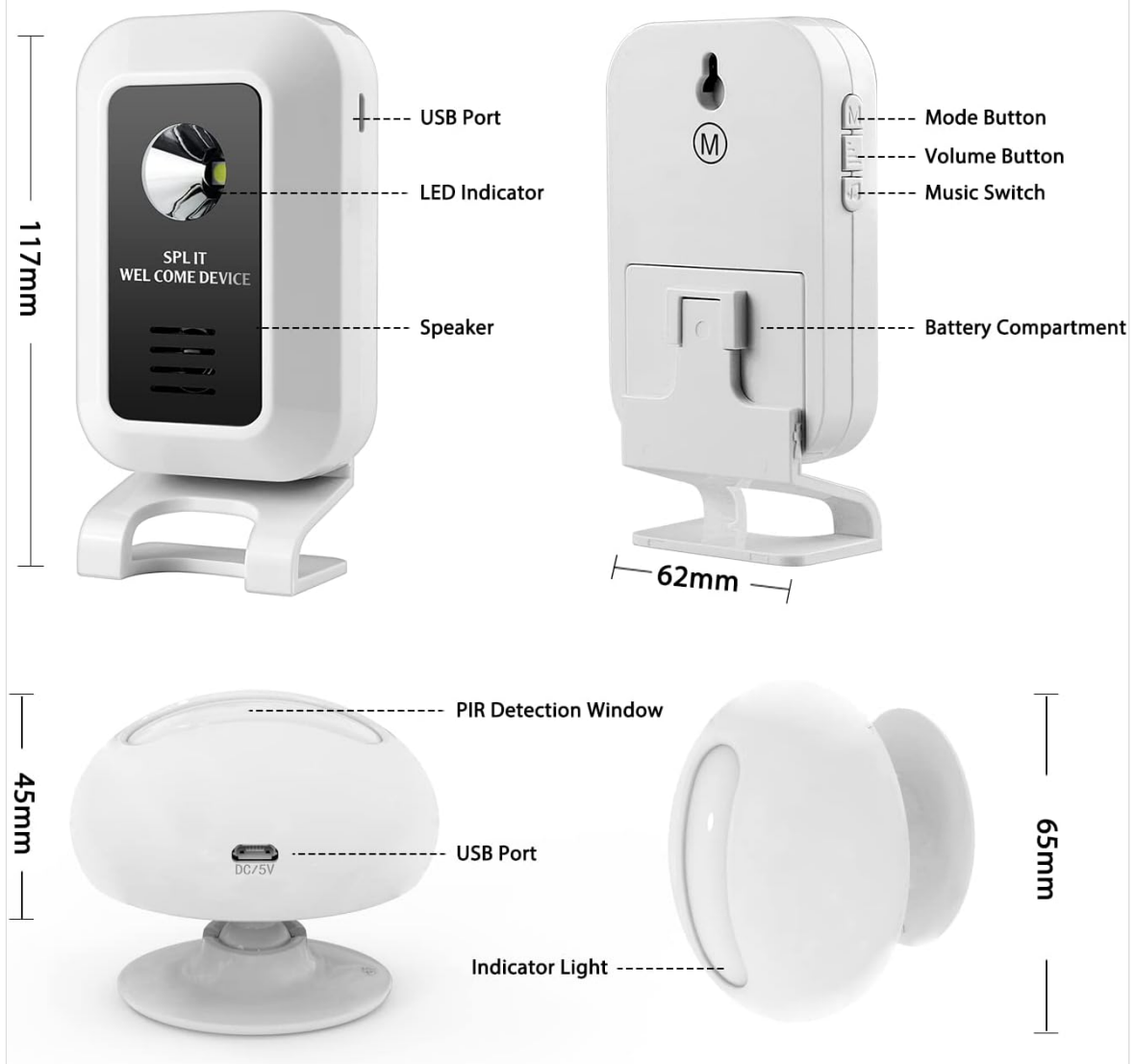
Image 3.1: This diagram illustrates the various parts of the KERUI M7 system. The receiver unit features a USB port, LED indicator, speaker, mode button, volume button, music switch, and battery compartment. The motion detector unit includes a PIR detection window, USB port, and indicator light.