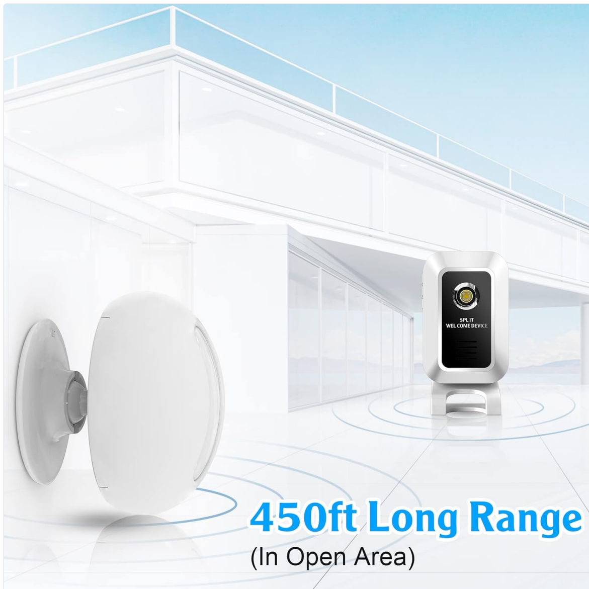
Image 5.1: This image demonstrates the potential placement of the motion detector and receiver, emphasizing the 450ft long-range capability in open areas. Proper placement ensures optimal detection and signal transmission.