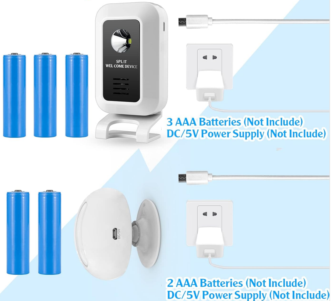
Image 4.1: This image displays the power options for both the receiver and the motion detector. Both units can be powered by AAA batteries or a DC/5V power adapter, neither of which are included in the package.