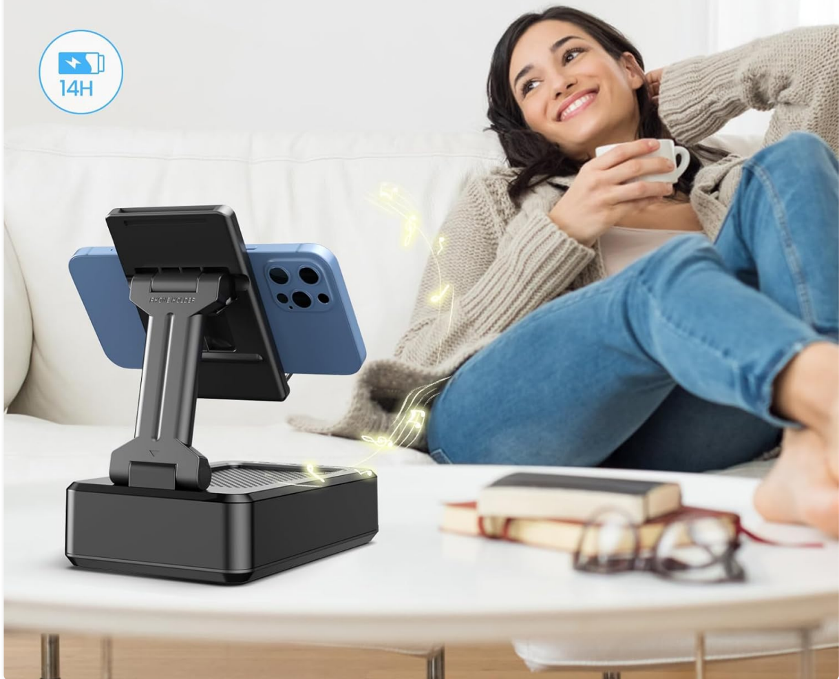
Image: Device in use, highlighting 14 hours of playtime.