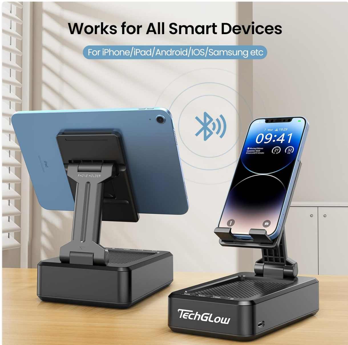
Image: Device holding both a smartphone and a tablet.

Place your smartphone or tablet (4-13 inches) securely on the adjustable holder. Adjust the angle for optimal viewing. The anti-slip pads on the hook and base provide stability and protect your device from scratches.