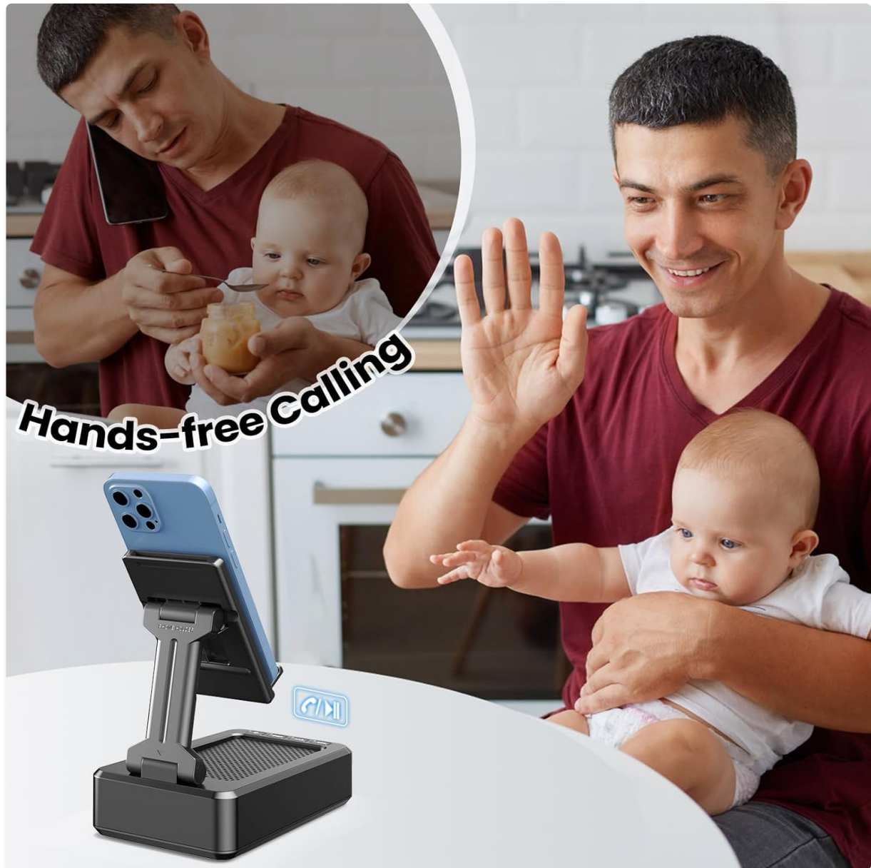
Image: Hands-free calling in use.

When a call comes in while connected via Bluetooth, press the Answer/Hang up button (3) to answer. Press again to end the call. Hold the button to reject an incoming call. The built-in microphone (6) allows for clear communication.