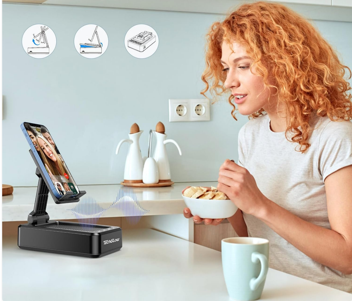
Image: Foldable and adjustable design in use.

Find you the most comfortable viewing angle