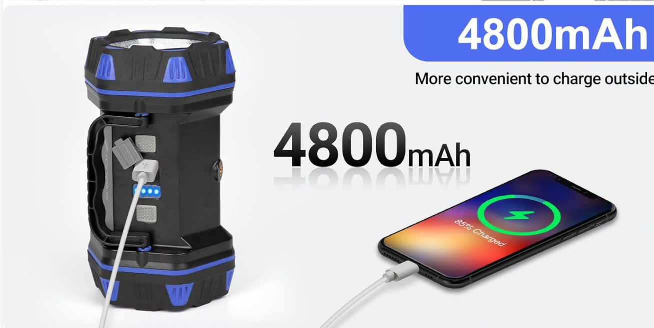
Image: The ropelux HC-262 LED Camping Lantern connected to a power source via its USB-C port for charging.