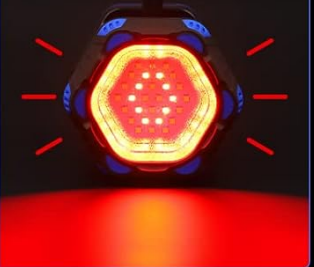
Image: Visual representation of the 8 distinct lighting modes available on the ropelux HC-262, including spotlight, floodlight, side light, and red emergency modes.