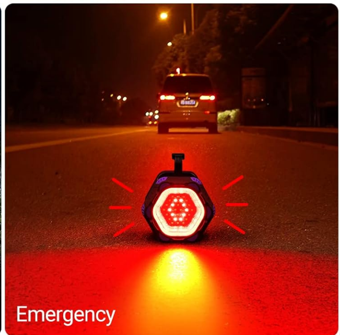
Image: Examples of how the ropelux HC-262 can be used in different situations such as vehicle repair, camping, hiking, and roadside emergencies.