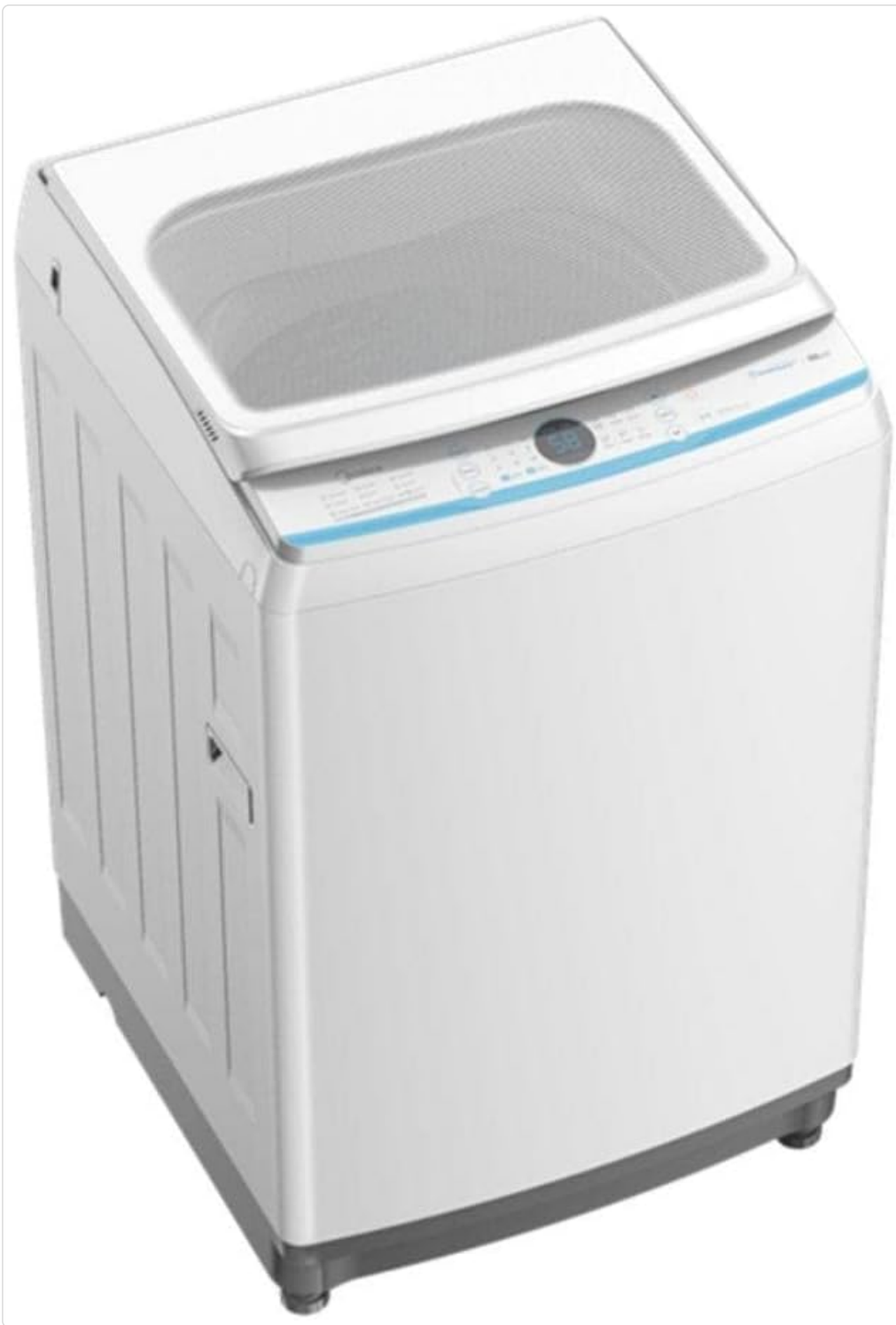
Figure 1: Angled view of the Midea 10 kg Top Load Washing Machine.