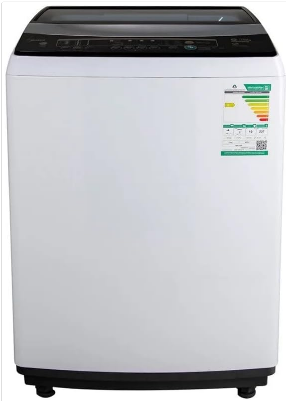
Figure 2: Front view of the Midea 10 kg Top Load Washing Machine with control panel.