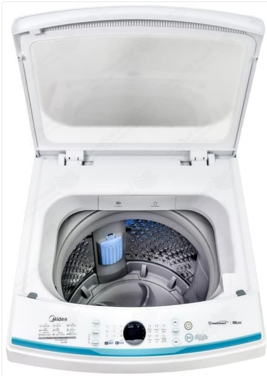
Figure 3: Top view of the Midea 10 kg Top Load Washing Machine with lid open.