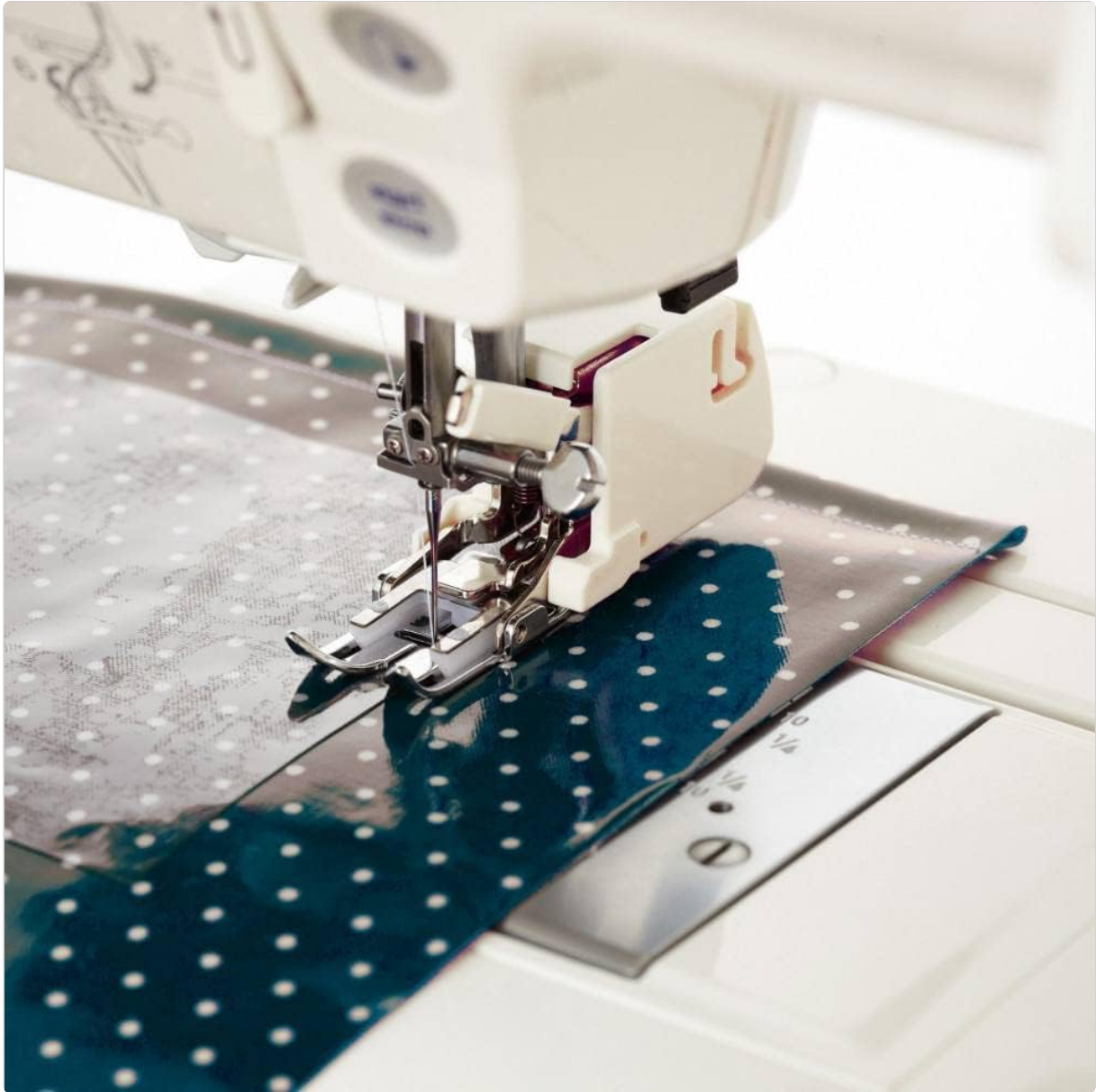
Figure 2: The walking foot actively feeding fabric through a sewing machine, demonstrating its function in maintaining even layers.