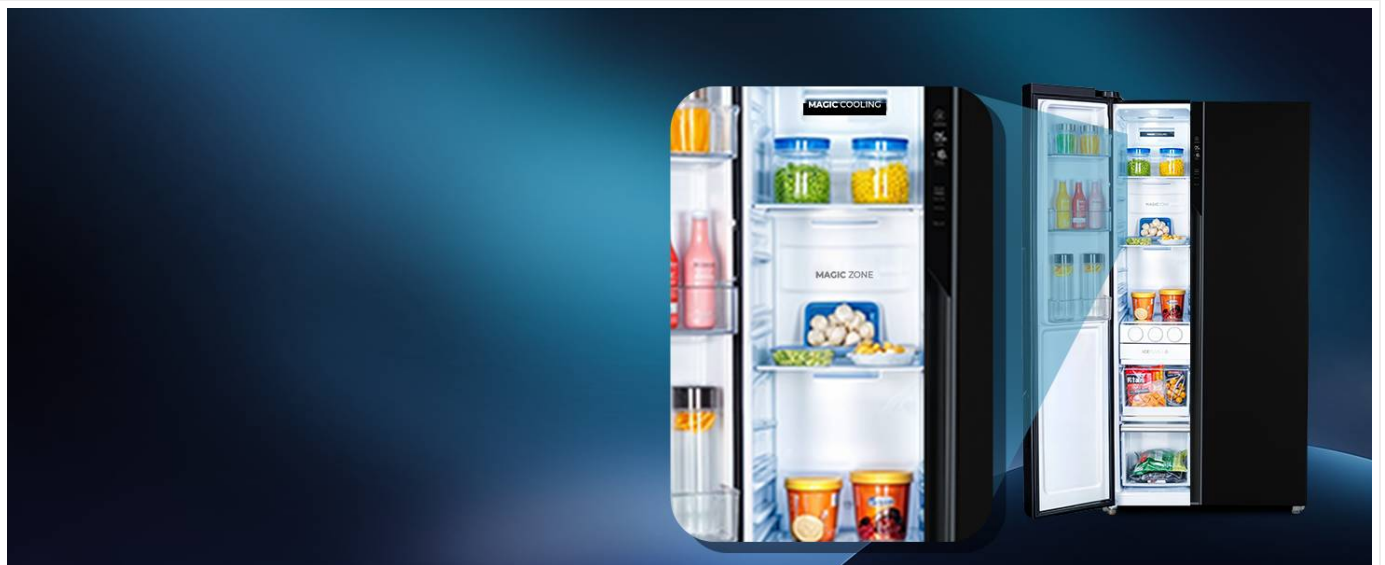
Figure 4: The Magic Convertible Zone allows flexible temperature settings.