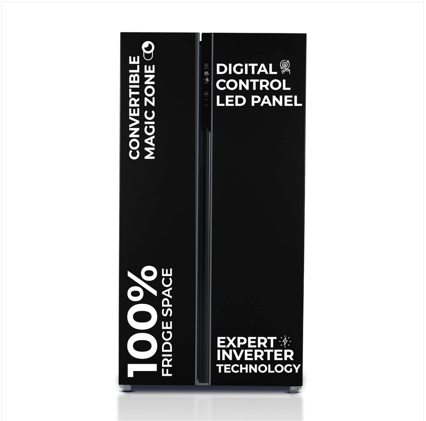
Figure 1: Front view of the Haier HRS-682KS Refrigerator.