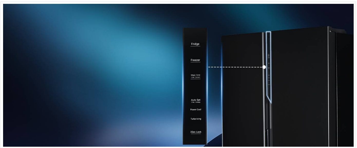
Figure 2: External Digital LED Control Panel for temperature settings.

Your Haier refrigerator features an external digital LED panel for easy temperature monitoring and adjustment without opening the doors. This 'Feather Touch Display' allows precise control over your appliance's performance.