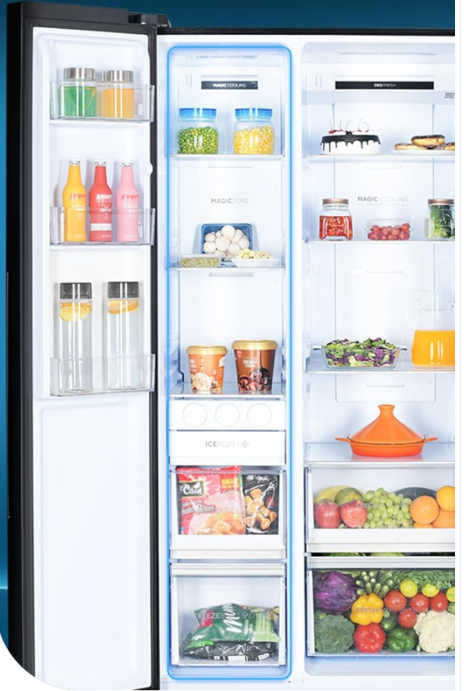
Figure 3: Interior view demonstrating 100% convertible fridge space.