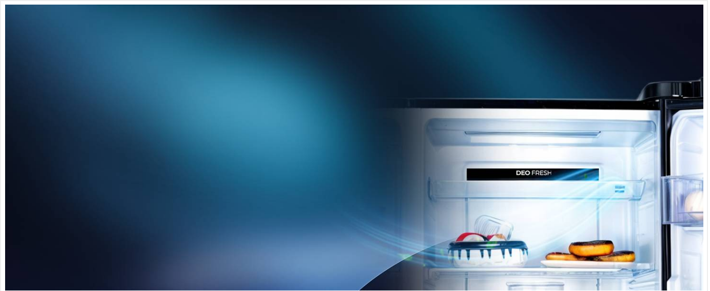
Figure 8: Magic Cooling and Deo Fresh Technology for optimal freshness.

This advanced cooling system ensures uniform and consistent 360-degree cooling throughout the refrigerator. The integrated Deo Fresh Technology actively eliminates odors, keeping your food fresh and hygienic for up to 21 days.