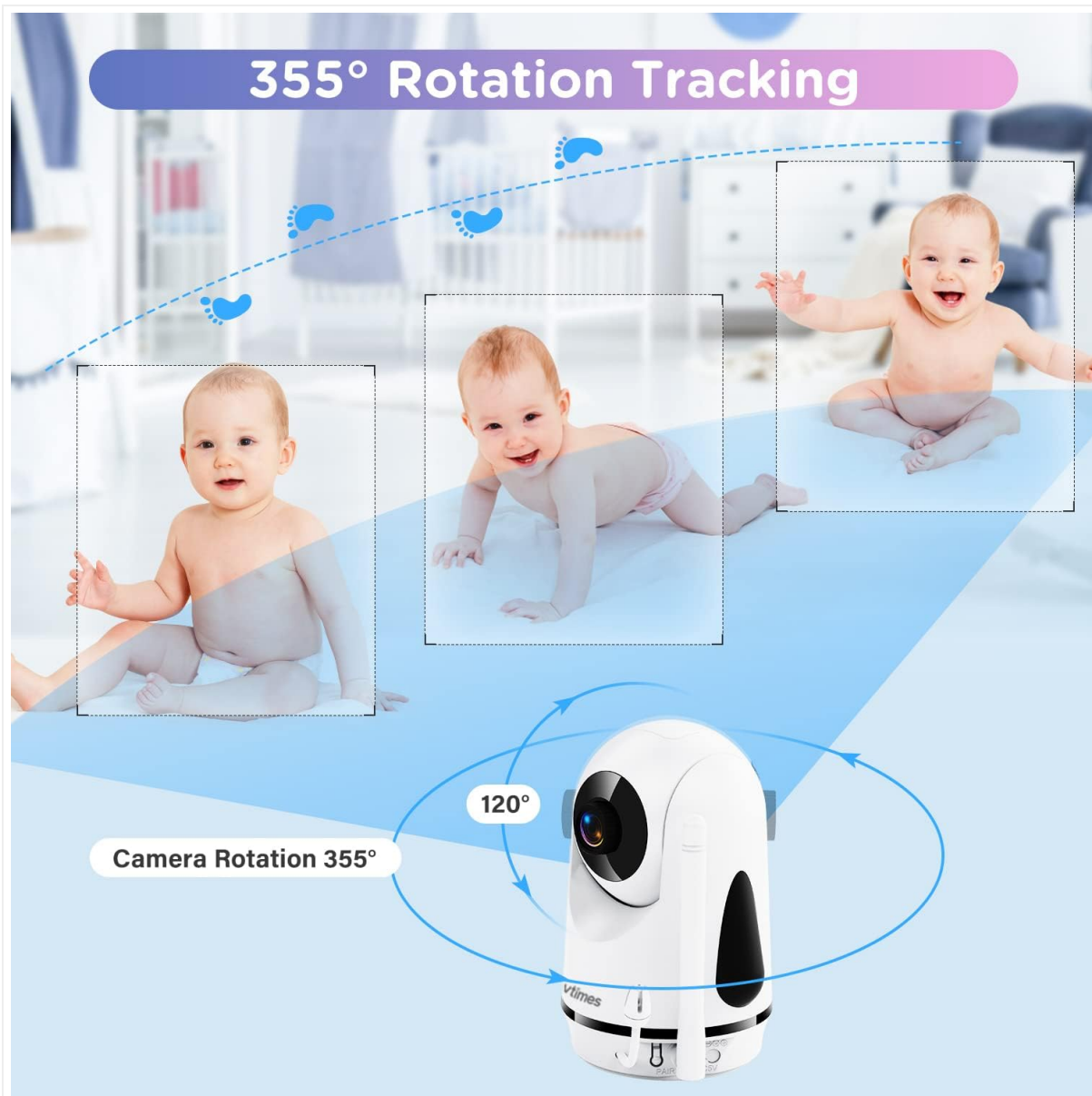
Figure 3: The camera features 355° rotation tracking for comprehensive room coverage.