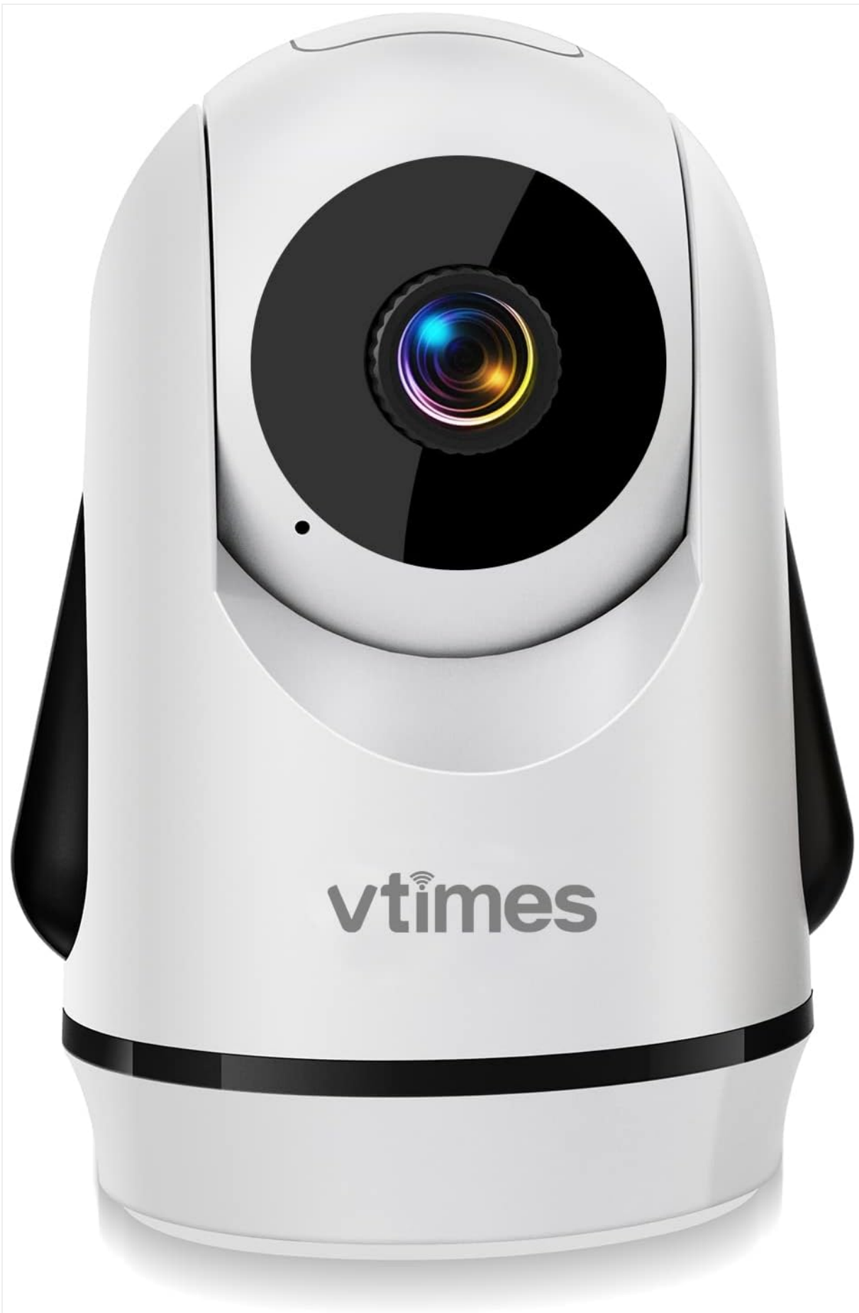
Figure 1: Front view of the VTimes VT502 Baby Monitor Camera.