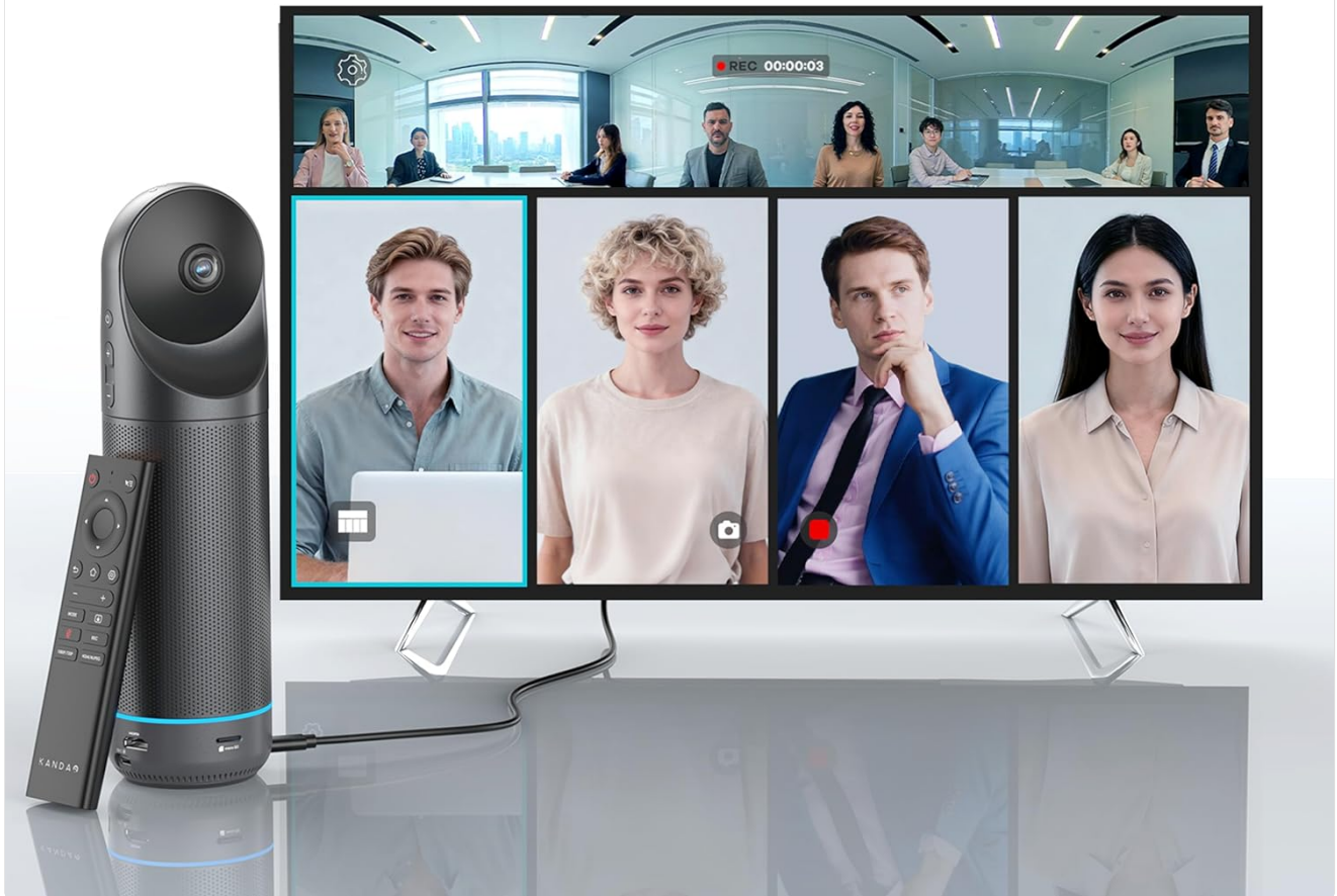
Image: A screen showing various conference views (Discussion, Global, Presentation, Patrol, Custom modes) from the KanDao Meeting Pro.