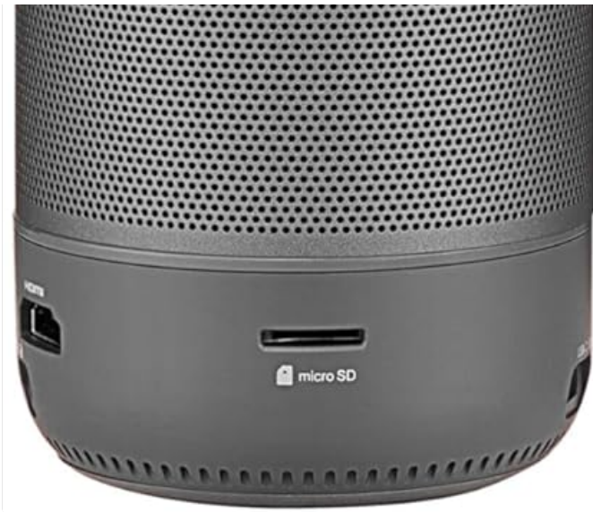
Image: KanDao Meeting Pro with power and HDMI cables connected to a displayer.