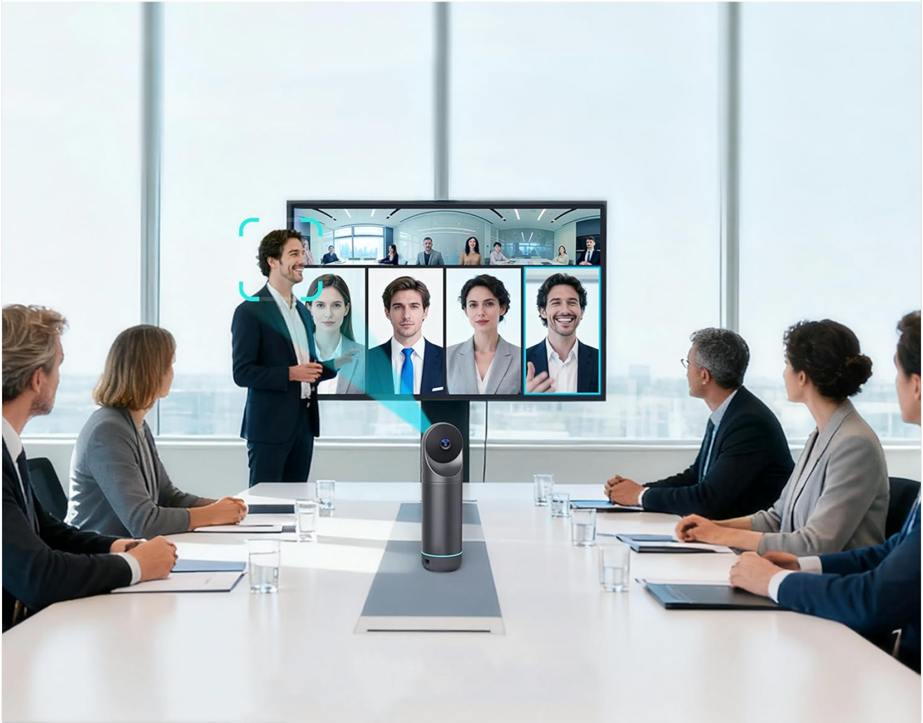
Image: The KanDao Meeting Pro in a conference room, demonstrating AI-powered speaker tracking by highlighting the active speaker on a large display.

Ensure precise focus and highlight the active speaker, even when they are moving.