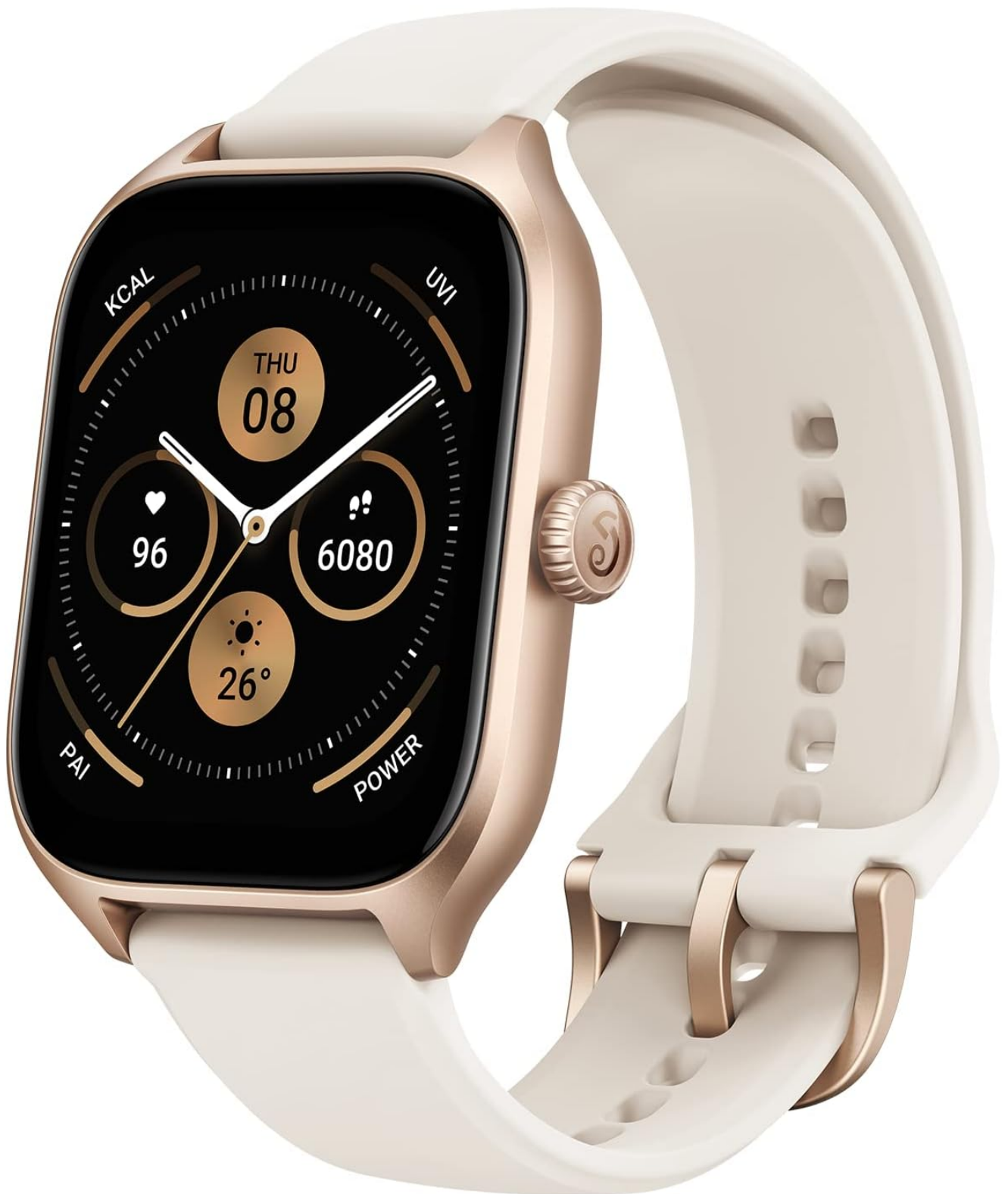
Figure 1: Amazfit GTS 4 Smart Watch in Misty White with rose gold accents.