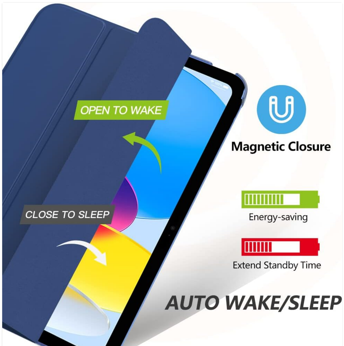
Image: A diagram illustrating the "Open to Wake" and "Close to Sleep" functionality of the case, highlighting the magnetic closure and its energy-saving benefits.