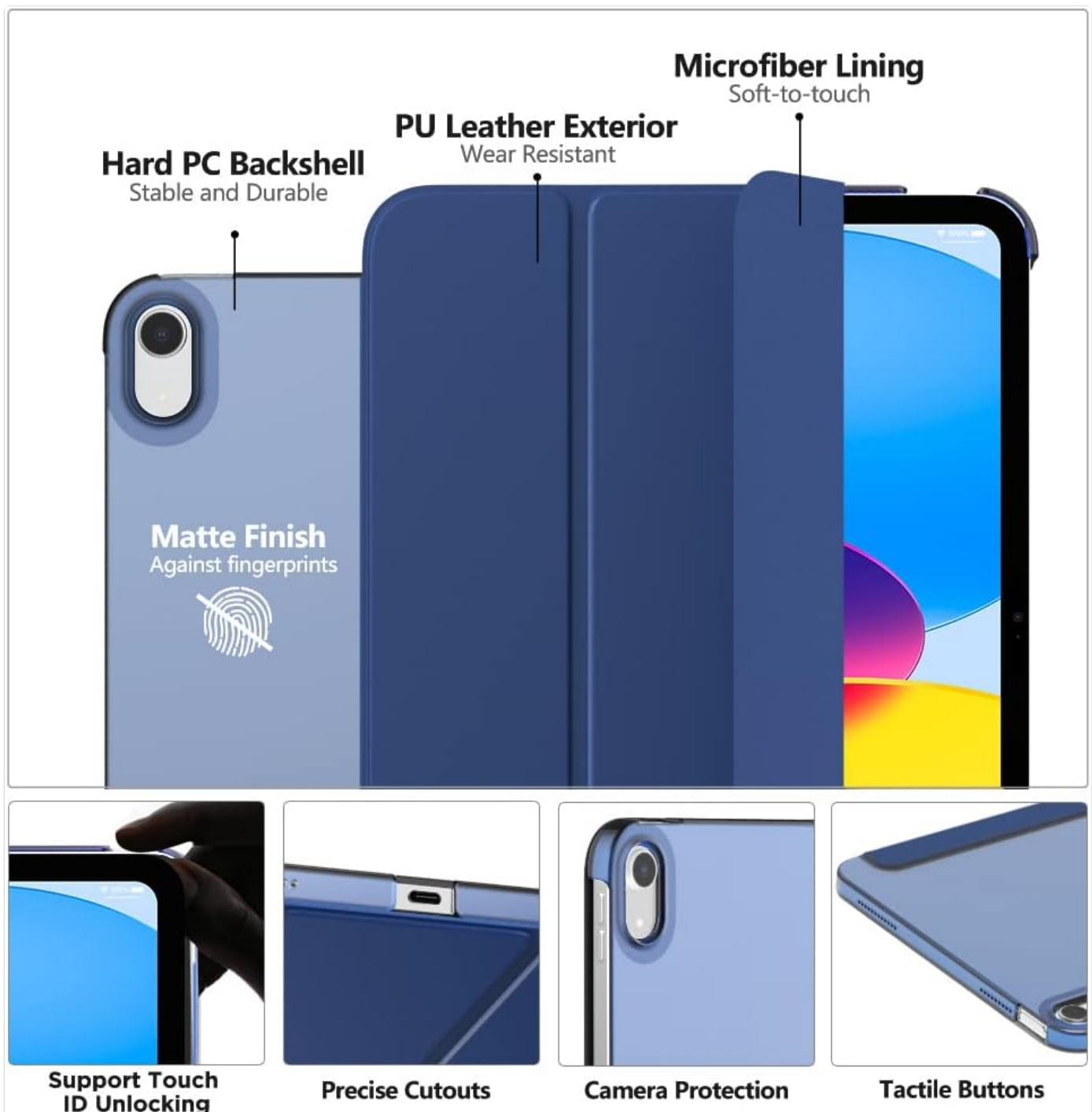
Image: A composite image highlighting key design elements: support for Touch ID unlocking, precise cutouts for ports, camera protection, and responsive tactile buttons.