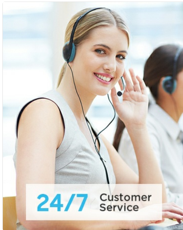
Image: A customer service representative wearing a headset, symbolizing available support for product inquiries.