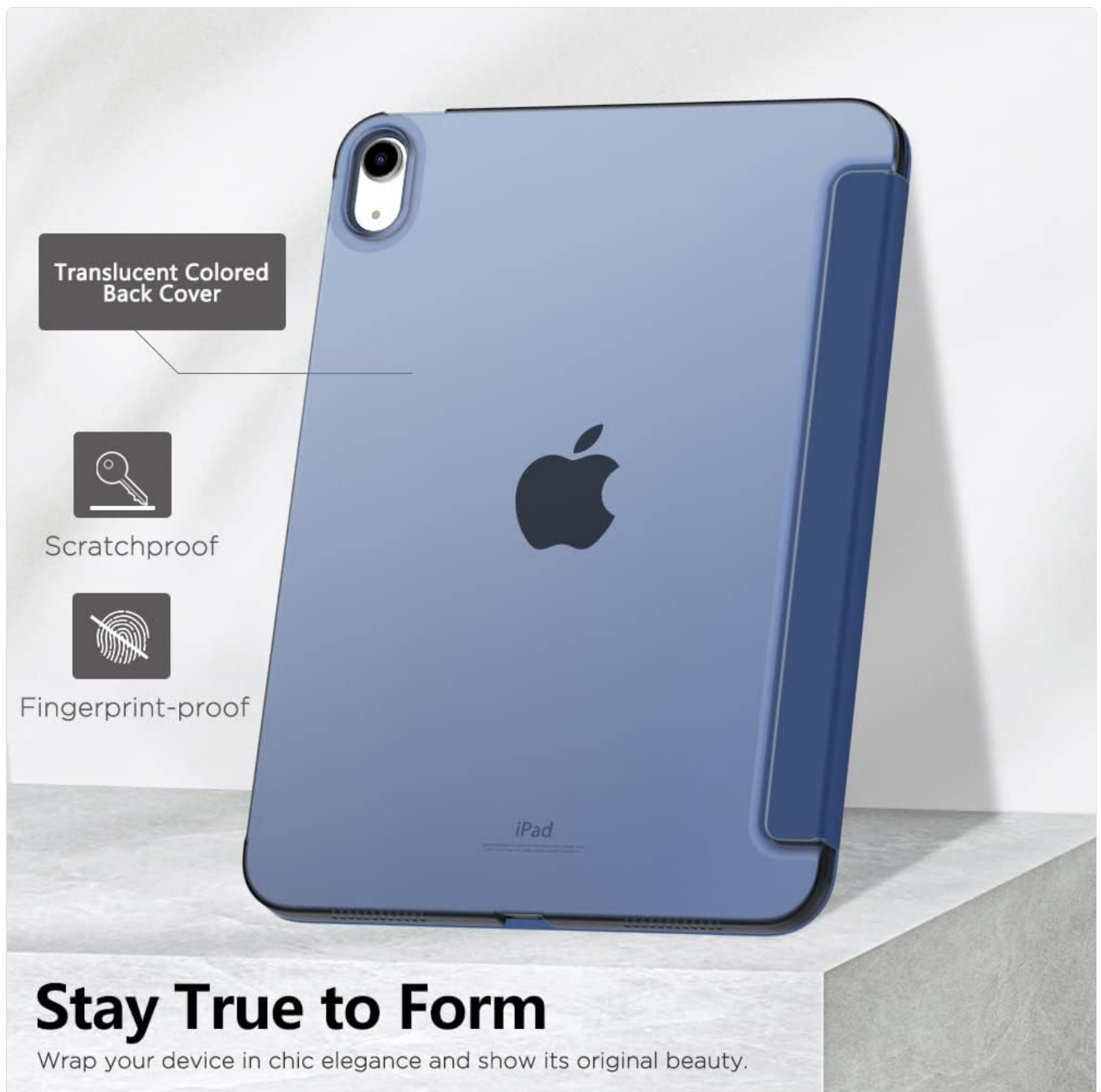
Image: A close-up of the translucent colored back cover, emphasizing its scratchproof and fingerprint-proof properties, designed to maintain the iPad's original aesthetic.