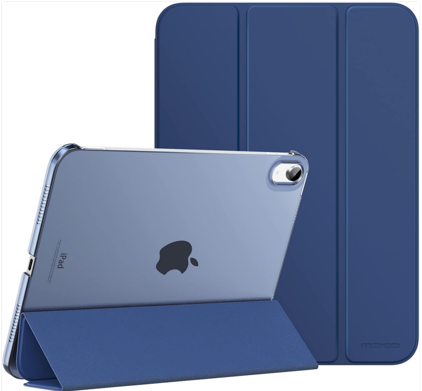
Image: The MoKo iPad case in navy blue, showcasing its design with the translucent back shell and the front cover folded to support the iPad in a viewing angle.