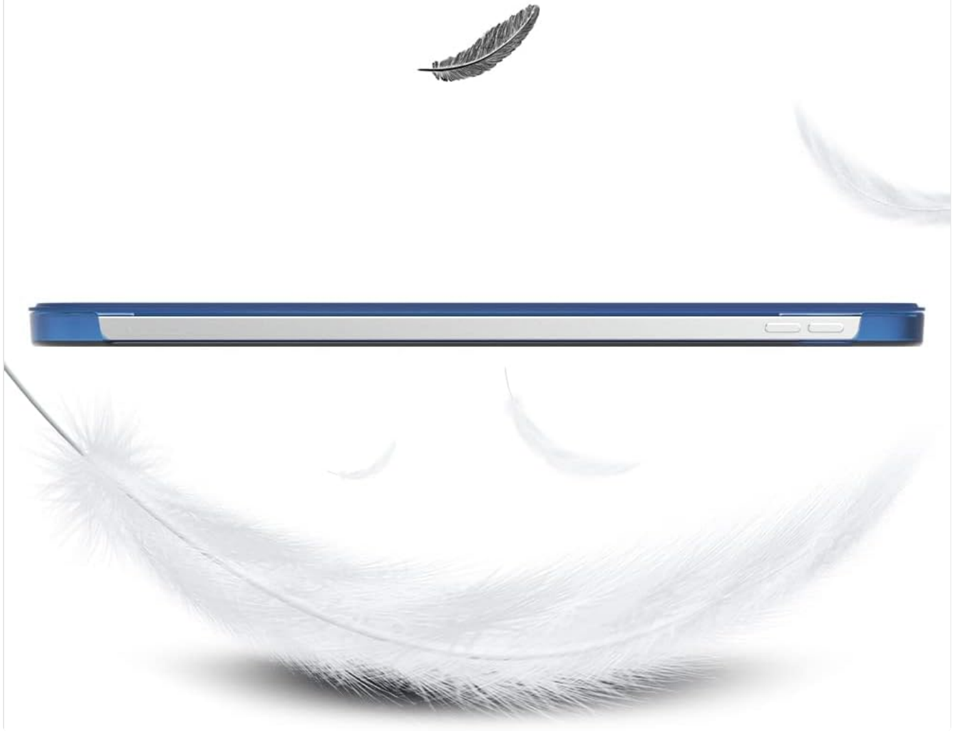
Image: A side view of the case, emphasizing its slim and lightweight profile, with feathers in the background to visually represent its lightness.