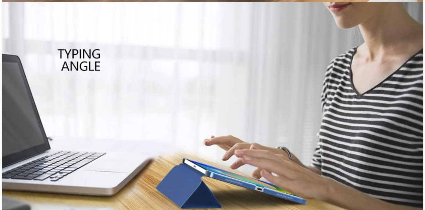
Image: Two separate images demonstrating the case's ability to create different viewing angles: one upright for media consumption and another lower angle for comfortable typing.