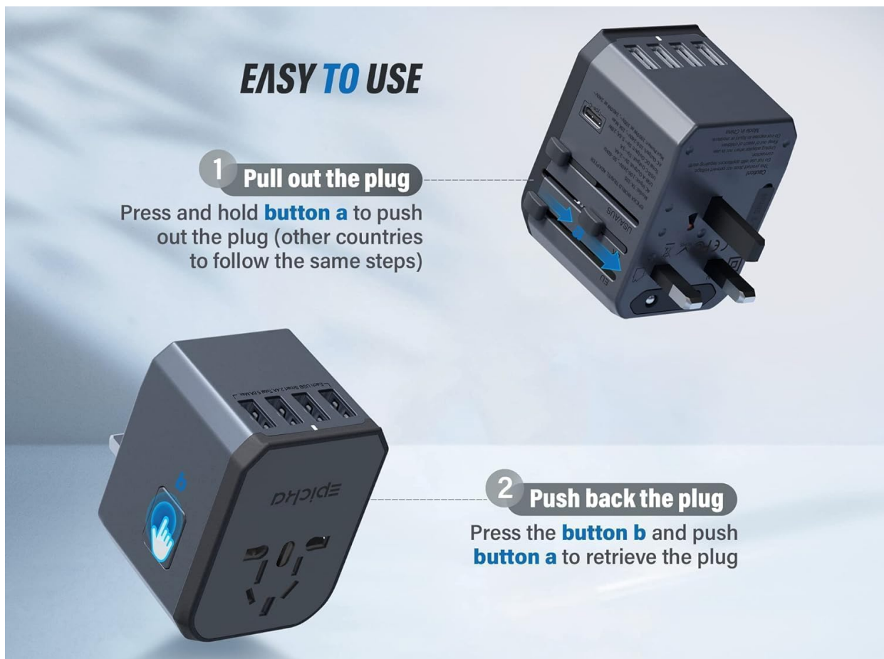
Image: Demonstrates the easy-to-use mechanism for extending and retracting the adapter's plugs. To extend a plug, slide the corresponding lever forward. To retract, press the release button on the side and slide the lever back.