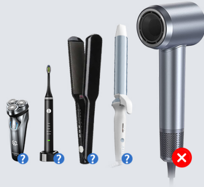
Image: Clearly states that the adapter is not a voltage converter. It shows icons for hair tools, electric shavers, and toothbrushes as devices to check for dual voltage compatibility, and explicitly warns against using high-power items like hair dryers or steamers over 2000W.