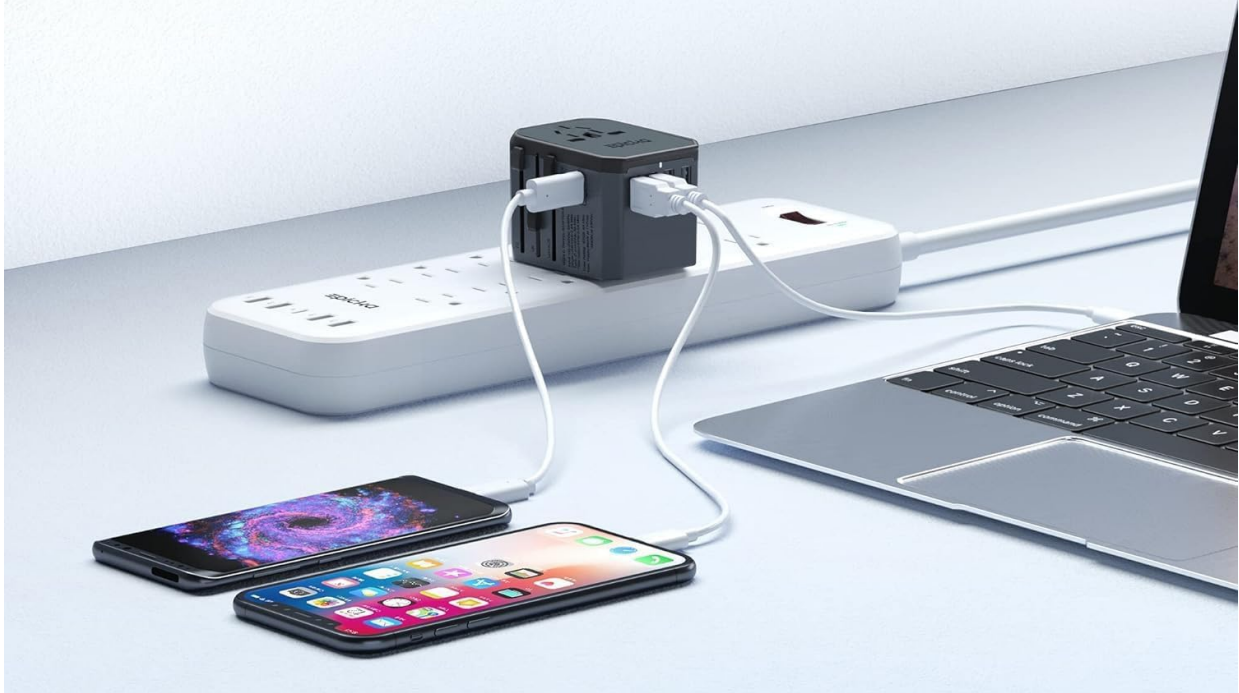
Image: The EPICKA Universal Travel Adapter connected to a power strip, simultaneously charging two smartphones, a laptop, and other devices via its multiple USB ports and AC socket.

4 USB Ports 1 Type C and 1 AC Socket to charge 6 devices simultaneously