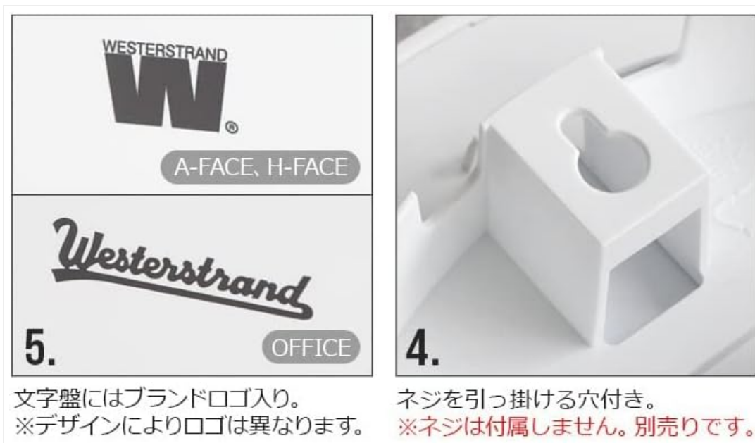
Image: Close-up of the clock's back, highlighting the keyhole-shaped slot for wall mounting. This shows where a screw should be inserted to hang the clock.