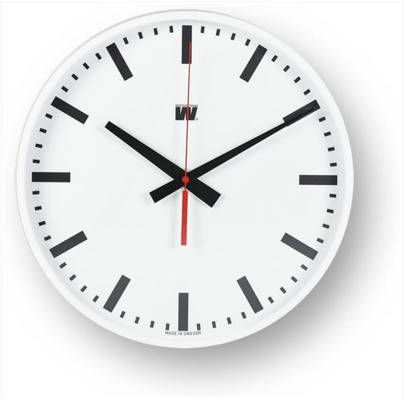
Image: Front view of the WESTERSTRAND QUARTZ CLOCK 23cm H-FACE. This image displays the clean, minimalist white dial with black hour markers and hands, and a red second hand. The brand logo is visible at the top center.