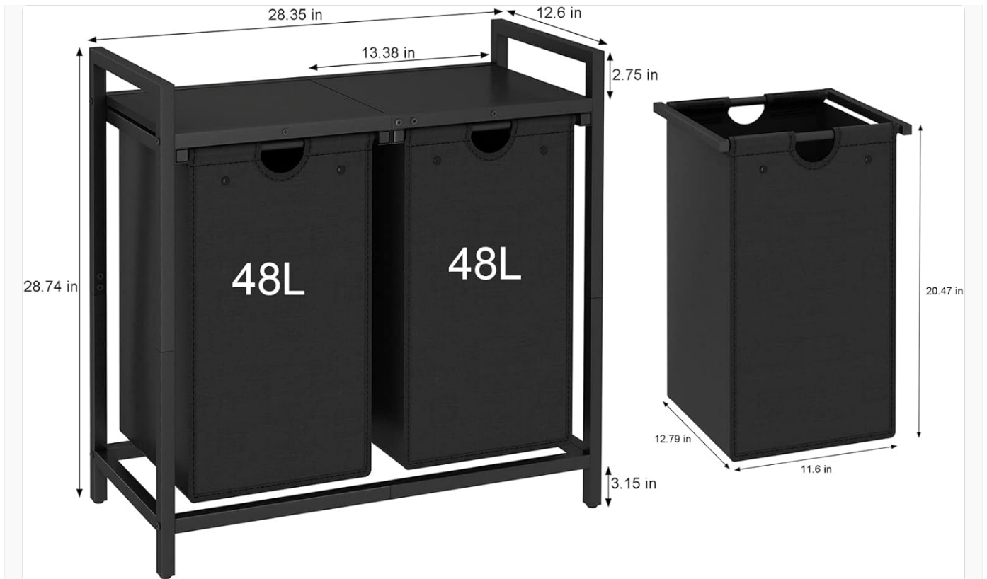
Figure 7.1: Dimensional overview of the laundry hamper and its components.