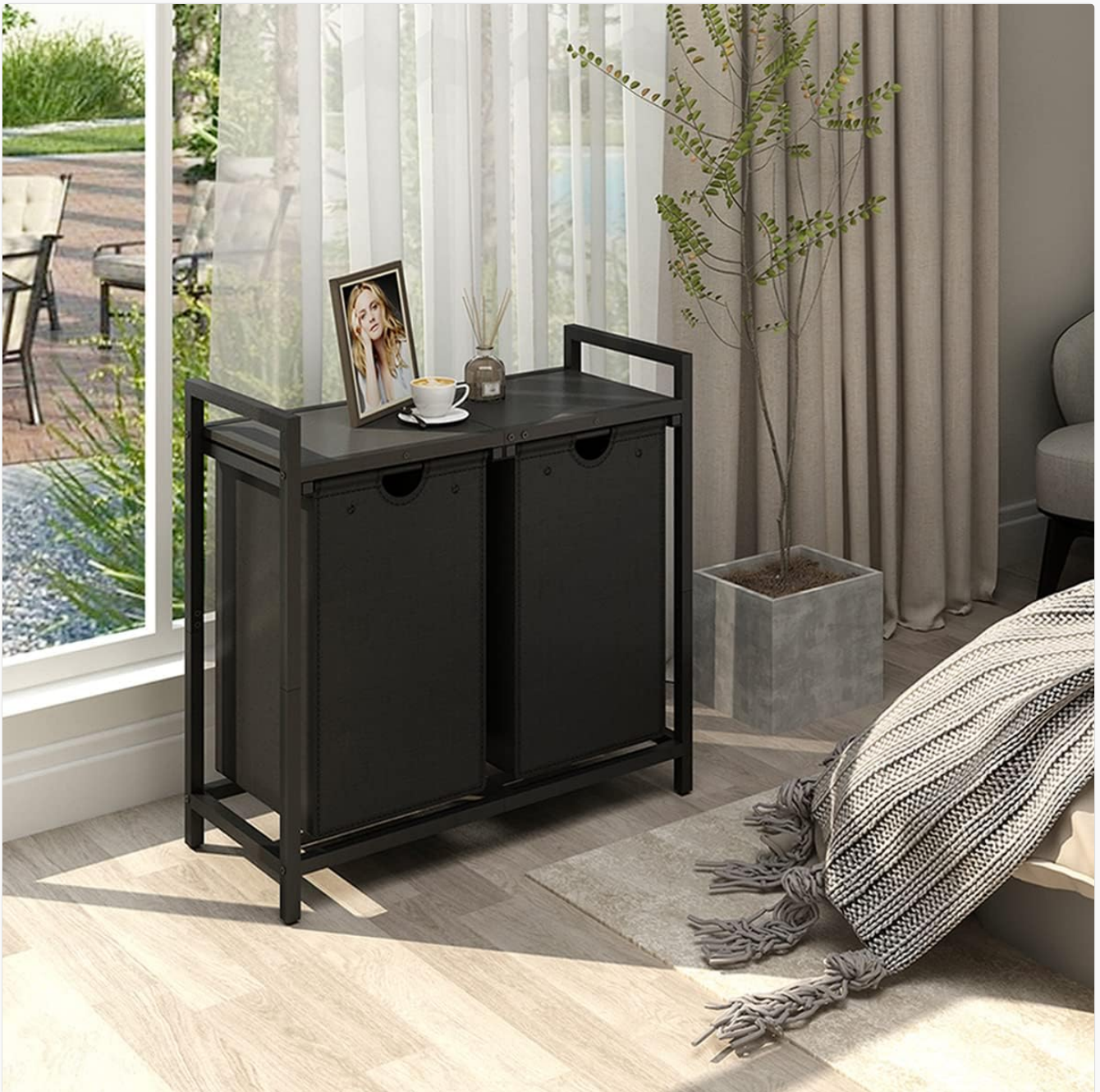
Figure 4.1: Demonstrating the easy pull-out feature of the laundry bags.

To remove a laundry bag, simply pull it forward from its compartment. The bags are designed to slide out smoothly. Use the integrated handles to carry the bag to your laundry area. When finished, slide the bag back into its designated slot.