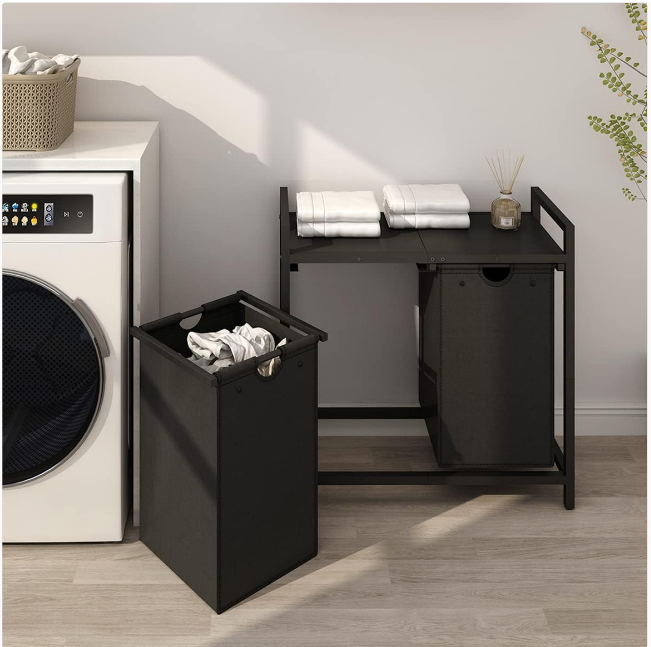
Figure 4.2: The laundry bag fully removed from the hamper for convenient transport.