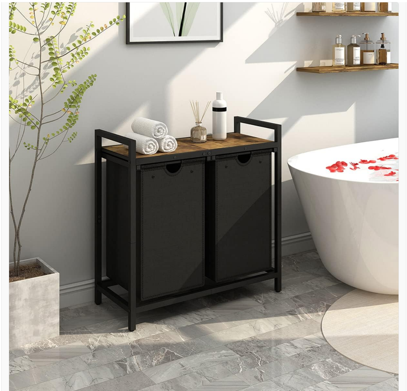
Figure 4.3: The hamper in a bathroom setting, illustrating the utility of the top shelf.