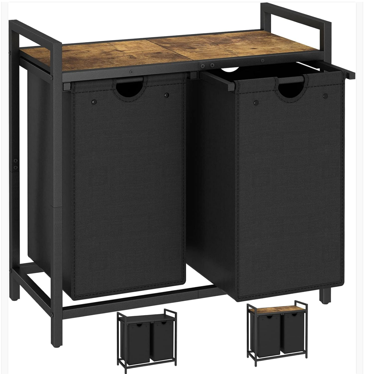
Figure 1.1: The LAATOOREE Laundry Hamper, showcasing its two compartments and top shelf.