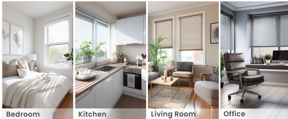
Figure 1.2: Versatility of YELLOW BLINDS across various room settings.

These vinyl blinds offer a warp-resistant structure suitable for various climatic conditions, ensuring a reliable choice for your home decor. The cordless operation provides a safe environment for homes with children and pets.