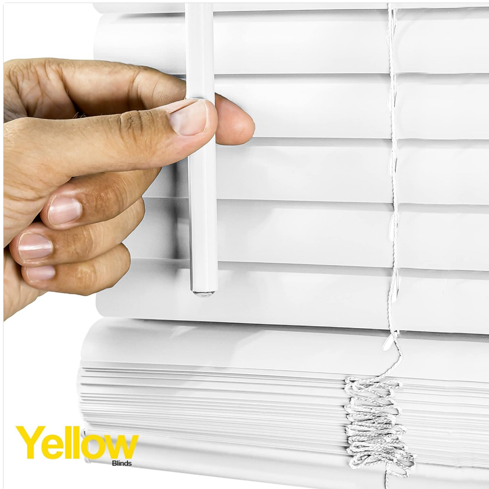
Figure 5.2: Adjusting slat angle with the tilt wand.