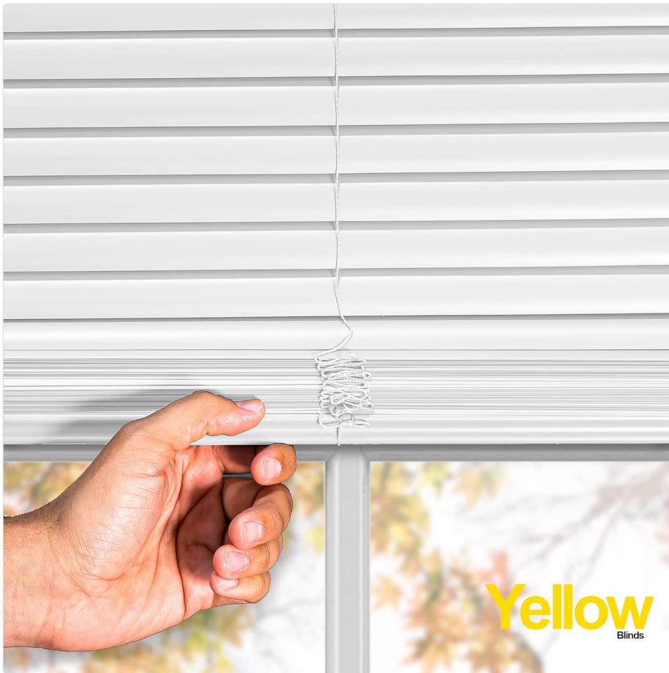
Figure 5.1: Operating the cordless lift mechanism.