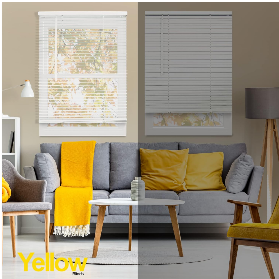
Figure 5.3: Light filtering and blackout capabilities.