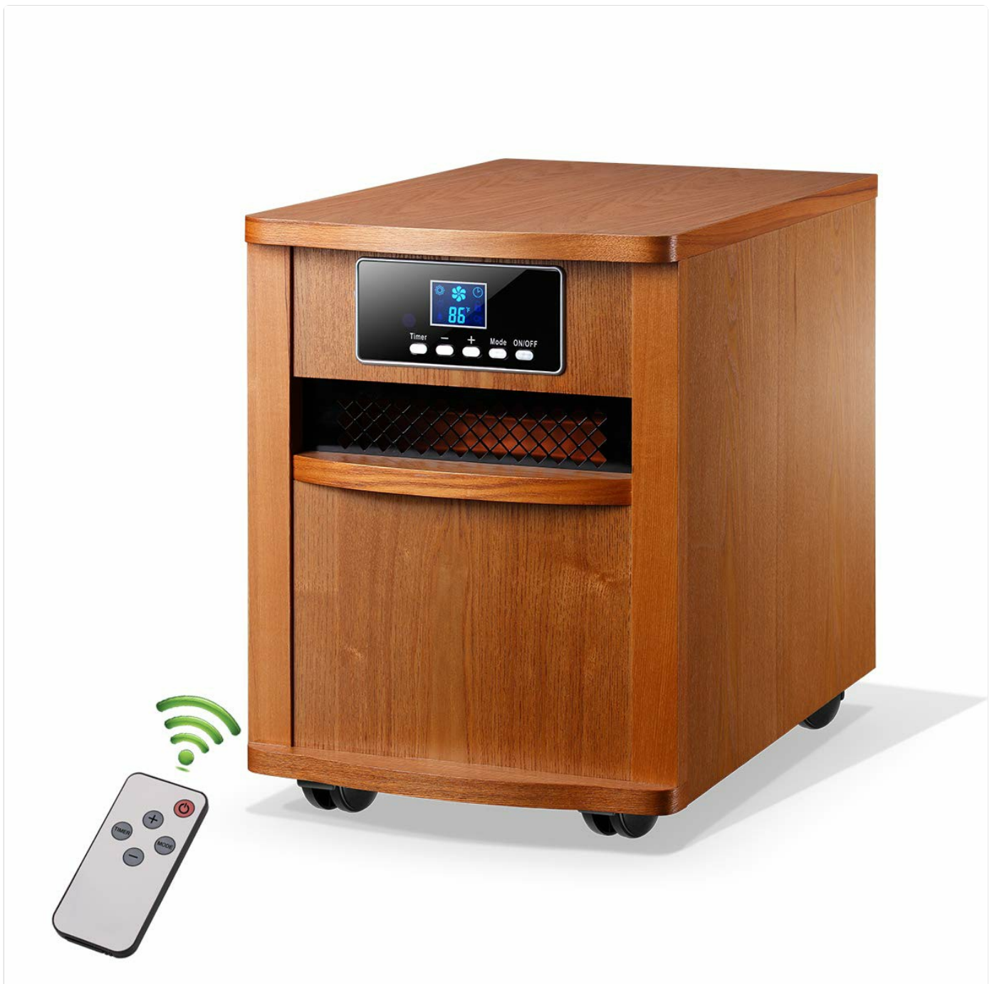
Image: Front view of the Homeleader IWH-01 Electric Infrared Quartz Space Heater, showcasing its wooden cabinet design and digital control panel.

The Homeleader Electric Infrared Quartz Space Heater, Model WH-01, is a portable heating solution designed to provide efficient and comfortable warmth for indoor spaces. This 1500-watt heater features digital controls, a remote control, and multiple safety features to ensure reliable operation. Its compact design and swivel casters allow for easy relocation to different rooms as needed.