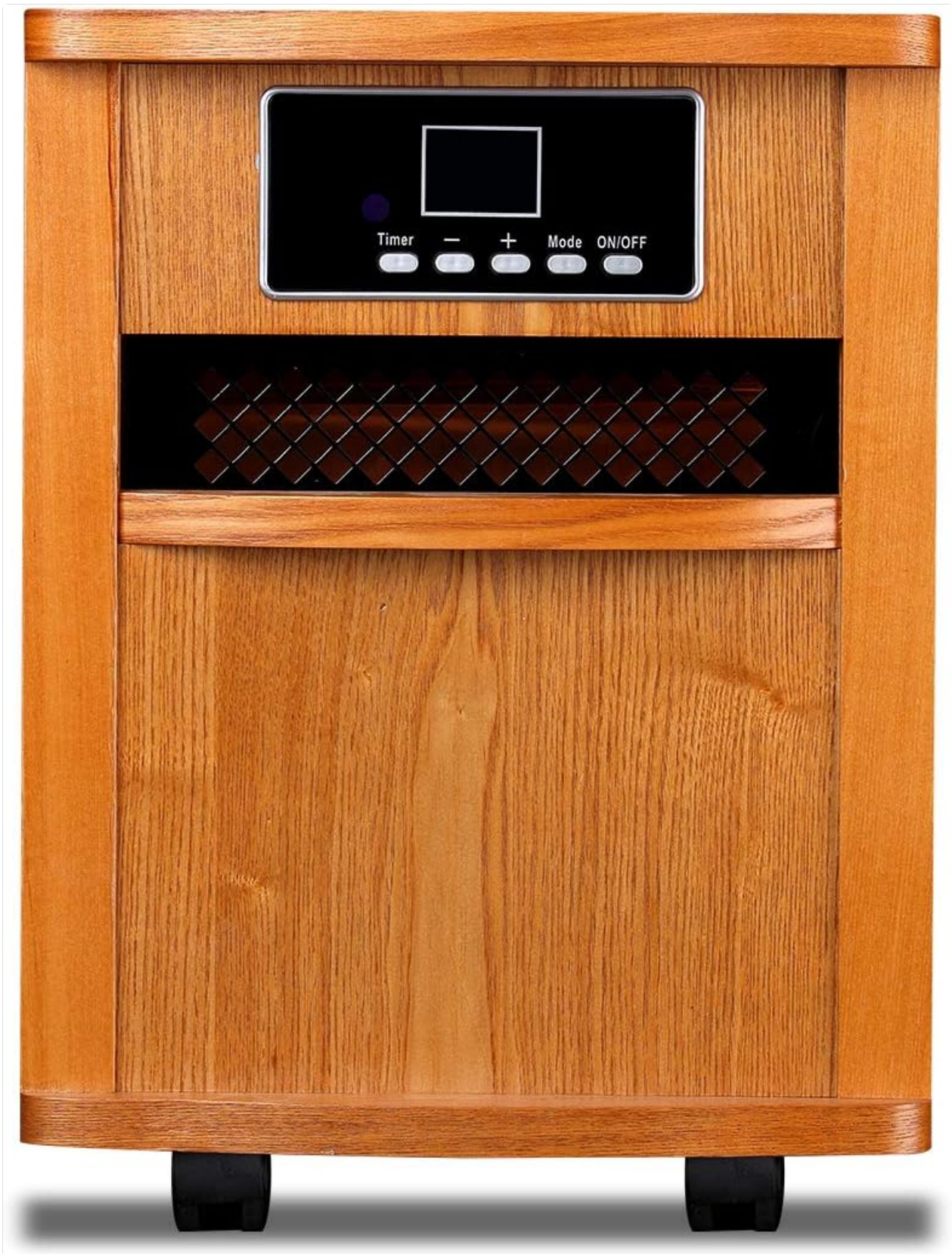
Image: Detailed view of the heater's control panel, highlighting the backlit LED display and the functions of each control button.