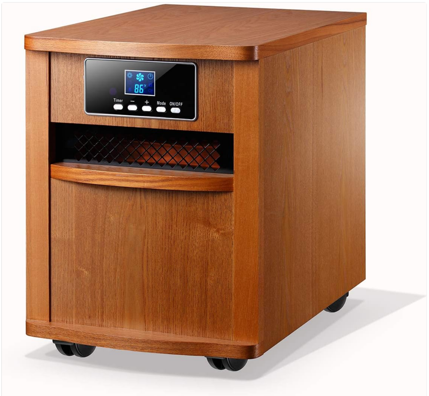
Image: Front view of the Homeleader IWH-01 heater, visually indicating its key features: LED display, washable filter, timer switch, and swivel casters.