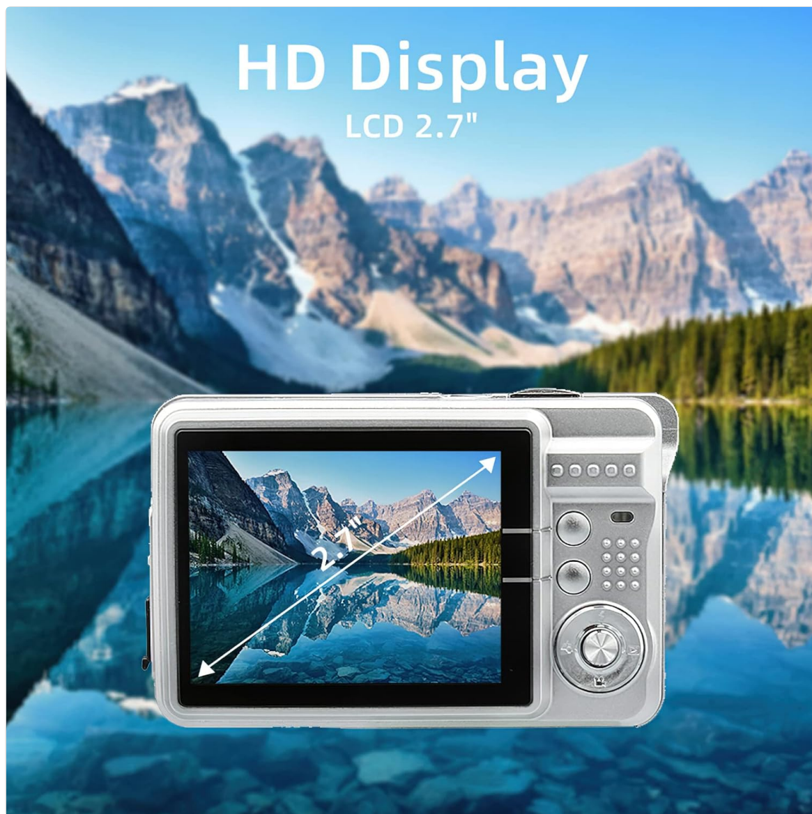
Figure 8: The camera's 2.7-inch LCD display showing a clear image, emphasizing its HD capability.