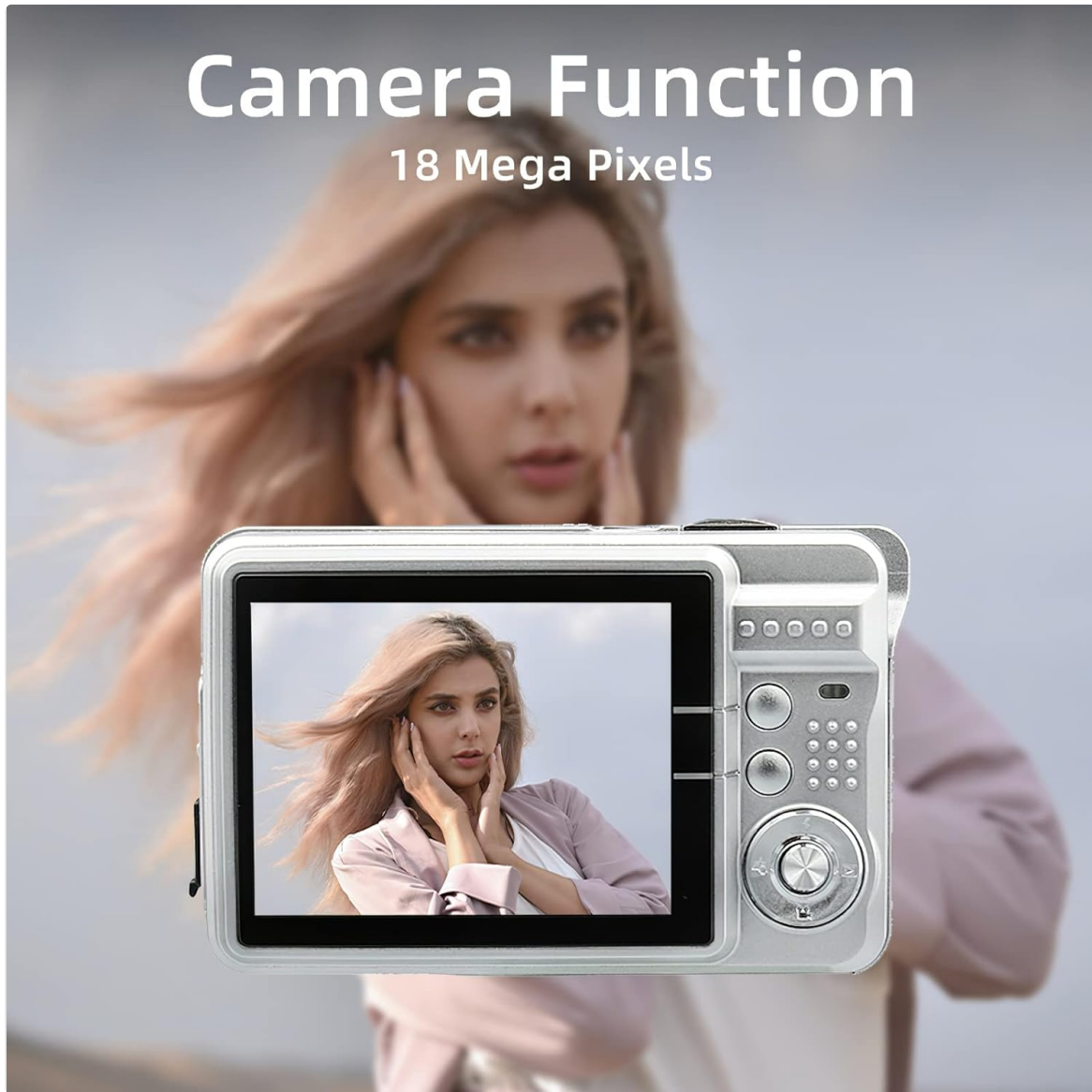
Figure 5: The camera's display showing a captured image, demonstrating its 18 Megapixel photo capability.