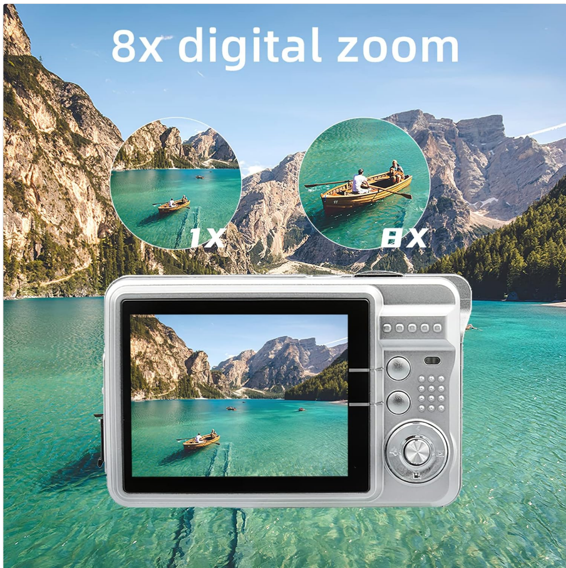
Figure 7: A visual comparison on the camera's screen demonstrating the effect of 8X digital zoom.