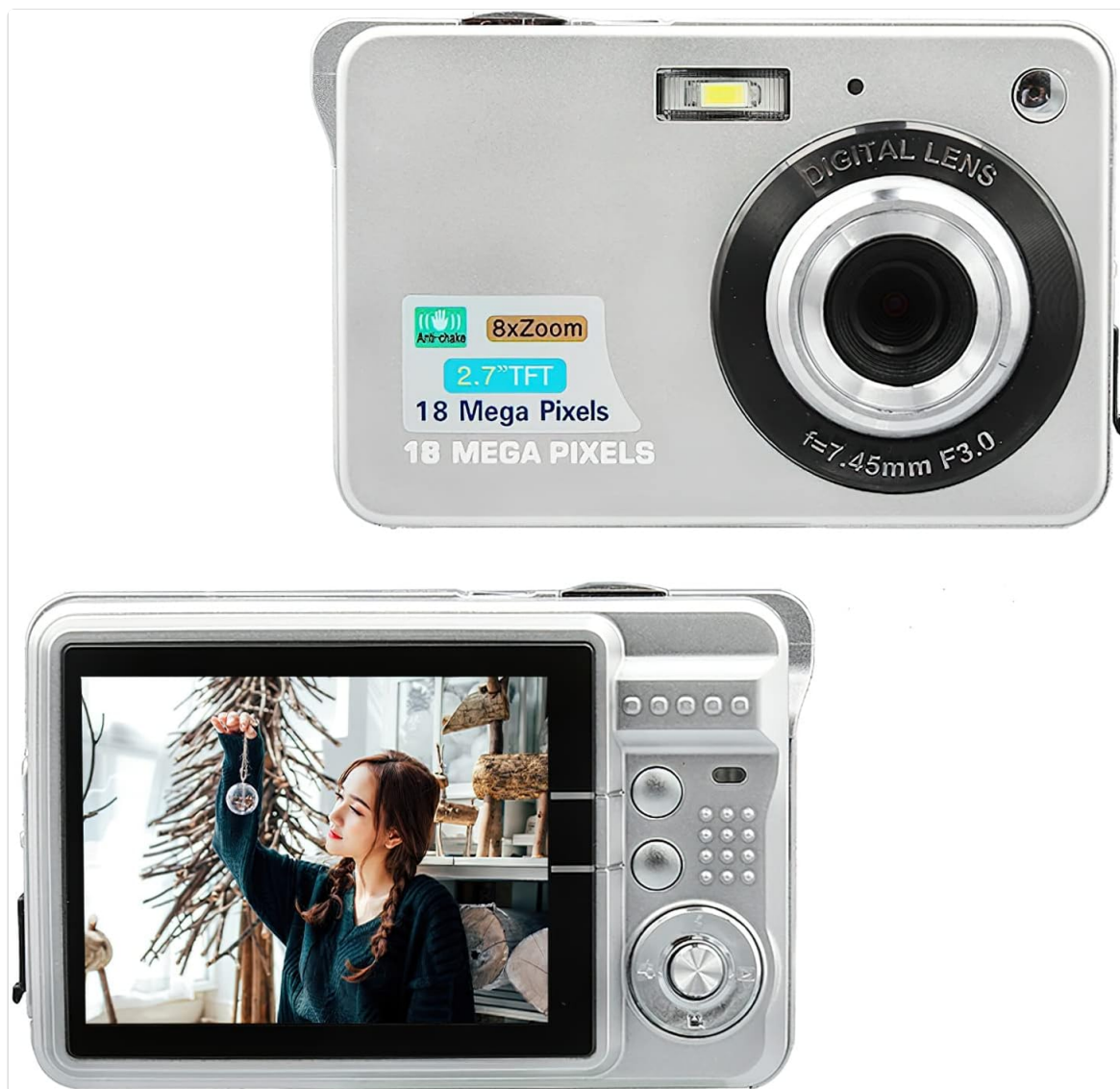
Figure 1: Front and back view of the Andoer Portable 720P Digital Camera, showcasing its compact design and display screen.