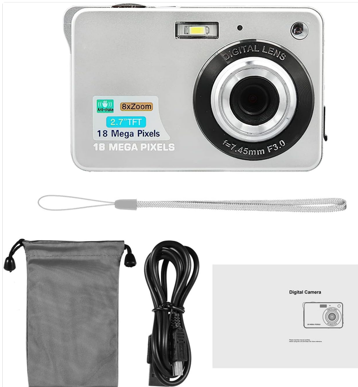
Figure 2: Contents of the Andoer Digital Camera package, including the camera, wrist strap, carry bag, USB cable, and user manual.