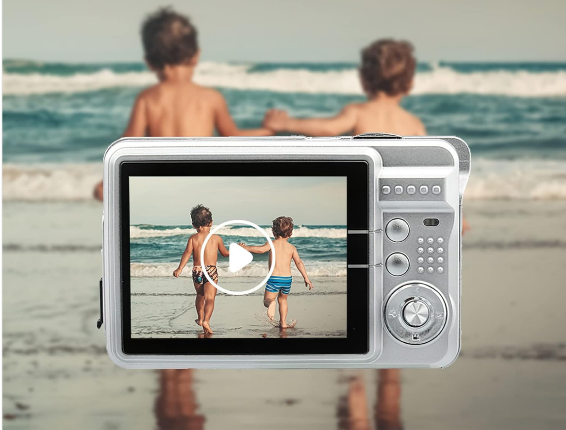
Figure 6: The camera's display showing a video playback, indicating its 720P high-definition video recording function.

1280x720 High Definition Video Recording