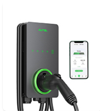
Image 4.2: Multiple screenshots of the Autel Charge app, showcasing its user-friendly interface for comprehensive management of EV charging, including energy statistics and scheduling options.