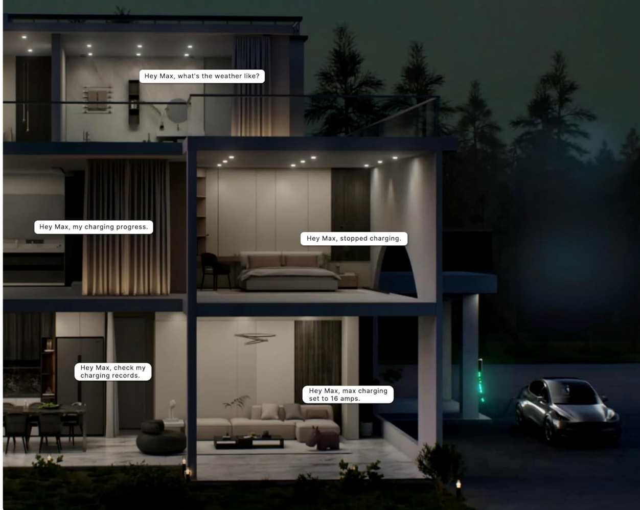
Image 4.3: An illustration of the Smart AI Charging feature, depicting an EV charging at home with voice commands for controlling and monitoring the charging process.