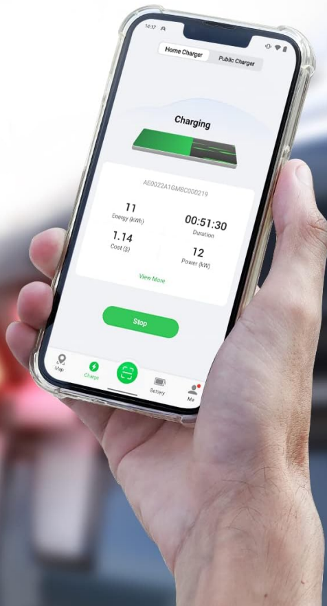
Image 4.1: The Autel Charge app interface on a smartphone, demonstrating its capabilities for scheduling, monitoring, and real-time status updates of the EV charging process.