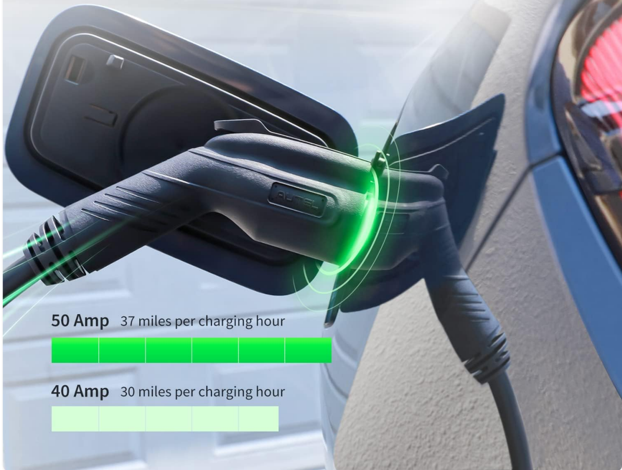
Image 1.1: The Autel MaxiCharger Home connected to an electric vehicle, illustrating high-speed charging capabilities. The display shows charging progress and estimated range gain per hour.