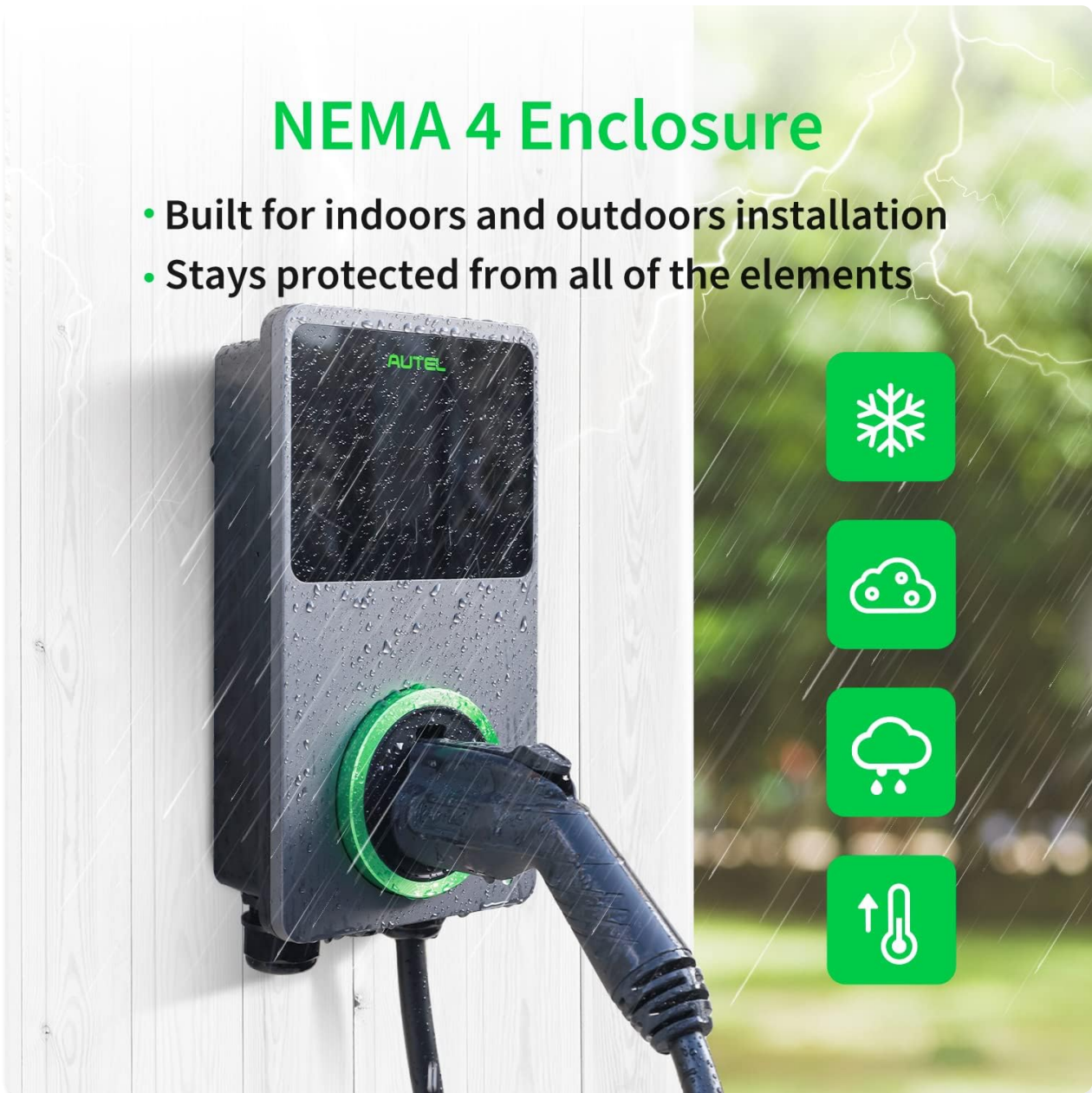
Image 2.2: The Autel MaxiCharger Home shown in an outdoor setting during rain, illustrating its NEMA 4X enclosure designed to withstand various weather conditions and protect against environmental elements.