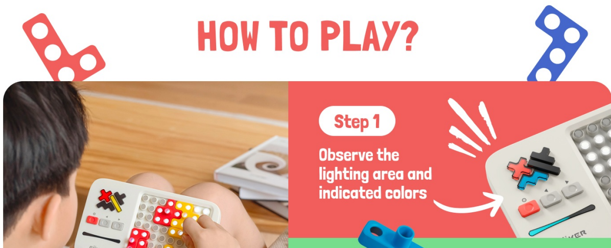
Figure 3: Observing the Challenge Pattern