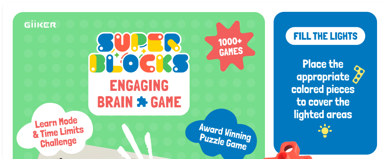
Figure 4: Engaging Brain Game with 1000+ Challenges