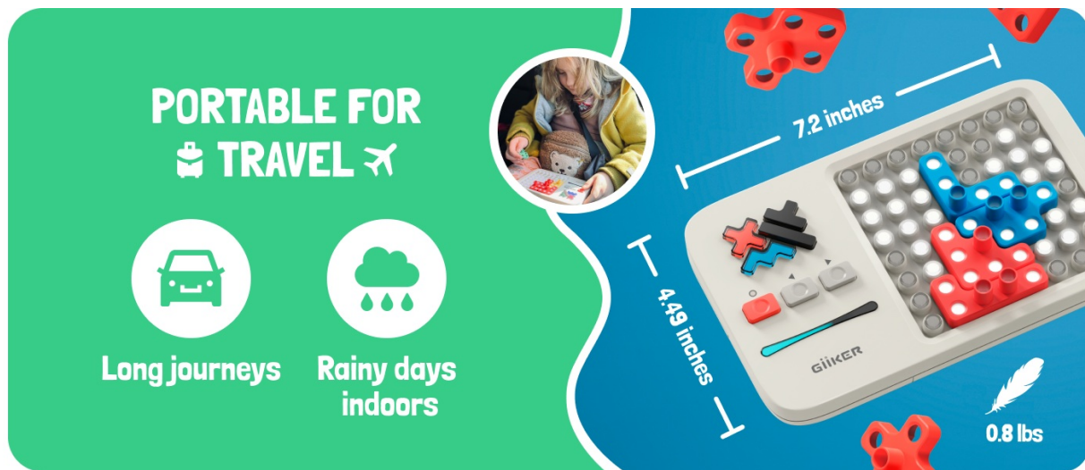
Figure 5: Portable Design for Easy Storage and Travel