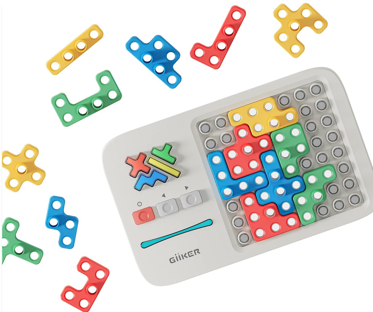
Figure 1: GiiKER Super Blocks Device and Puzzle Pieces