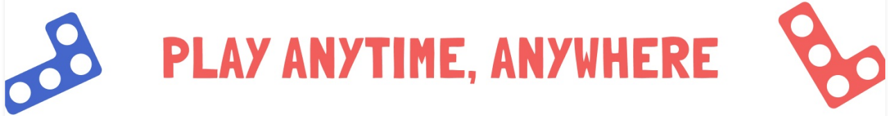
Figure 2: Puzzle Pieces and Main Unit