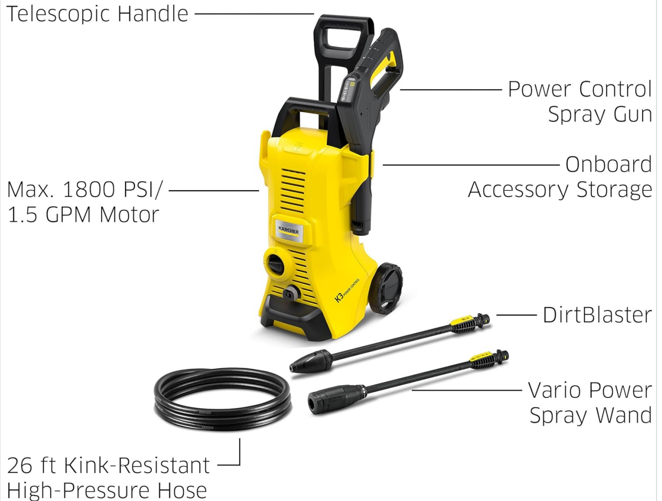
Figure 5.3: The Kärcher K3 Power Control effectively removes light to moderate dirt and grime from various surfaces.