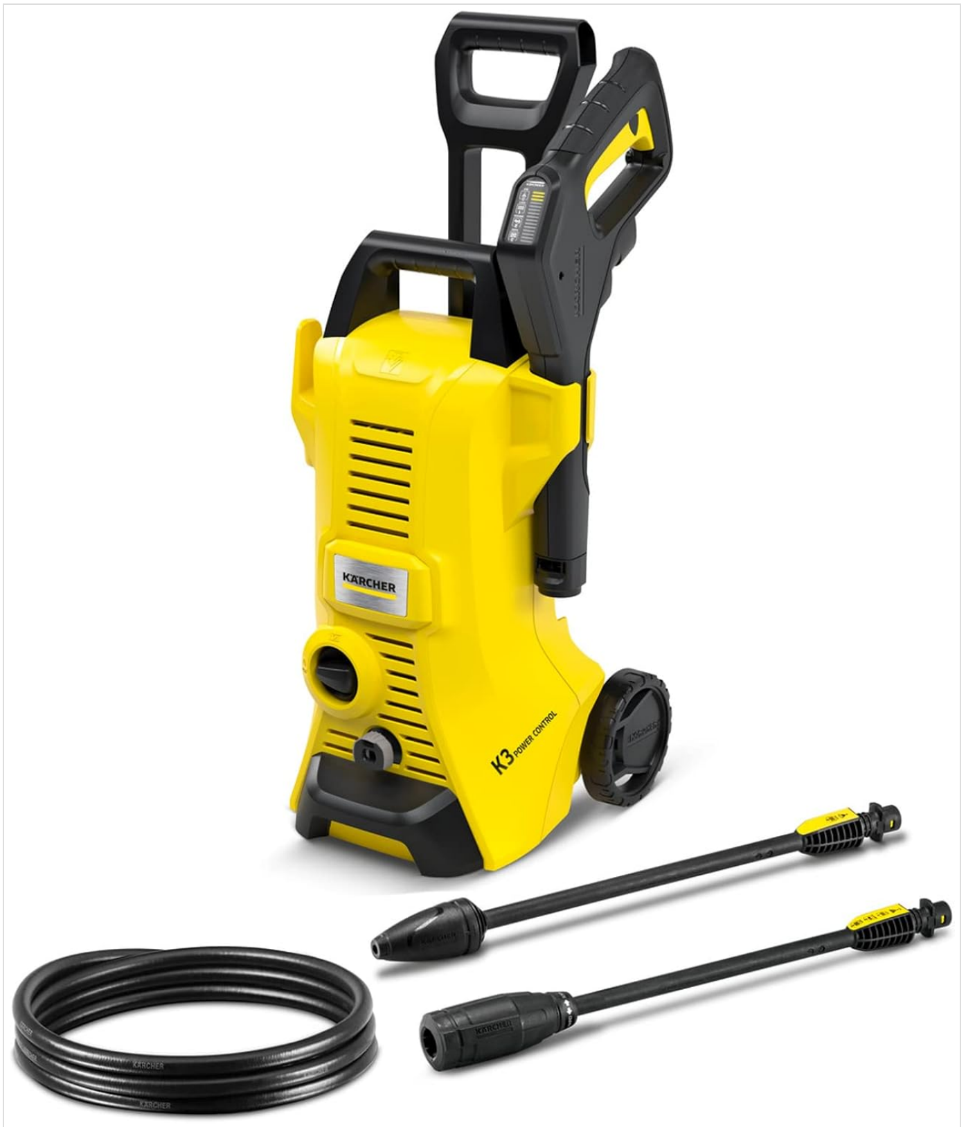
Figure 3.1: Kärcher K3 Power Control Pressure Washer with included accessories: main unit, high-pressure hose, Vario Power spray wand, and DirtBlaster spray wand.