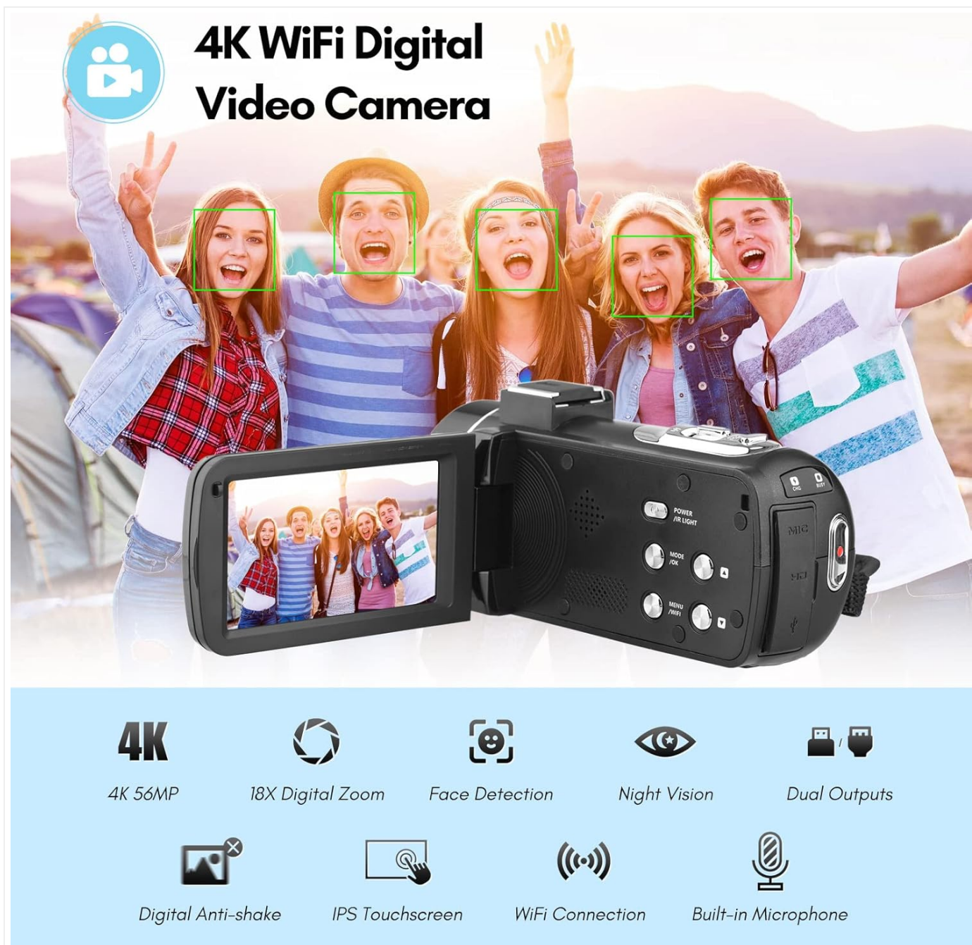
Image: An infographic highlighting the camera's main features including 4K 56MP resolution, 18X Digital Zoom, Face Detection, Night Vision, Dual Outputs, Digital Anti-shake, IPS Touchscreen, WiFi Connection, and Built-in Microphone.