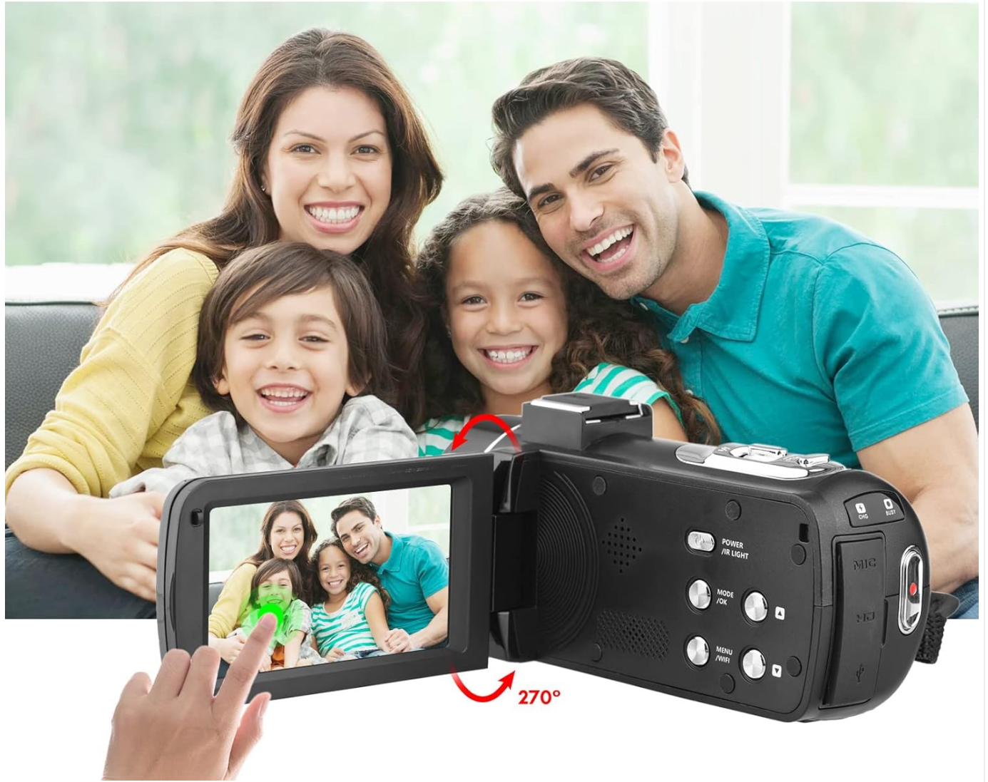
Image: The Andoer camera with its 3.0-inch IPS touchscreen rotated, demonstrating its 270-degree rotation capability for flexible viewing and self-recording.

270° rotation design can achieve different viewing angles.