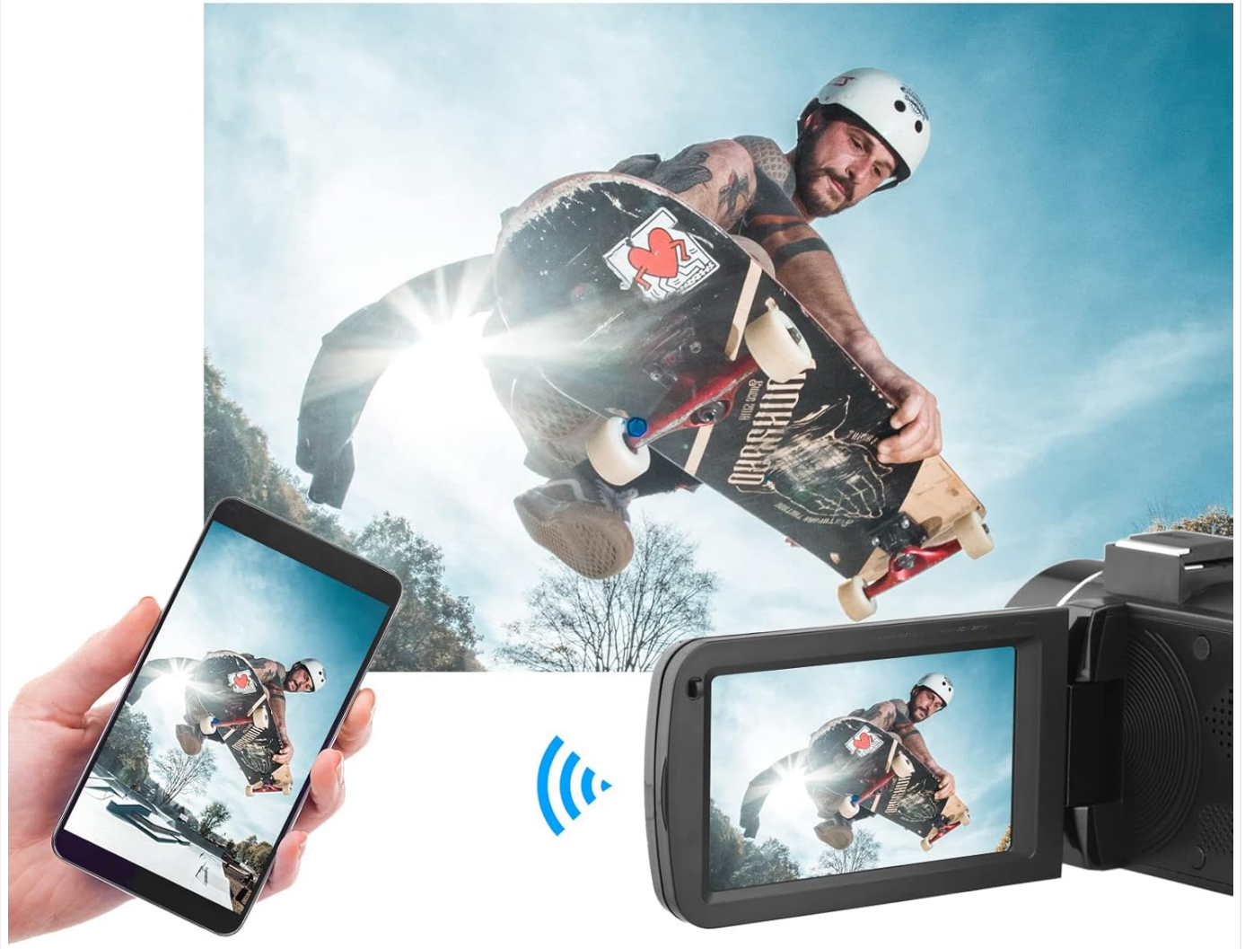
Image: A visual representation of the camera's WiFi function, showing a smartphone connected to the camera to view live footage or transfer files.

Convenient to download and share videos/photos on your smartphone.