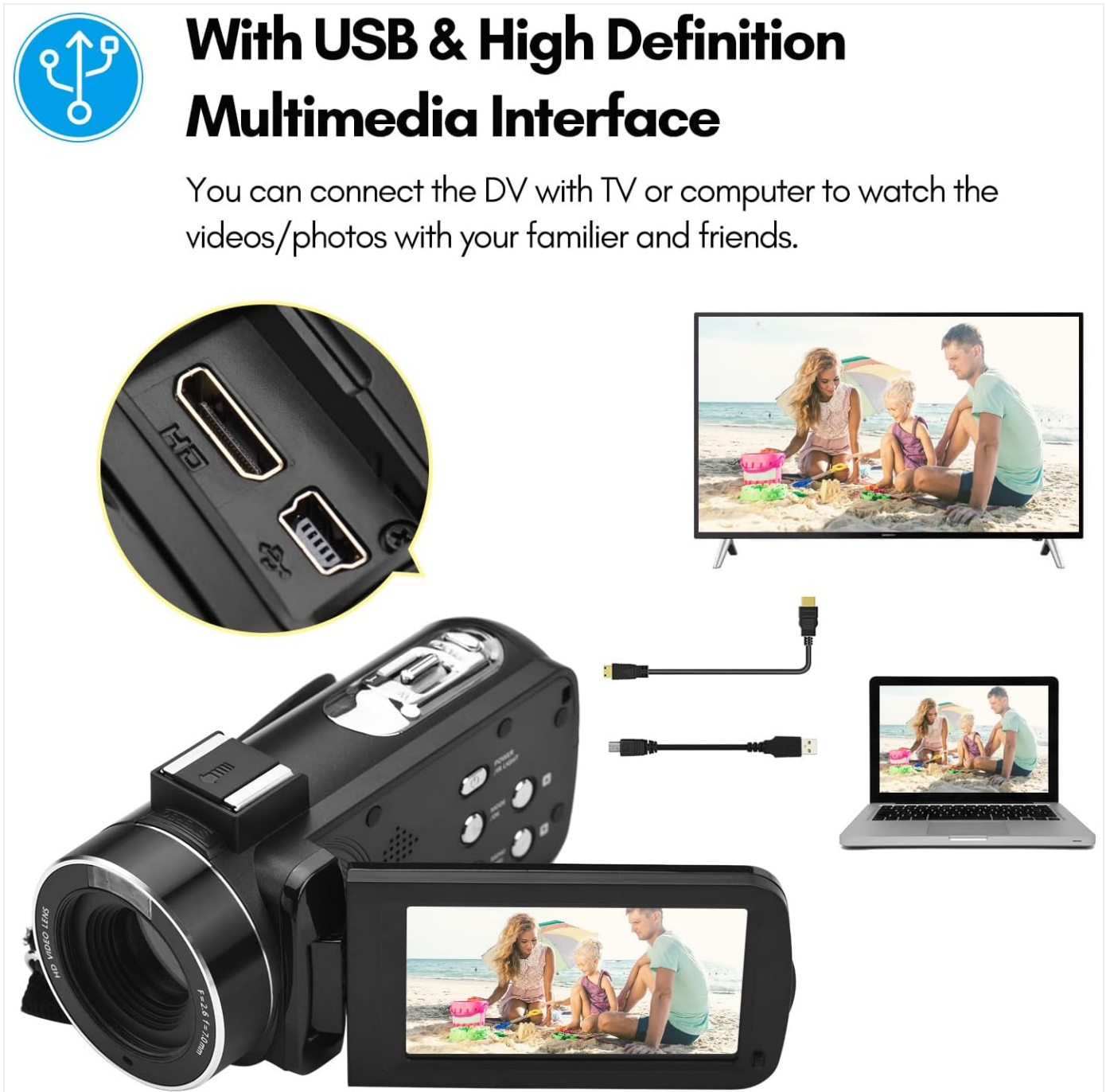
Image: An illustration detailing how to connect the Andoer camera to a television via HD multimedia interface and to a computer via USB for viewing and transferring media.