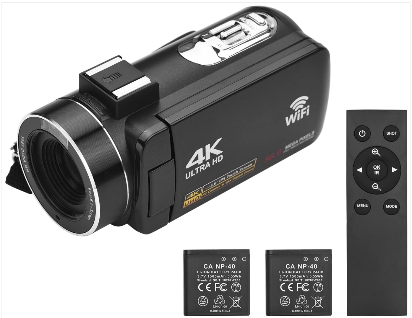
Image: The Andoer 4K Digital Video Camera, remote control, and two NP-40 Li-ion batteries, illustrating the main components included in the package.