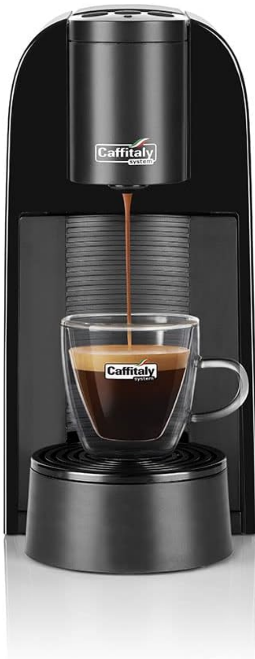
Image: The Caffitaly Volta S35 coffee machine in black, actively dispensing espresso into a clear glass cup. The machine's sleek design and compact footprint are visible.