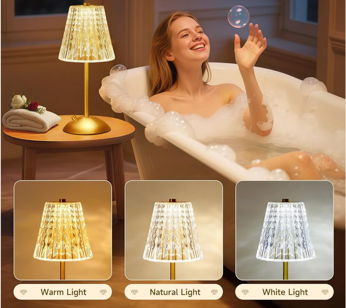
Image: The One Fire Cordless Crystal Lamp displayed in a bathroom setting, showcasing its three distinct color modes: Warm Light, Natural Light, and White Light.