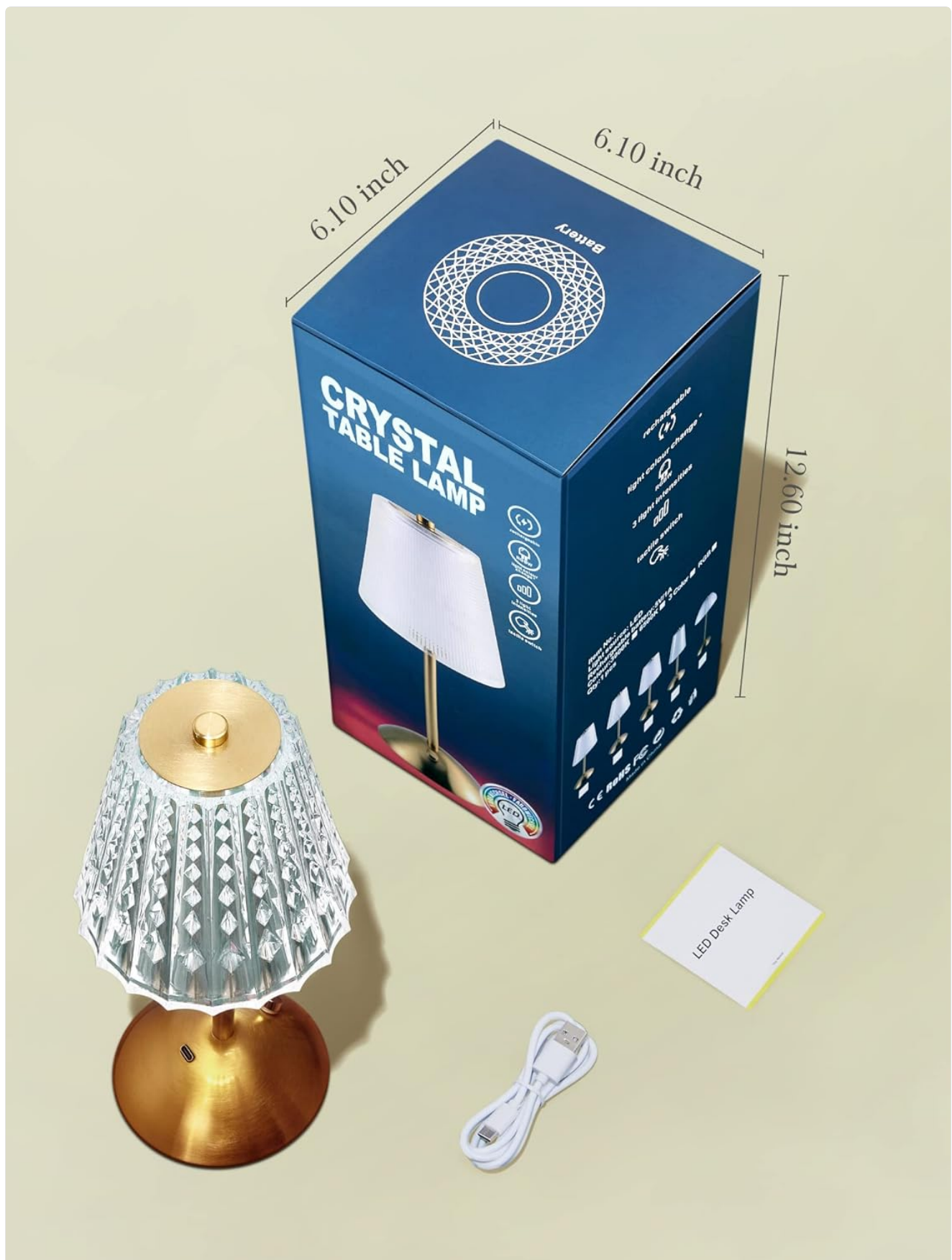
Image: The One Fire Cordless Crystal Lamp packaging, showing the lamp, Type-C charging cable, and instruction manual.