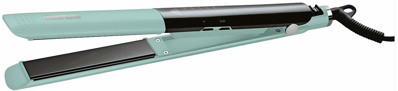
Image: The Cosmopolitan Flat Iron Hair Straightener in its closed position, showcasing its sleek blue and silver design.