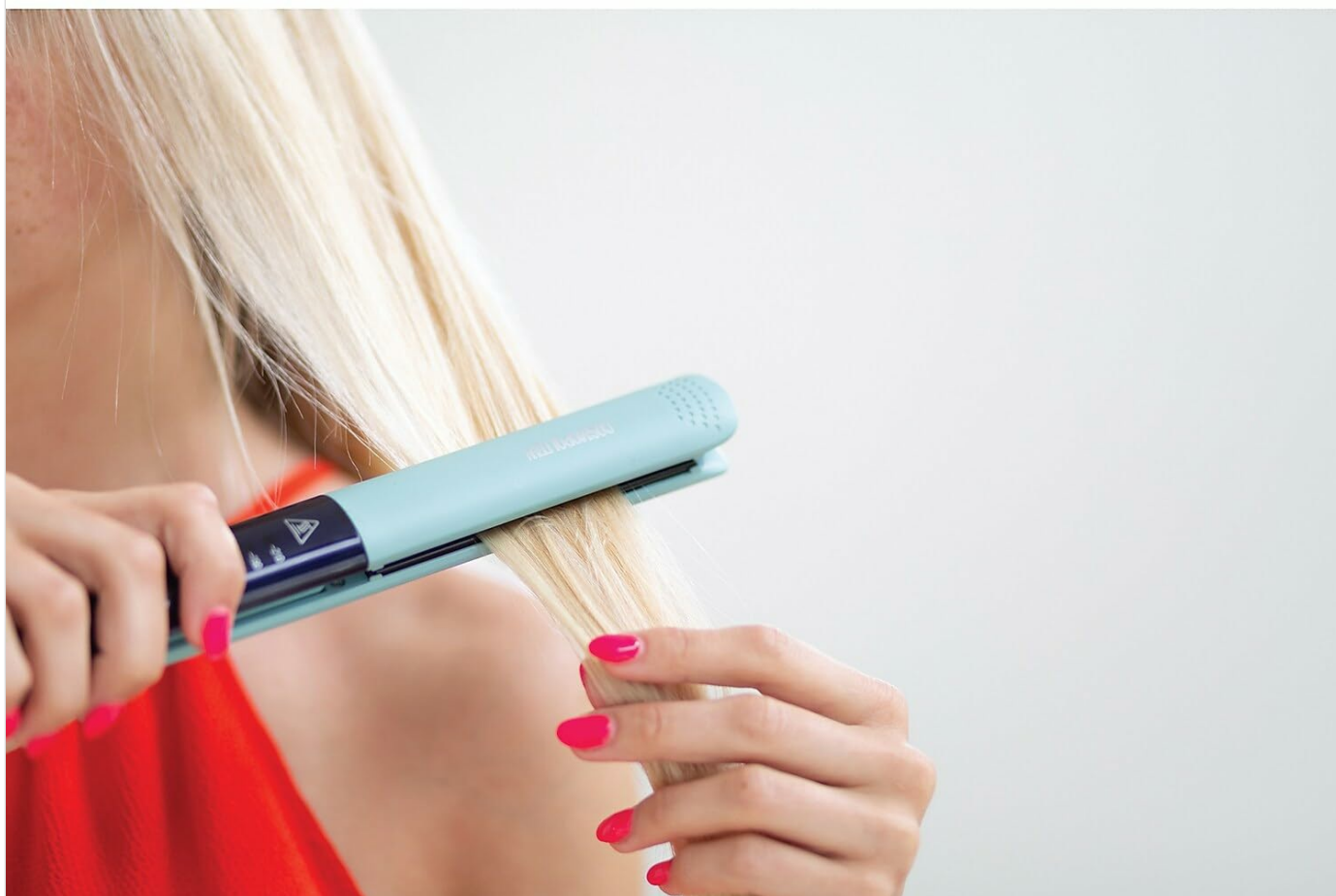
Image: Demonstrating the use of the straightener on a section of hair, highlighting the ease of styling.