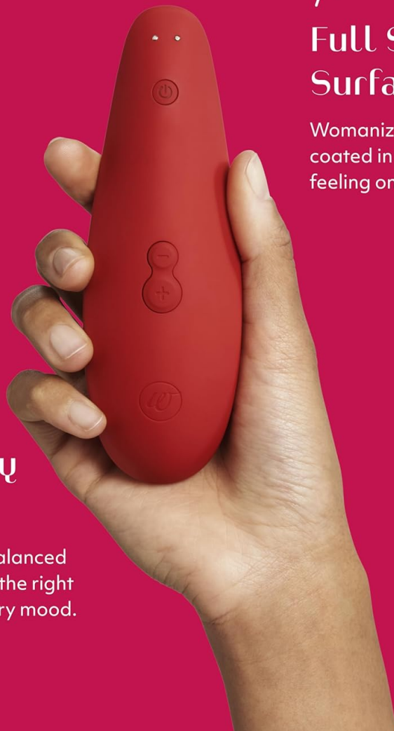
Image: A hand holding the device, highlighting the power and intensity control buttons.

10 perfectly balanced intensity offer the right setting for every mood.