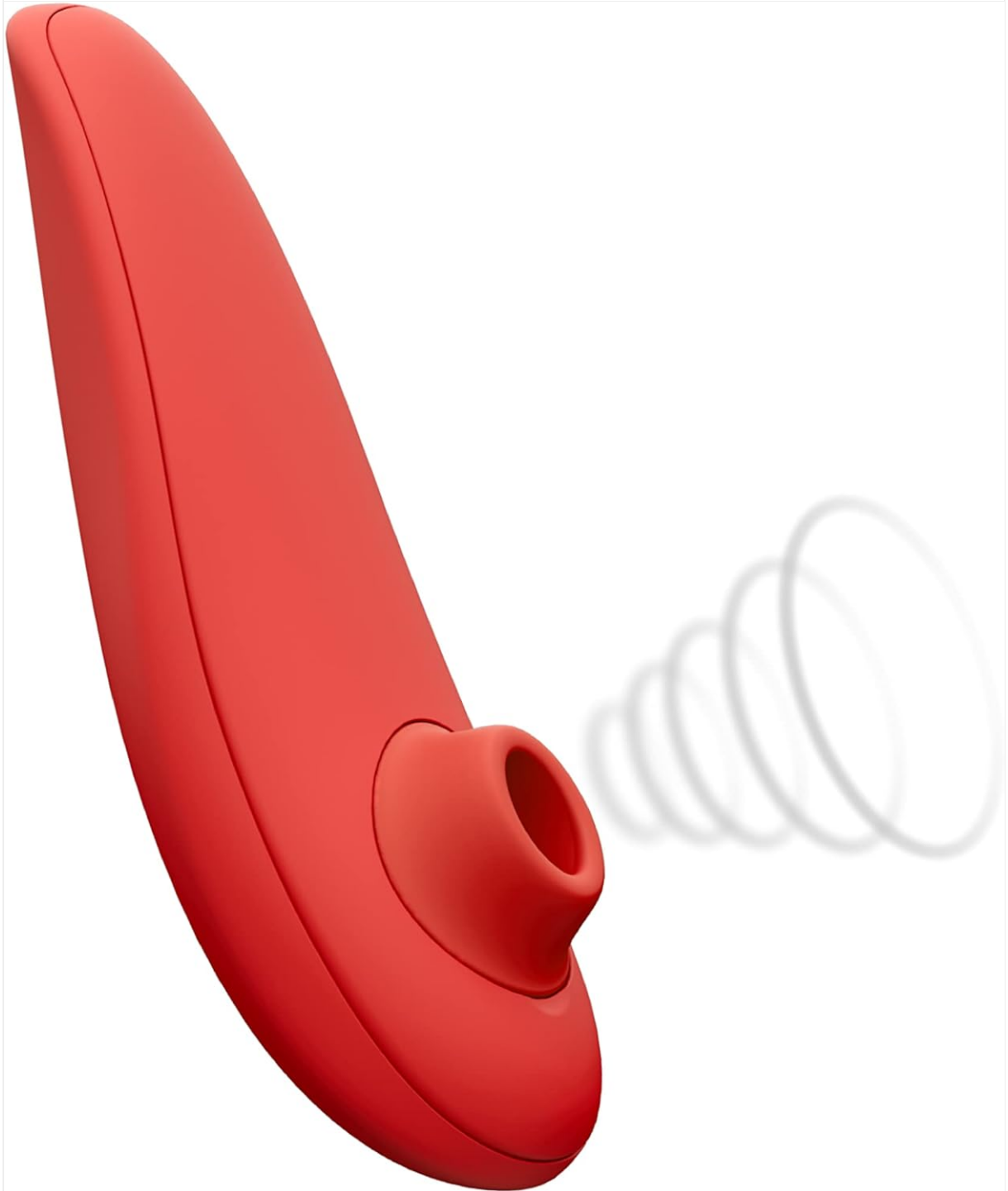
Image: Womanizer Special Edition Clitoral Stimulator in Vivid Red.