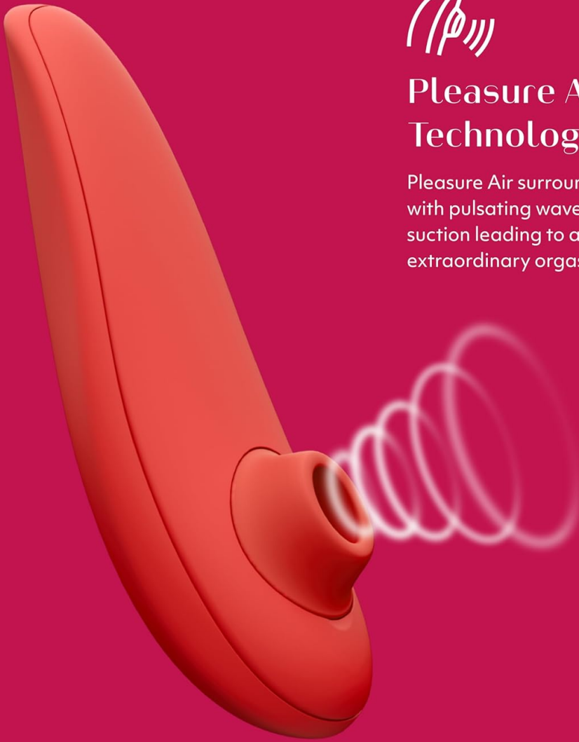
Image: Diagram showing Pleasure Air Technology, which uses pulsating air waves for stimulation.

Pleasure Air surrounds the clitoris with pulsating waves and gentle suction leading to a new kind of extraordinary orgasm.