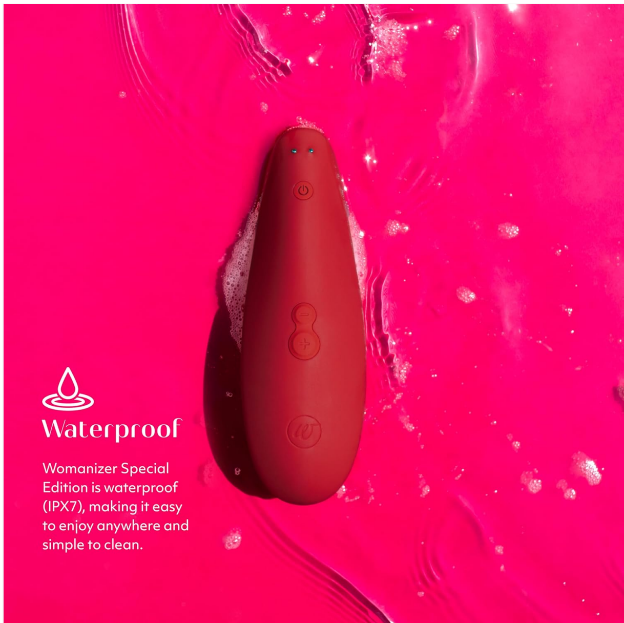
Image: The device shown in water, demonstrating its waterproof capability.