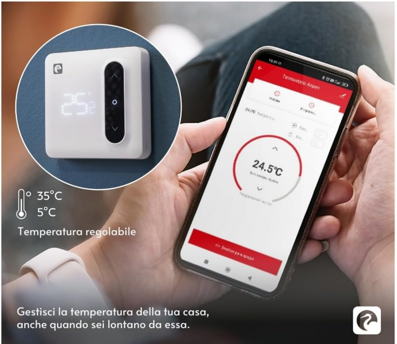
Image: The Garza Smart Wi-Fi Thermostat on a wall, showing its display. A hand holds a smartphone displaying the control app, demonstrating remote temperature management.