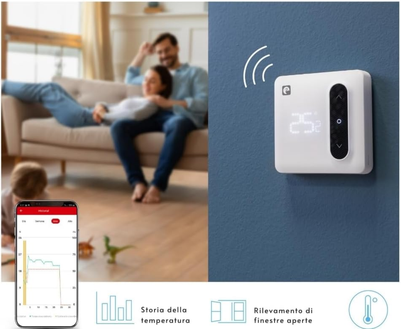
Image: The Garza Smart Wi-Fi Thermostat mounted on a wall, displaying the current temperature. A smartphone screen shows temperature history and icons for open window detection and temperature monitoring.