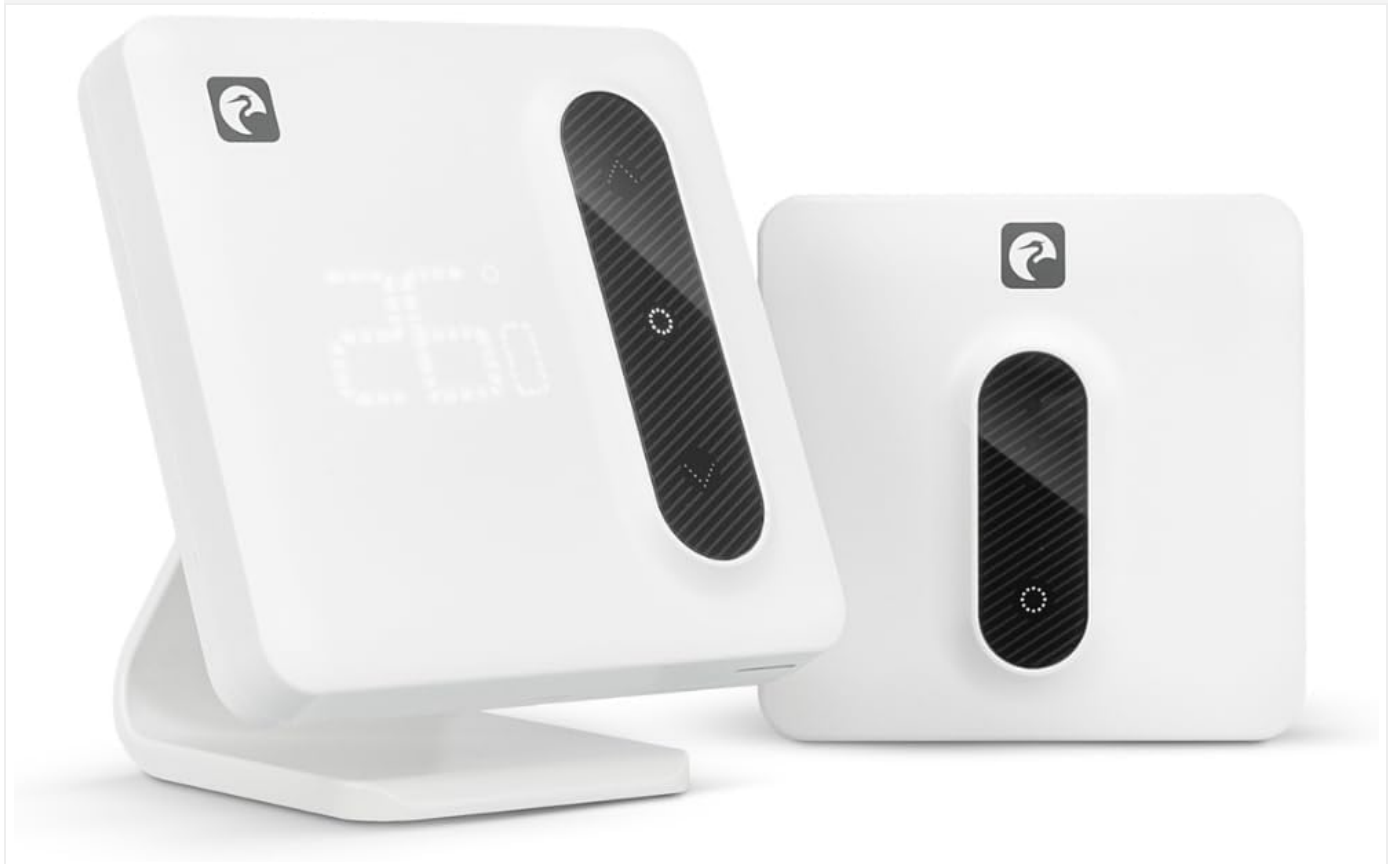
Image: The Garza Smart Wi-Fi Thermostat (left) with its display and control buttons, alongside the compact receiver unit (right).

This manual provides detailed instructions for the installation, configuration, and daily use of your Garza Smart Wi-Fi Thermostat, model 401367G. This device is designed to intelligently control your boiler and heating system, offering convenience and energy efficiency through smart features.