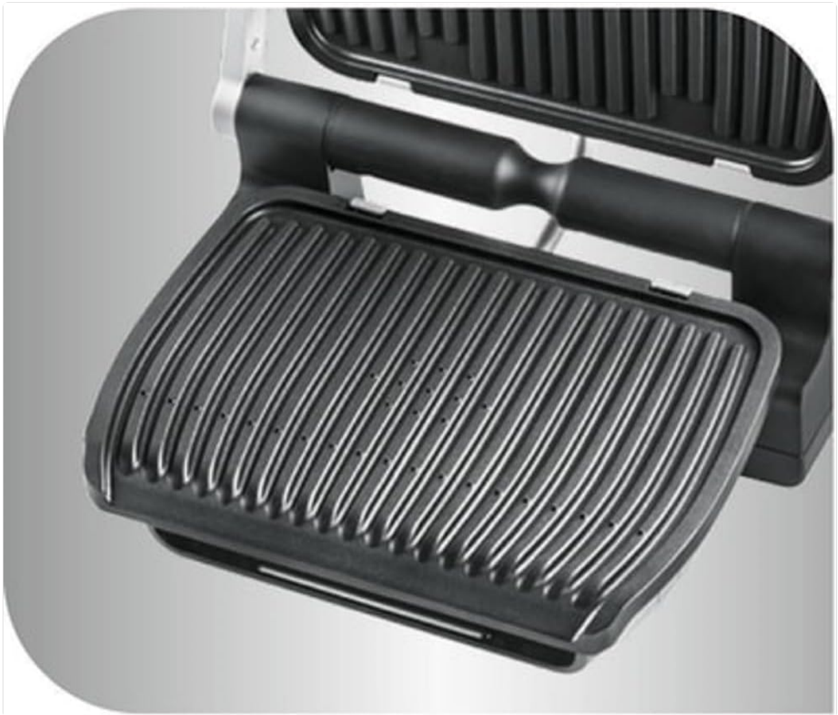
A close-up view of the ribbed non-stick grill plate of the OptiGrill GC705816.