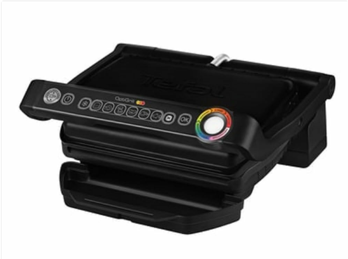
The Tefal OptiGrill GC705816 Contact Grill, ready for use.