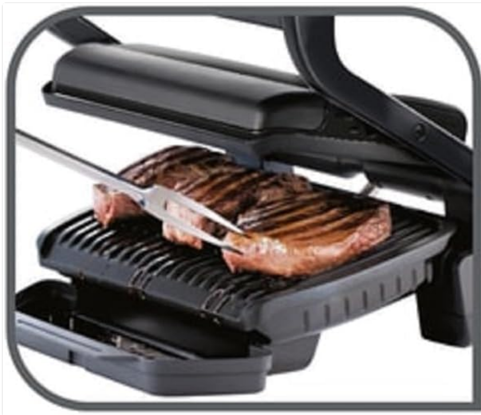
Two steaks being grilled on the Tefal OptiGrill GC705816, showing grill marks.