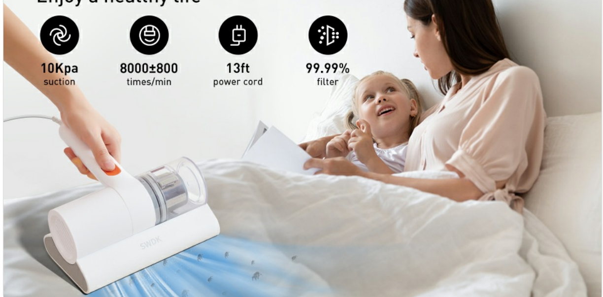
Key Performance Indicators: Illustrates 10KPa suction, 8000 beats/min, 13ft power cord, and 99.99% filtration efficiency.