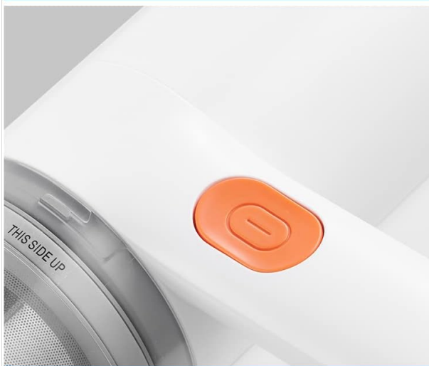
One button switch