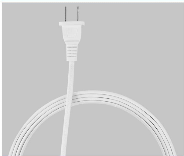
13ft power cord

Design Details: Close-up views of the air outlet, comfortable grips, single button switch, and the 13-foot power cord.