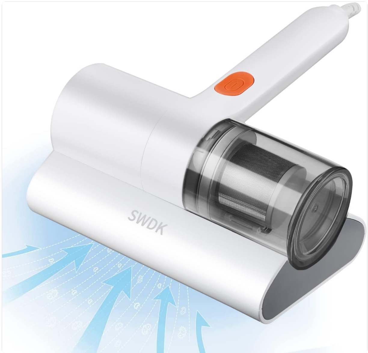
Overall View: The compact and lightweight design of the SWDK Bed Vacuum Cleaner.