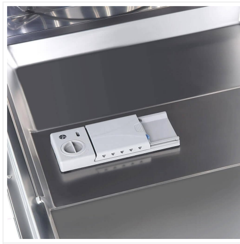
Detergent and rinse aid dispenser.