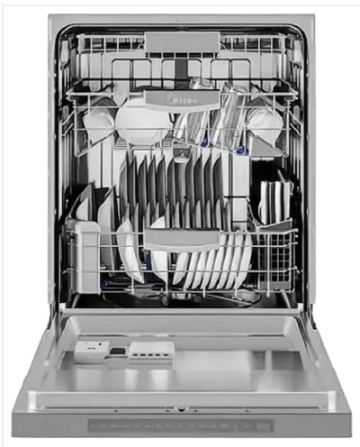
Dishwasher interior with dishes loaded, showing the lower and upper racks.

Proper loading ensures optimal cleaning performance. The Midea MDT24P5AST features versatile loading options, including a 3rd rack and adjustable tines.