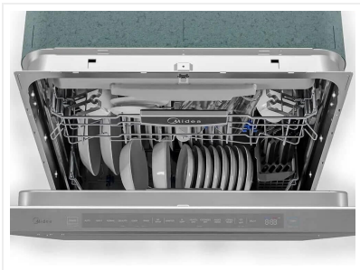
Top-down view of the dishwasher interior, fully loaded with various dishware.