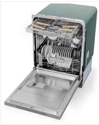
Side view of the dishwasher interior, showing the third rack for utensils.