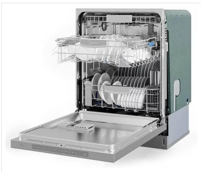
Side view of the dishwasher interior, highlighting the adjustable upper rack.