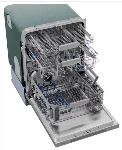
Dishwasher interior with both racks pulled out, showing the spacious design.