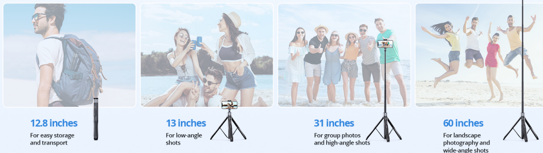
Image 5.1: Demonstrating the full range of motion for the phone holder.

To be a must have for group photos, selfies, FaceTime, especially for your personal outdoor