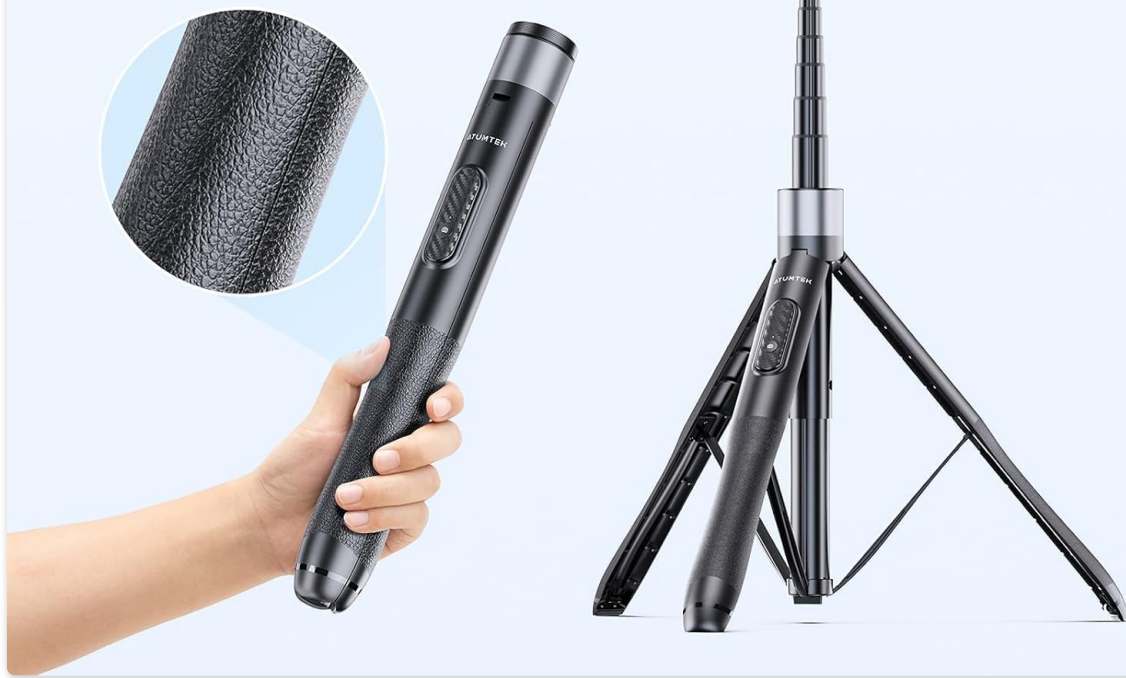
Image 3.2: The ergonomic gripping handle and integrated one-piece design for ease of use and portability.

Hands-friendly gripping with lychee texture