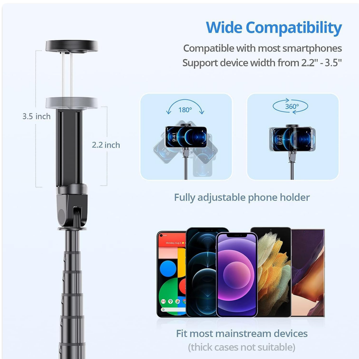
Image 4.2: The phone holder's adjustable width and compatibility with various smartphone models.