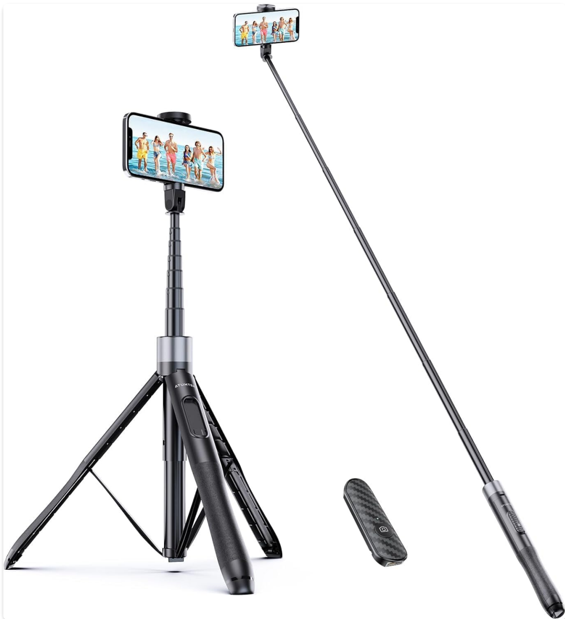
Image 1.1: The ATUMTEK 60" Selfie Stick Tripod, showcasing its versatility as both a selfie stick and a tripod, along with its Bluetooth remote.