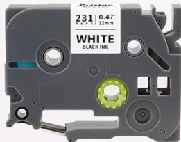
Compatible Tze-Fx231 *1