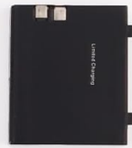
Lithium polymer Battery *1

Image: An electrician using the Pristar PS-100E Label Maker to create and apply labels for wires within an electrical panel, demonstrating its utility in industrial or technical settings for clear identification.