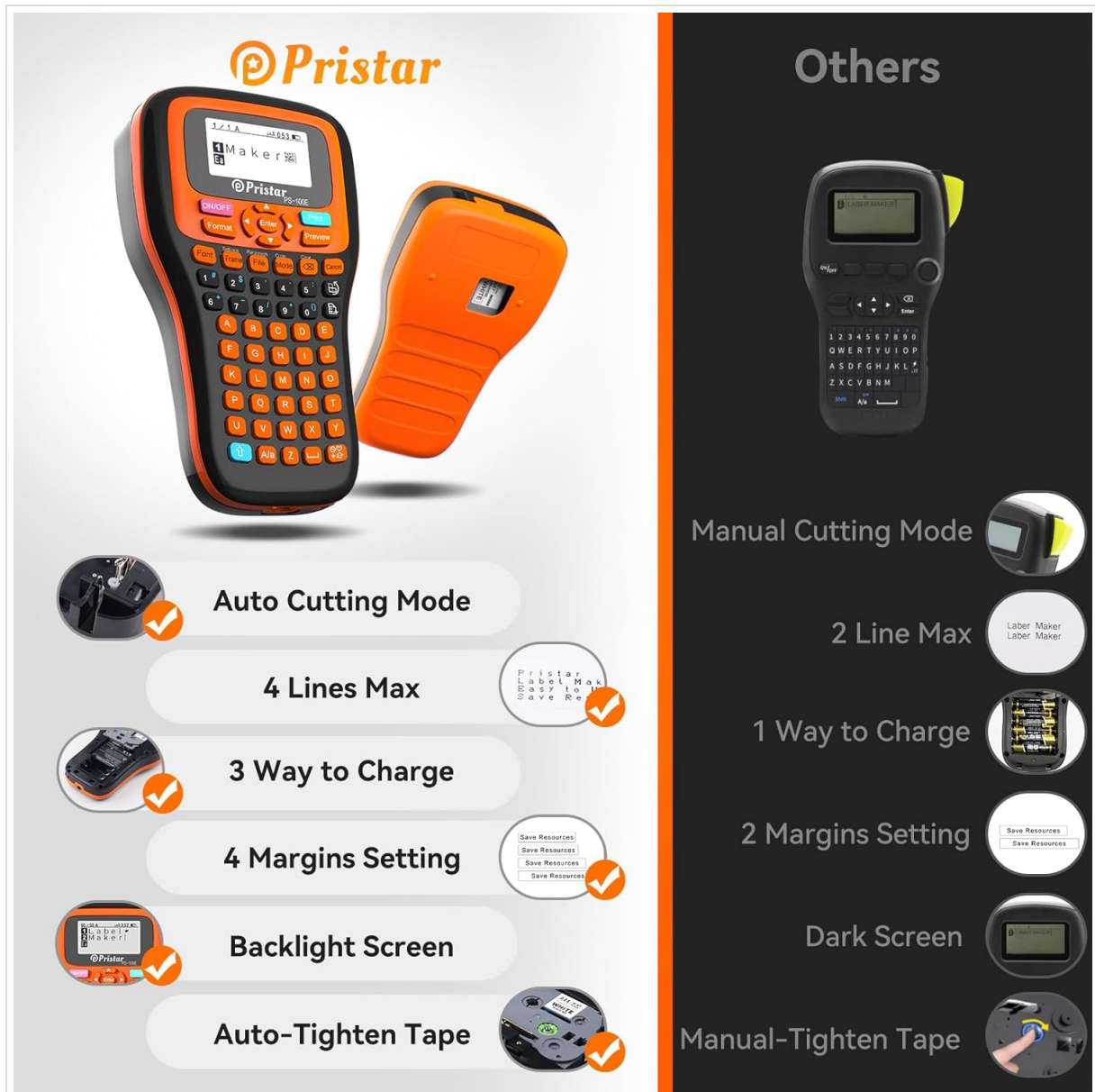
Image: A visual comparison highlighting the advantages of the Pristar PS-100E, including auto-cutting mode, 4-line max printing, 3-way charging, 4 margins setting, backlit screen, and auto-tighten tape feature, contrasted with typical features of other label makers.