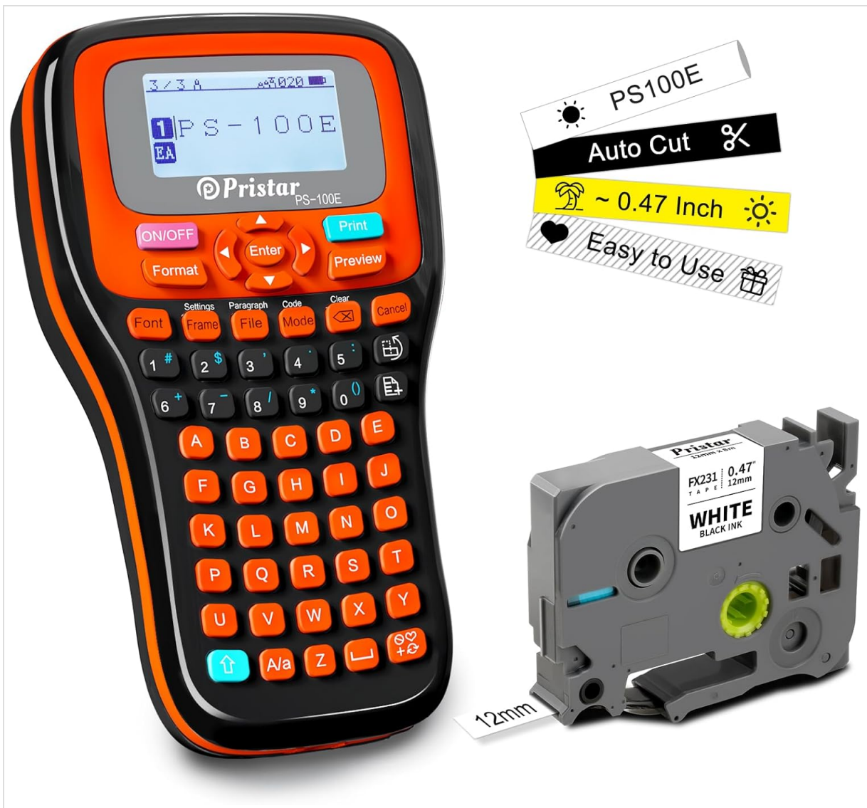
Image: Front view of the Pristar PS-100E Label Maker, highlighting its display, QWERTY keyboard, and key features such as auto-cut functionality and compatibility with 0.47-inch (12mm) tape.