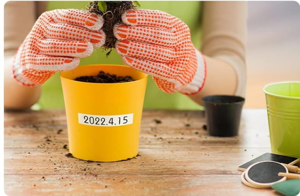
Image: A collage demonstrating diverse applications of the Pristar PS-100E Label Maker, such as labeling small electronic components, network cables, office binders, kitchen spice jars, and plant pots.