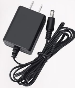
DC Adapter *1