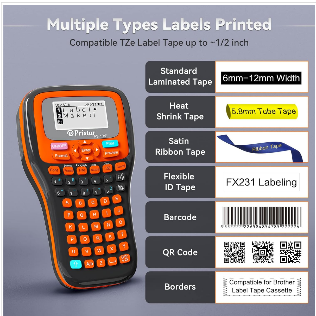
Image: The Pristar PS-100E Label Maker's screen showing examples of various label types it can print, such as standard laminated tape, heat shrink tubes, satin ribbon, flexible ID tape, barcodes, QR codes, and labels with decorative borders.