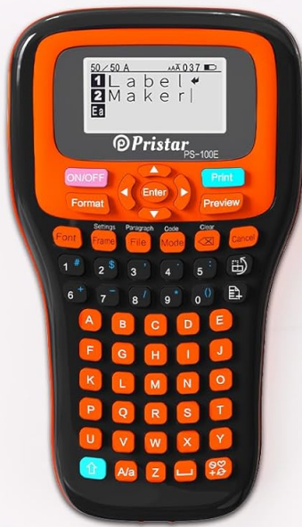
Label Maker *1