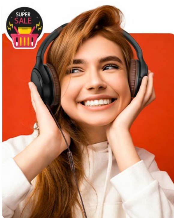
Image: INFUTURE H1 headphones connected via a 3.5mm wired audio cable, demonstrating the Aux mode functionality.