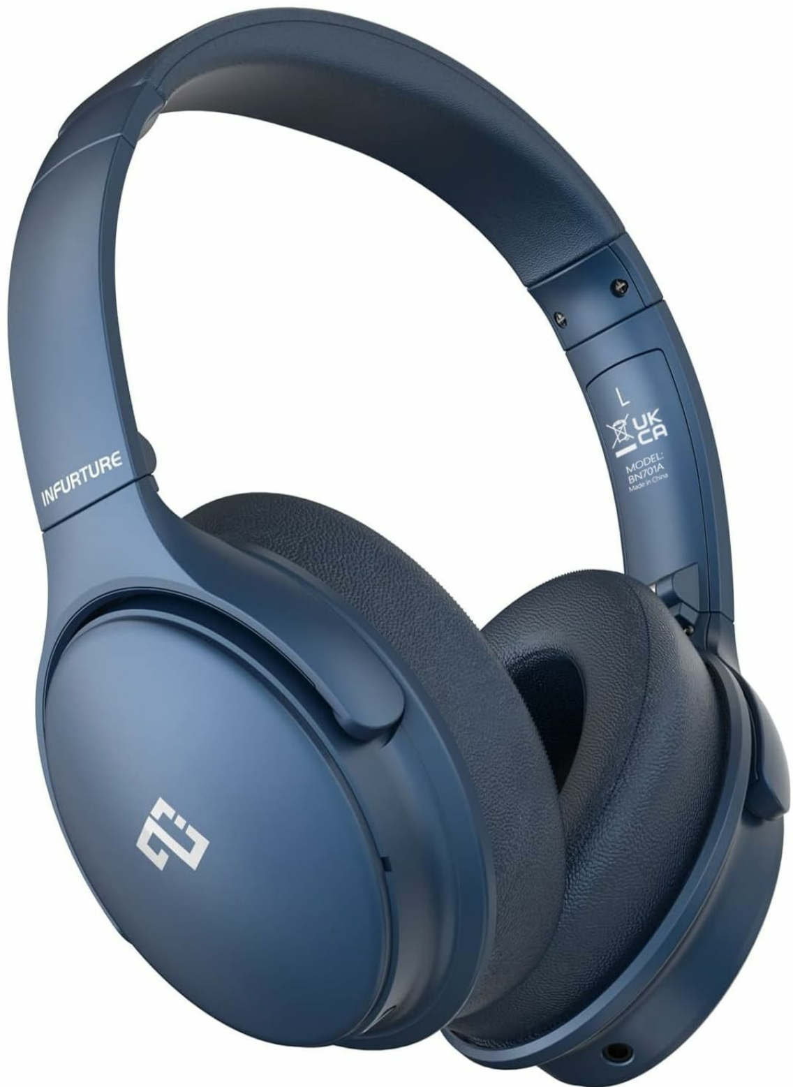
Image: INFUTURE H1 Bluetooth Headphones in blue, showcasing their sleek design.