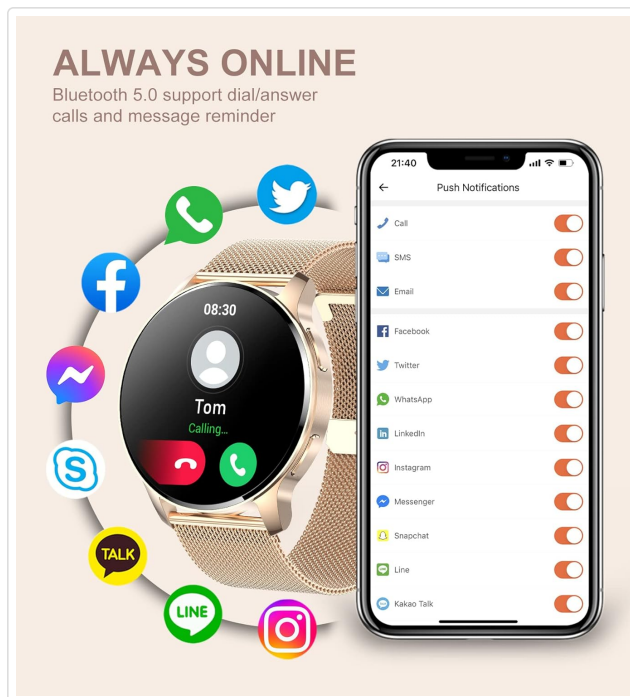
Image: The smart watch displaying an incoming call and icons for various messaging applications.