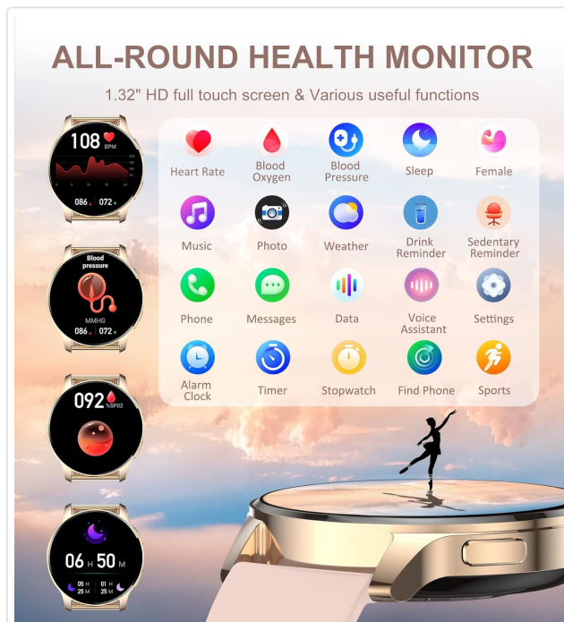
Image: The smart watch interface showing different sports modes and real-time fitness data.

The watch supports 20 sports modes, including walking, running, climbing, cycling, swimming, elliptical, yoga, tennis, and golf. It accurately records all-day activities such as steps, distance, calories burned, active minutes, and heart rate. Data can be synchronized to your phone for analysis and progress tracking.