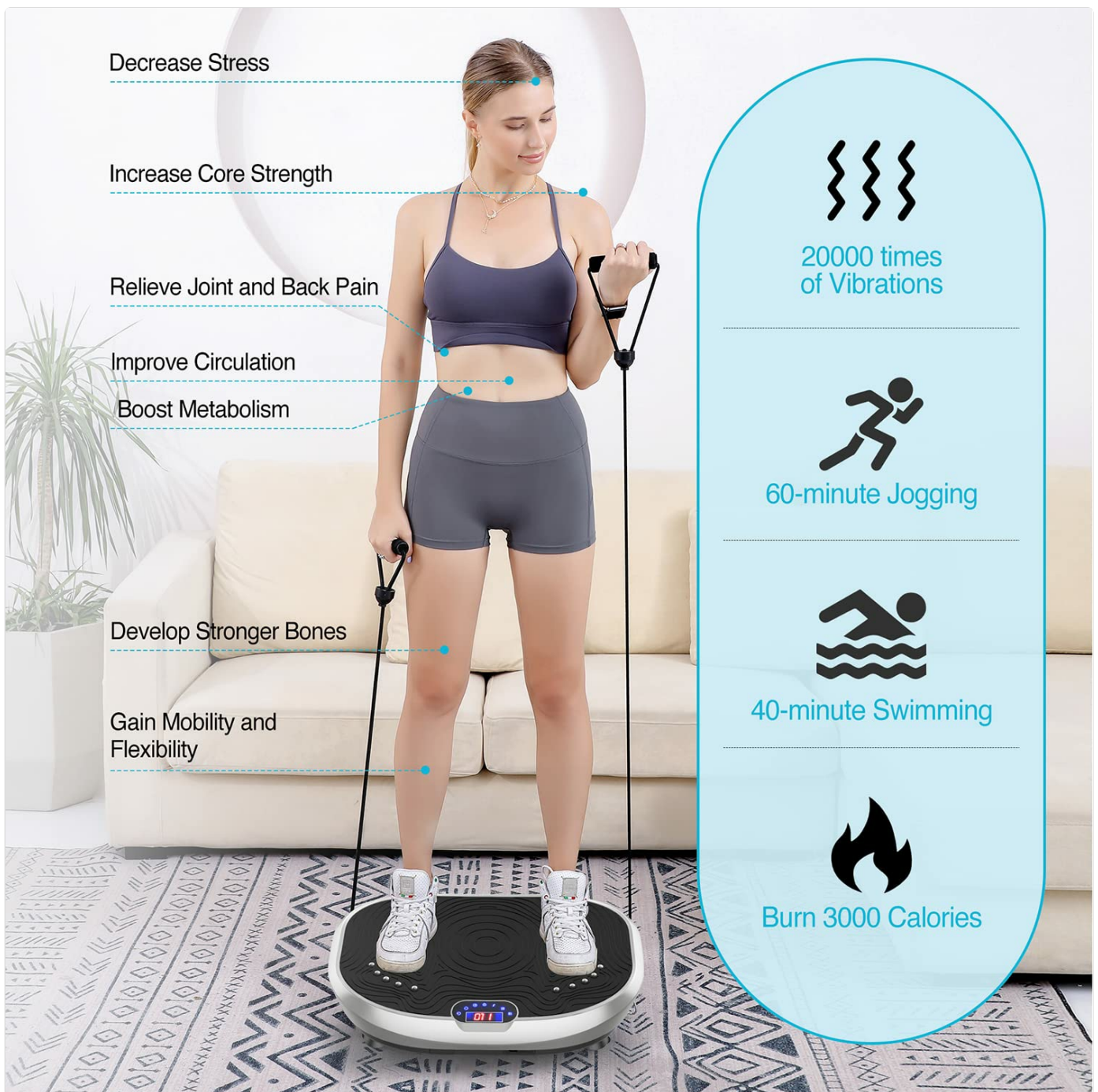
Image: User demonstrating the AXV Vibration Plate Pro with resistance bands, illustrating various health and fitness benefits.