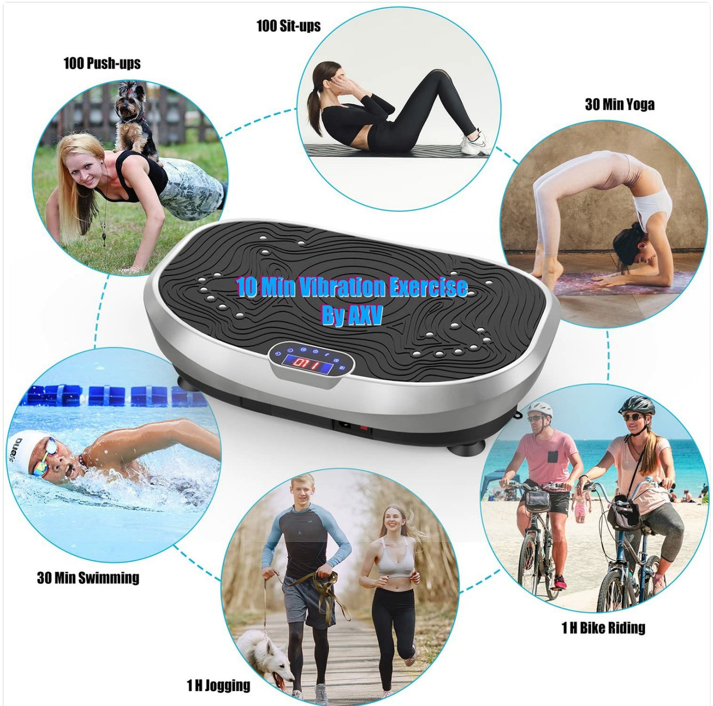
Image: Comparative benefits of 10 minutes of vibration exercise, showing equivalencies to other physical activities.

Regular use, such as 10 minutes daily, can contribute to various fitness benefits.