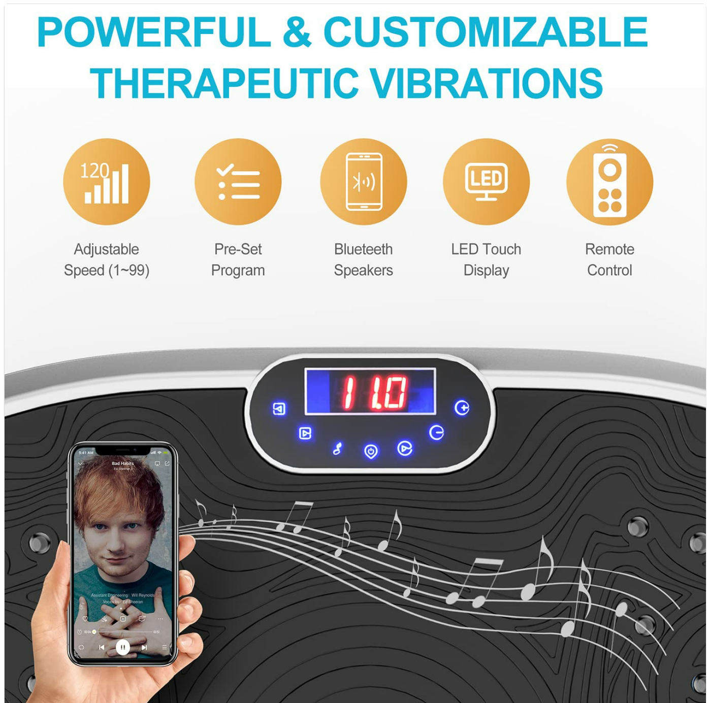
Image: The control panel and features of the AXV Vibration Plate Pro, including adjustable speed, pre-set programs, Bluetooth, LED display, and remote control.

The AXV Vibration Plate Pro features an LED display and touch controls on the unit, as well as a remote control for convenient operation.