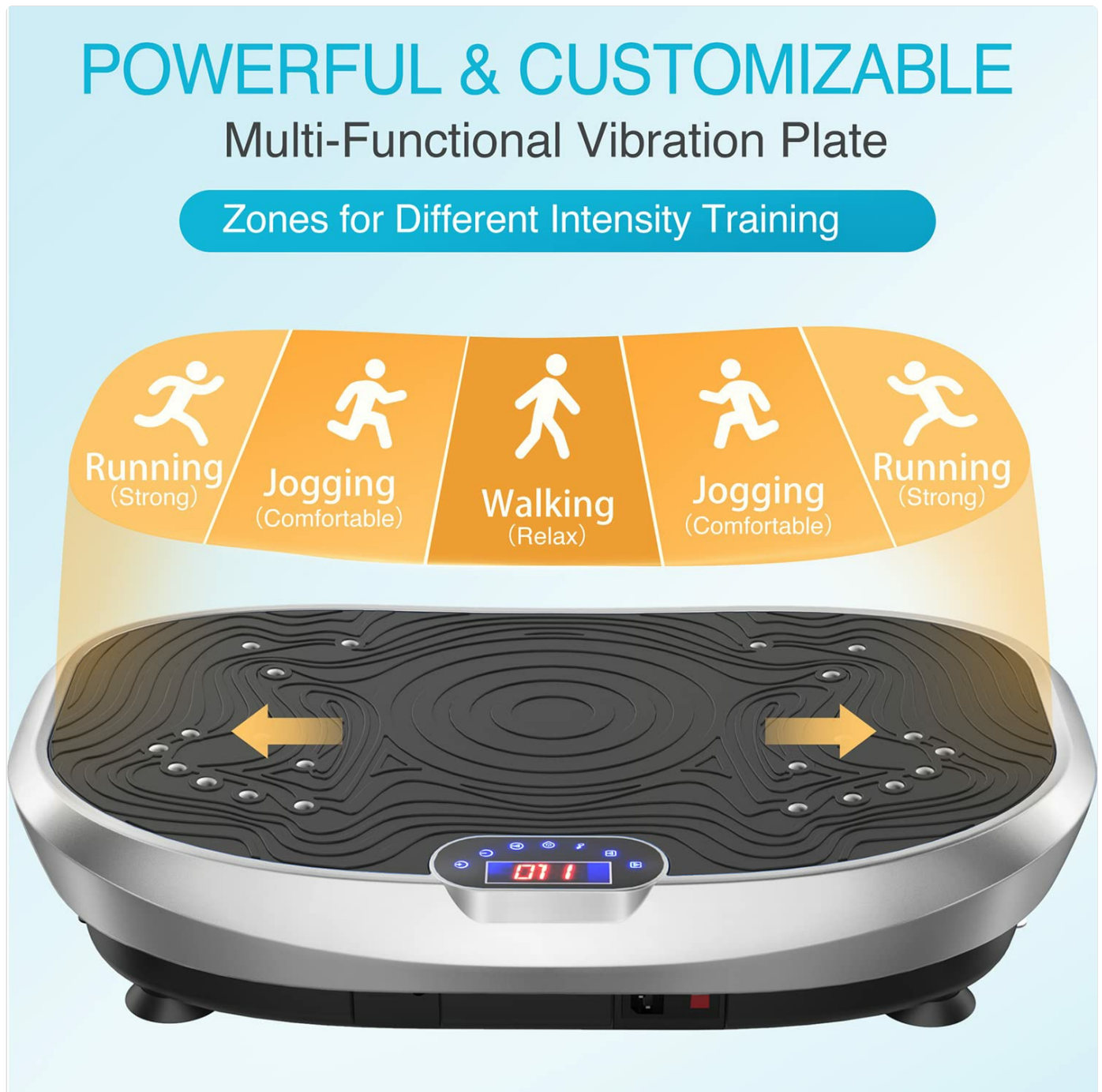
Image: Foot placement guide on the vibration plate, indicating zones for Walking (Relax), Jogging (Comfortable), and Running (Strong) intensities.

The vibration plate features different zones on its surface to simulate varying intensity levels based on foot placement.