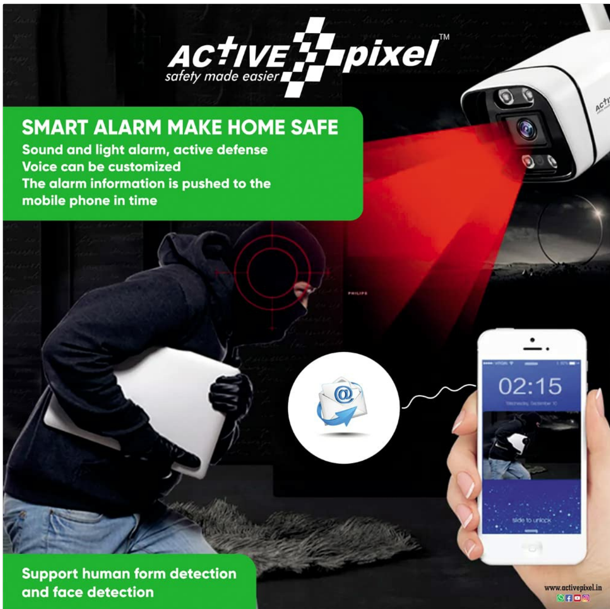
Figure 5.3: Smart Alarm System with Motion Detection and Mobile Notifications.