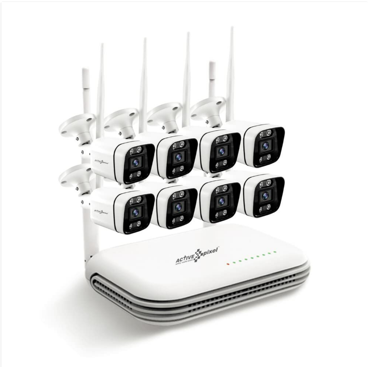
Figure 4.2: Active Pixel 8-Channel Wireless NVR Kit components.