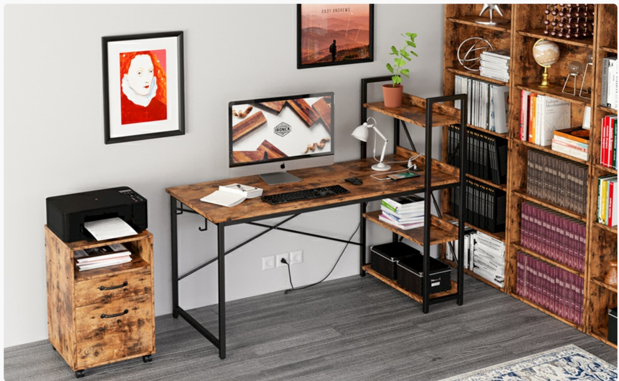
Image: Reversible storage shelves configuration options.