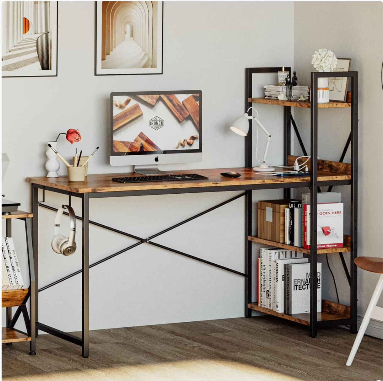
Image: Assembled IRONCK Computer Desk with shelving unit on the right.