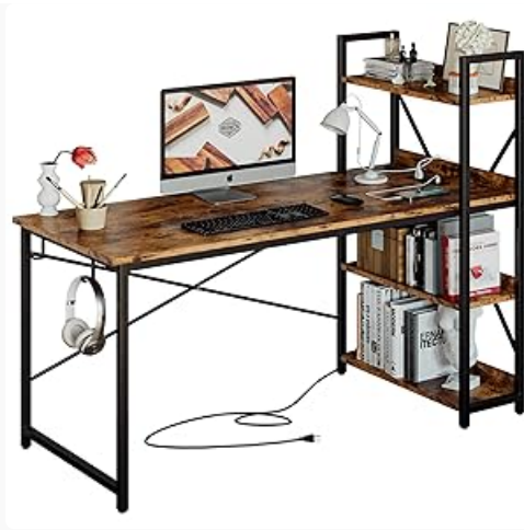
Image: Dedicated space for a CPU on the lower shelf.