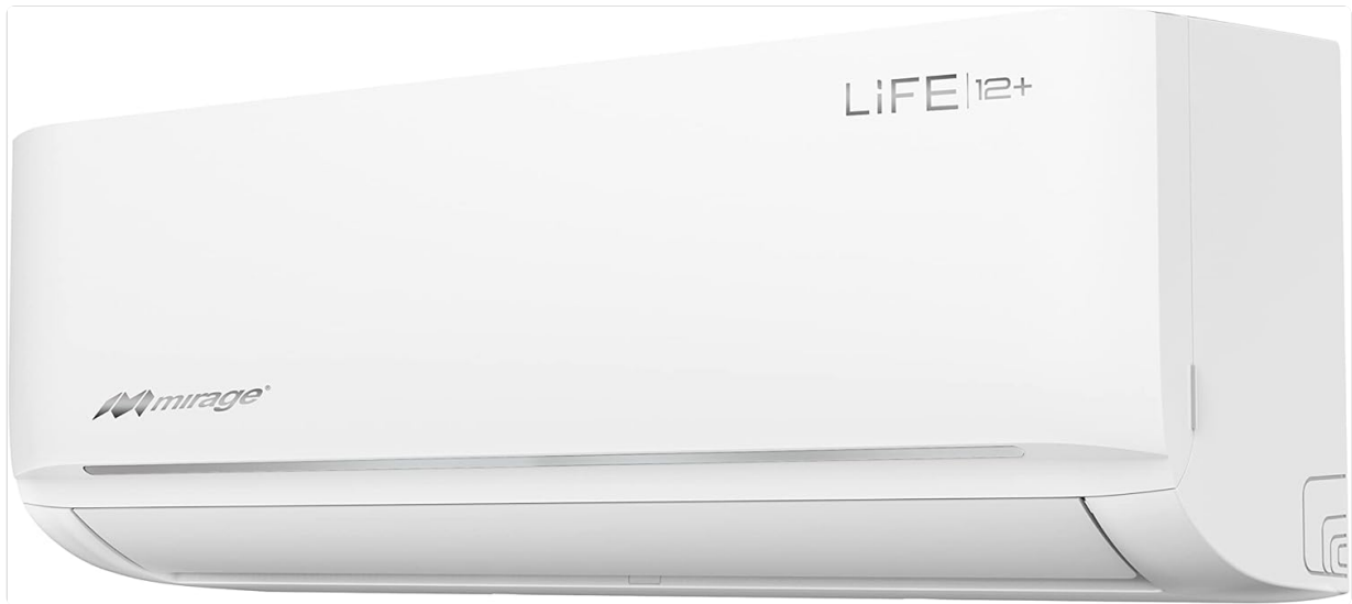
Figure 2: Angled view of the Mirage SETCLF120T indoor unit, highlighting its compact and modern profile.