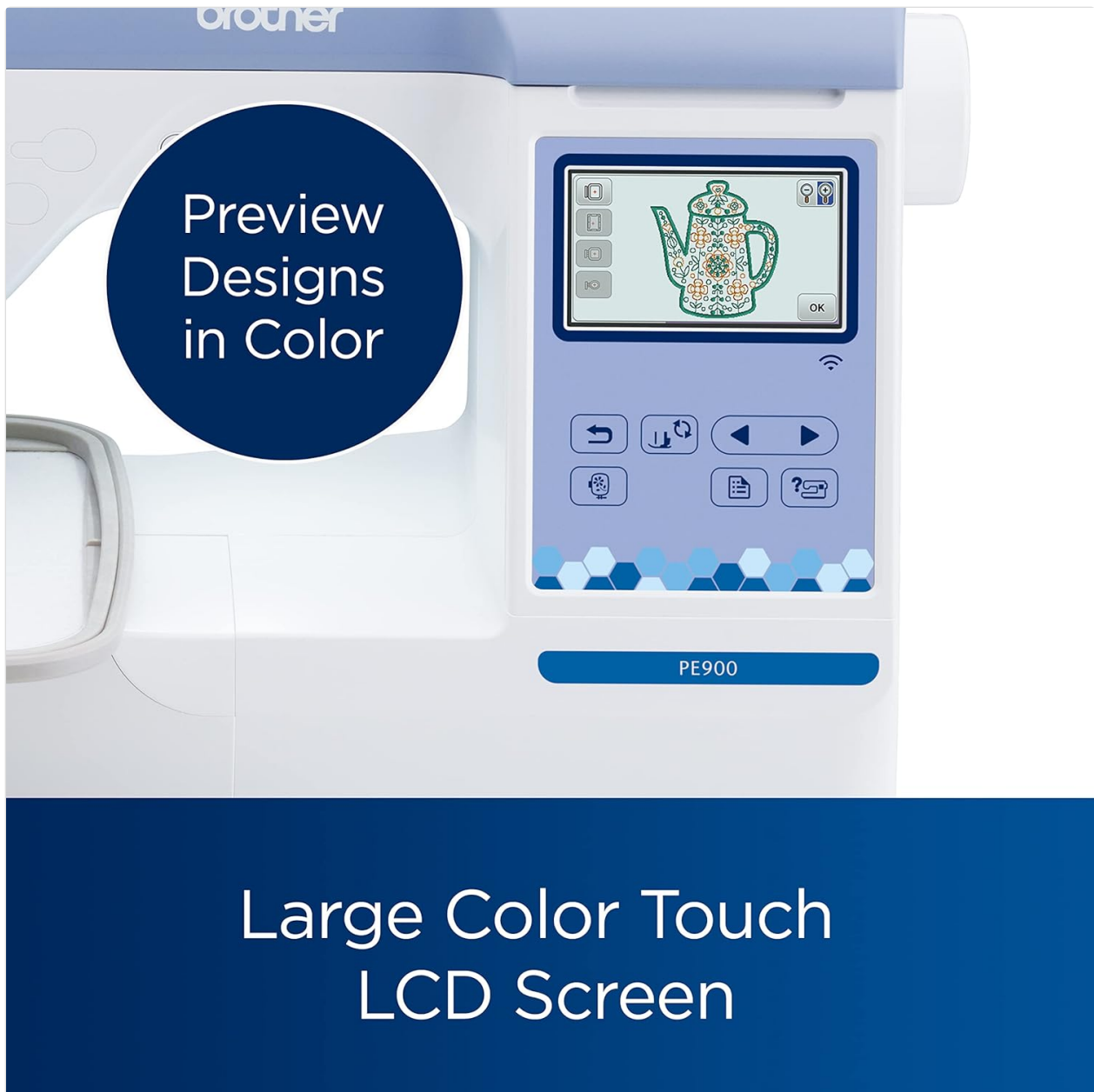
Image: Close-up of the Brother PE900's large color touch LCD screen, showing design preview and editing options.

Your browser does not support the video tag.