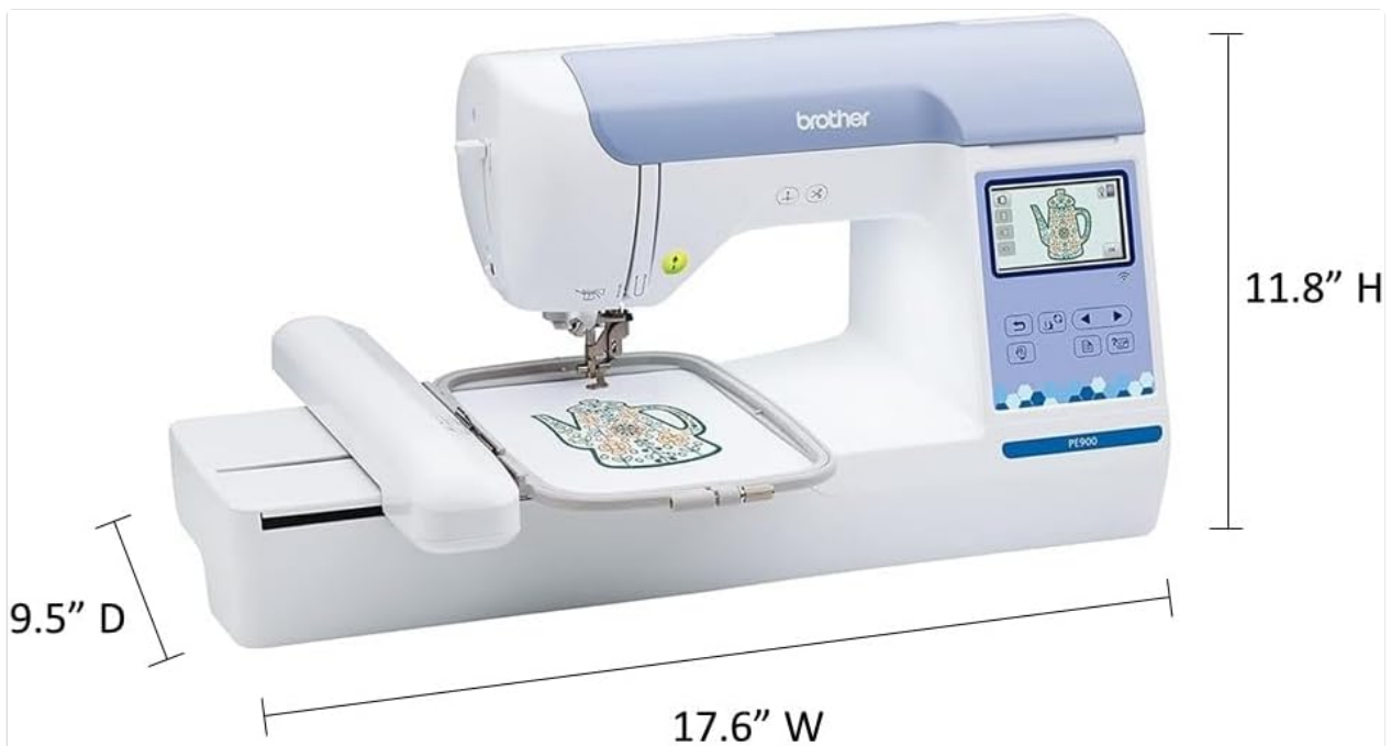
Image: Dimensions of the Brother PE900 Embroidery Machine, showing 17.6" W, 9.5" D, and 11.8" H.