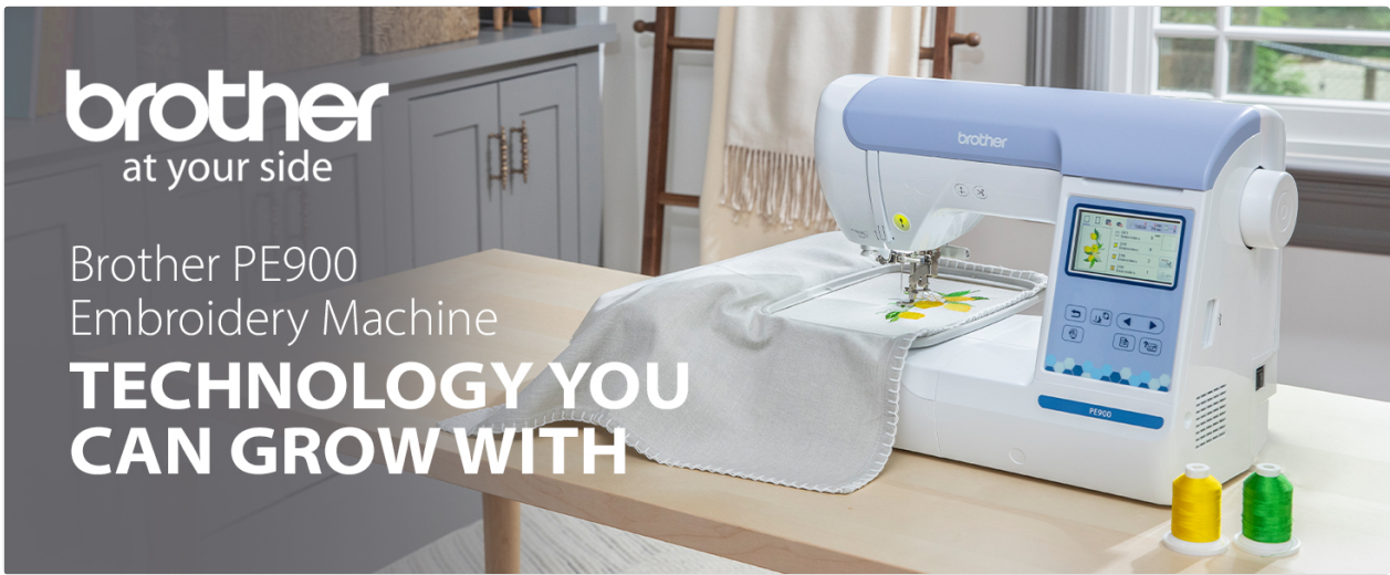
Image: Overview of the Brother PE900 Embroidery Machine highlighting its key features.