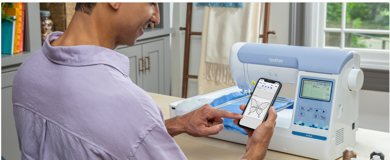
Image: Illustrates the process of design database transfer to the embroidery machine for easy data management.

Image: Close-up of the built-in USB port on the Brother PE900, used for importing embroidery designs.