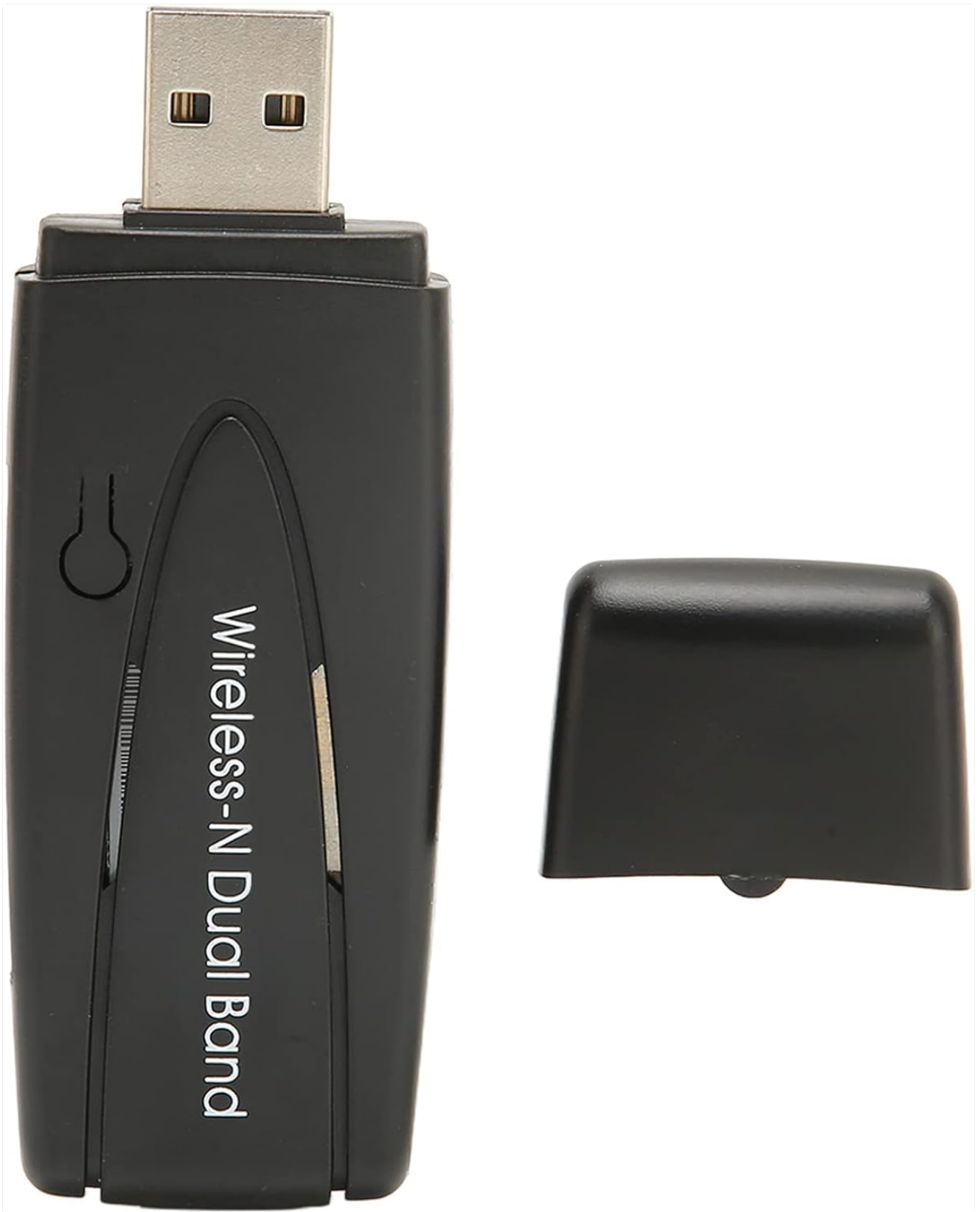
Image: The ASHATA USB Adapter, a black rectangular device with a USB connector, shown with its protective cap removed.