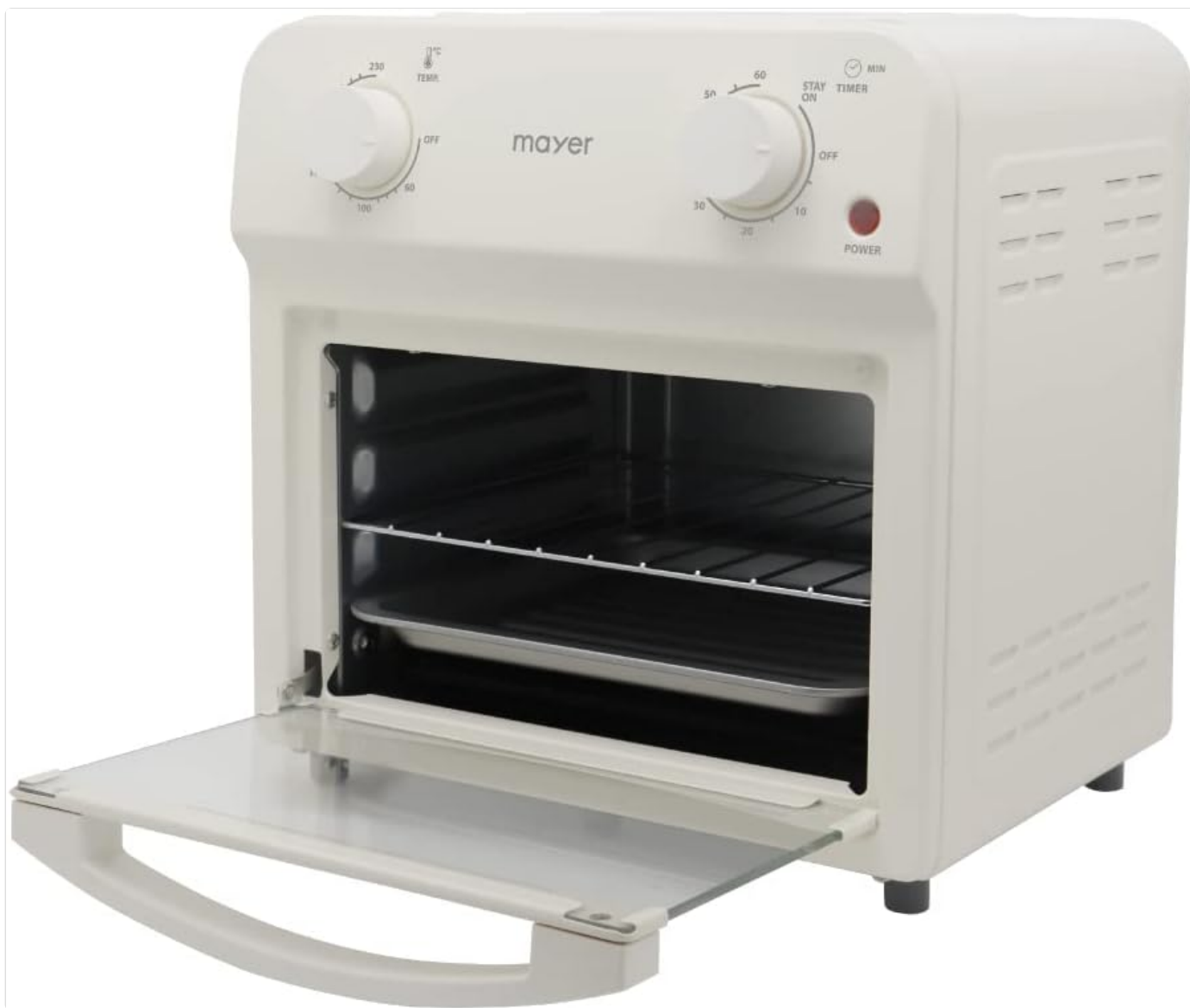
Image: Side view of the Mayer Air Toaster Oven with its glass door fully open, revealing the interior space and removable racks.