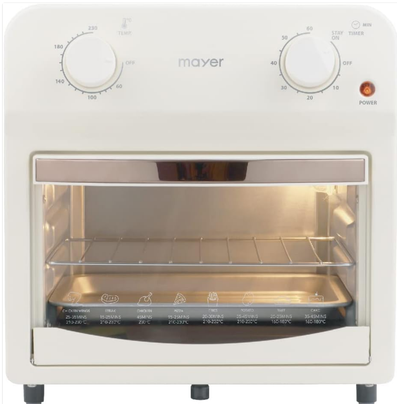
Image: Front view of the Mayer Air Toaster Oven, showcasing its internal components including the wire rack and baking tray. The control knobs for temperature and timer are visible on the top right.