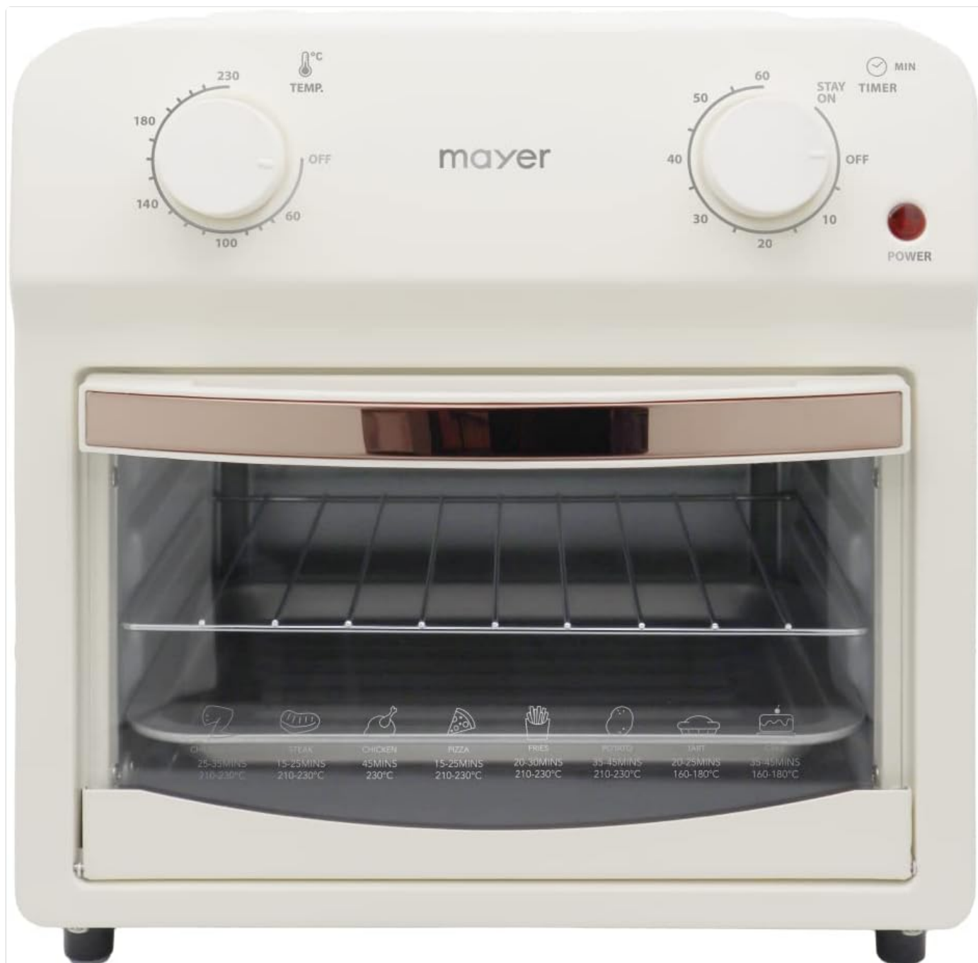
Image: Front view of the Mayer Air Toaster Oven with the door closed, showing the clean exterior and control knobs.