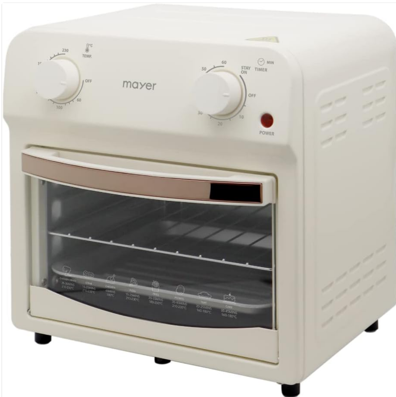
Image: Angled top view of the Mayer Air Toaster Oven, highlighting its compact design and control panel.