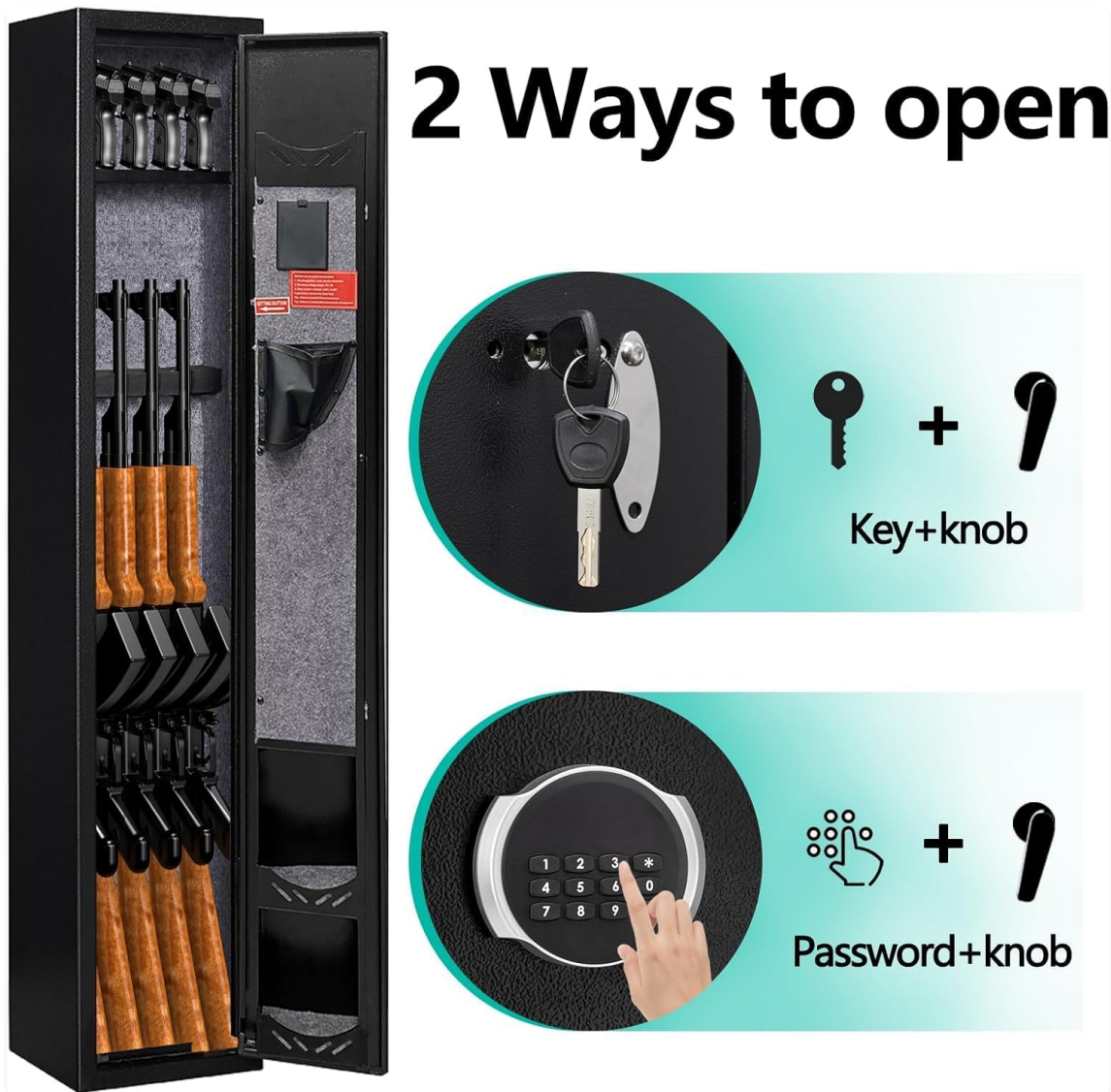
Image: Two primary methods for opening the safe: using a physical key or an electronic keypad with a code.