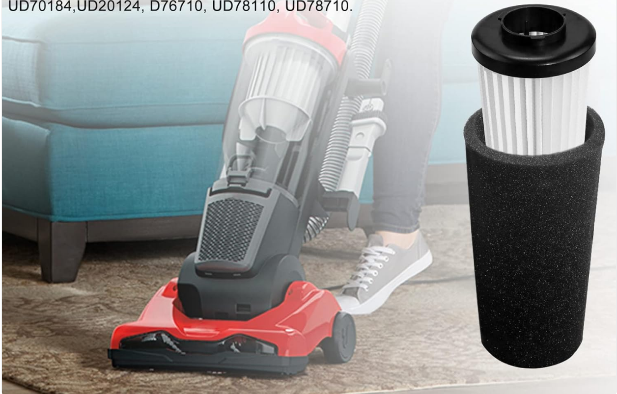
Figure 4: The F112 filter is compatible with a wide range of Dirt Devil Endura vacuum models.

UD20120NC, UD70161, UD70167, UD70181, UD70187, UD70171, UD70174, UD70174B, UD70164, UD70185, UD70182, UD70186, UD70355B, UD70350B, UD20117, UD20127, UD70162, UD70184, UD20124, D76710, UD78110, UD78710.