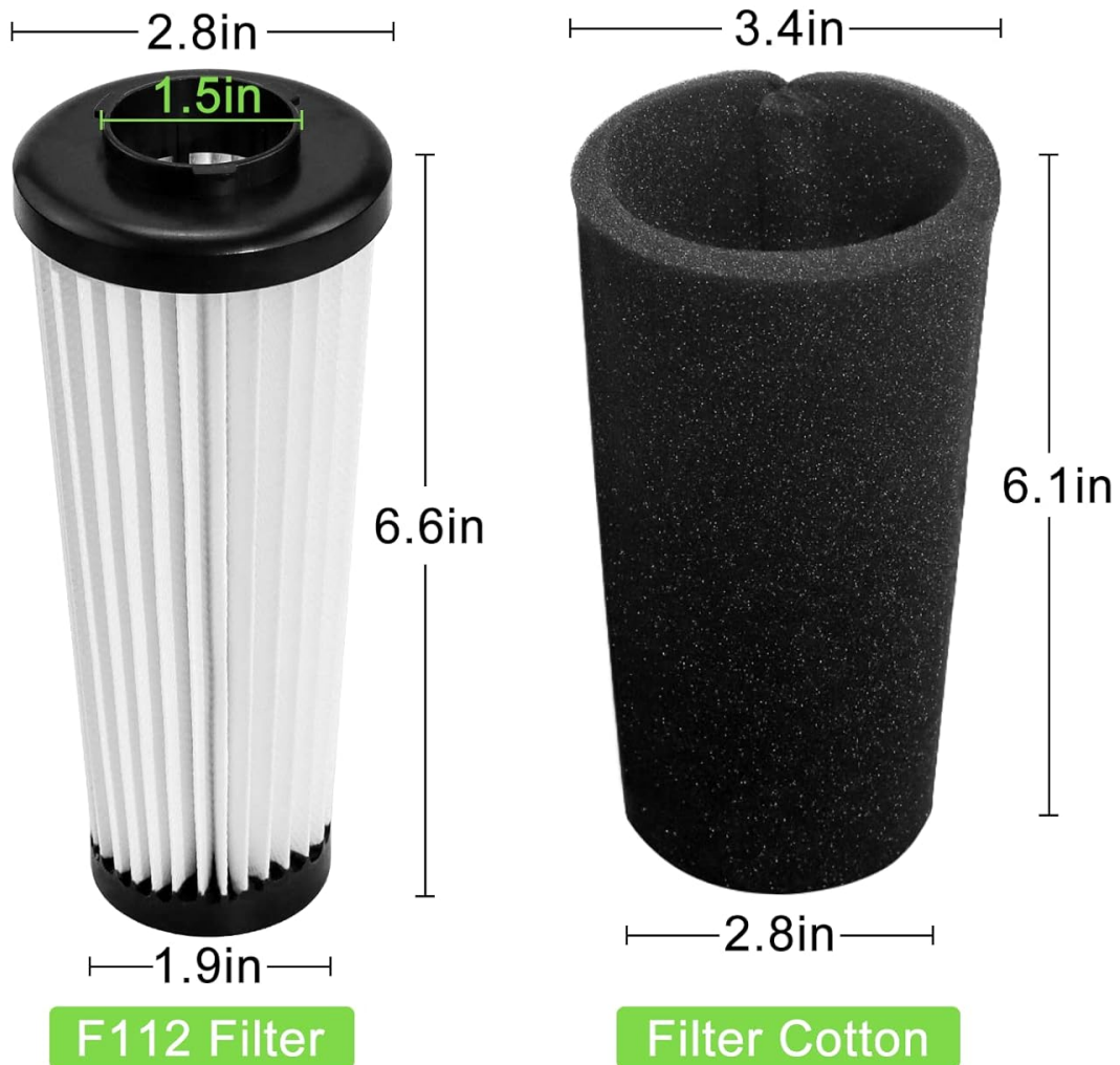
Figure 6: Detailed dimensions of the F112 filter and its foam cotton.