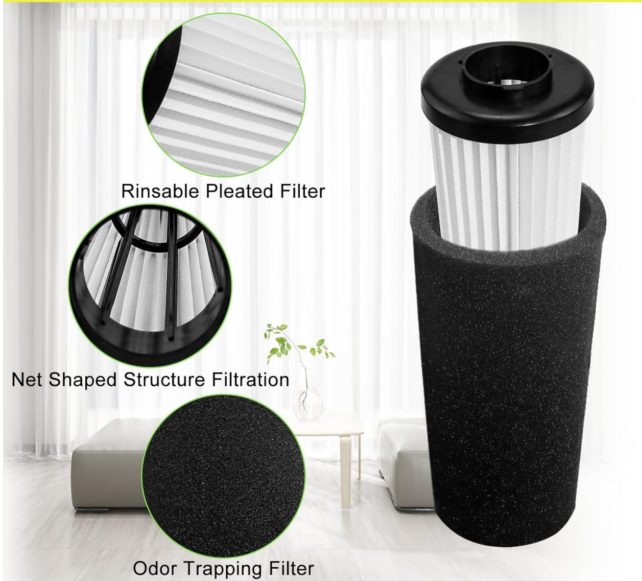
Figure 2: The F112 filter features a three-stage filtration system, including a pleated filter and an odor-trapping foam layer.