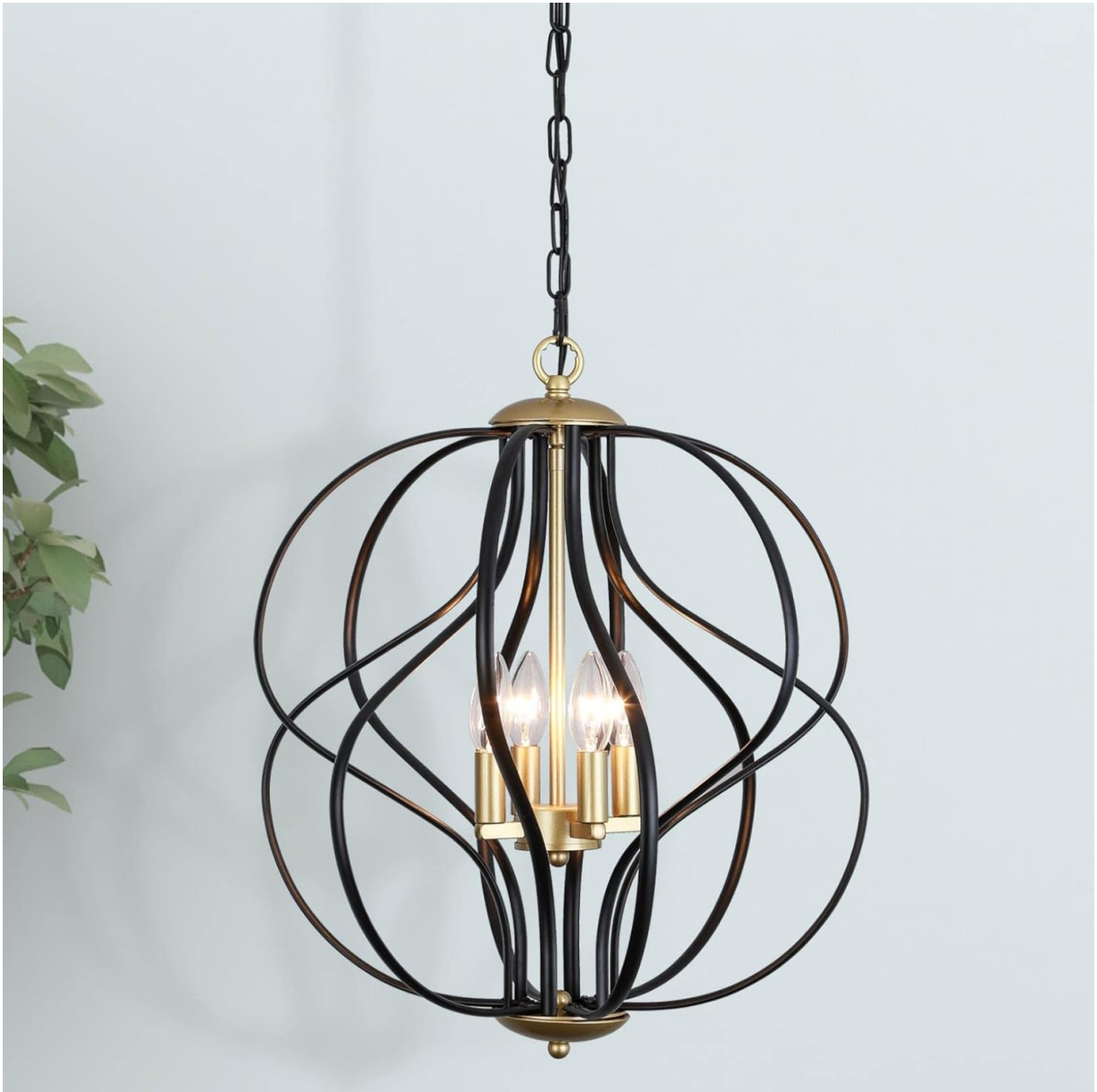
Figure 4: Chandelier in a Dining Room. The chandelier provides ambient lighting over a dining table.