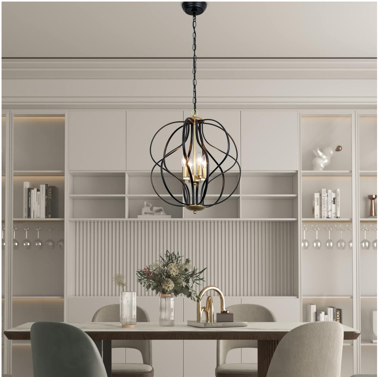
Figure 5: Chandelier in a Kitchen. The fixture complements a modern kitchen island or dining area.