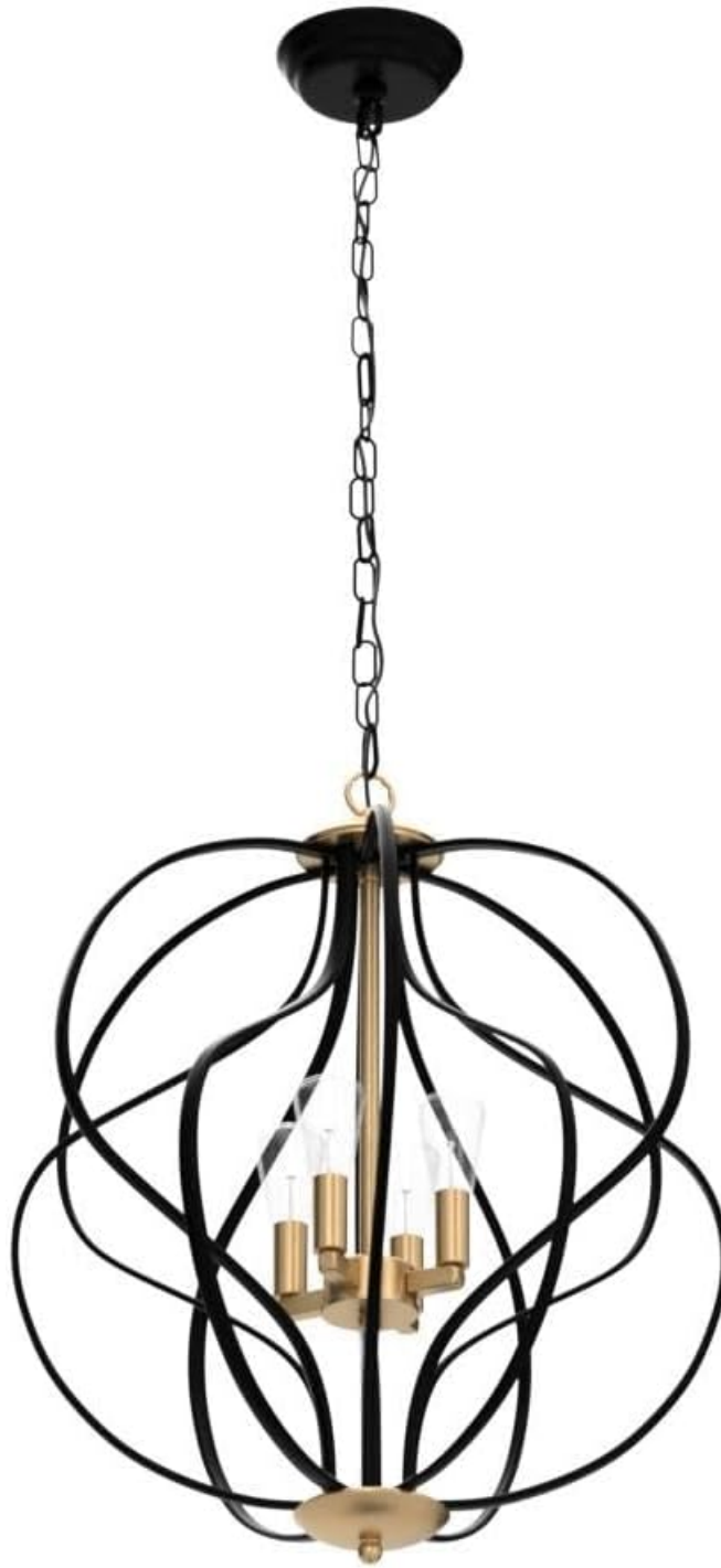
Figure 1: Chandelier Dimensions and Features. The diagram illustrates the 17.3" diameter, 17.7" fixture height, and 36.6" chain length, highlighting adjustable height and sloped ceiling compatibility.