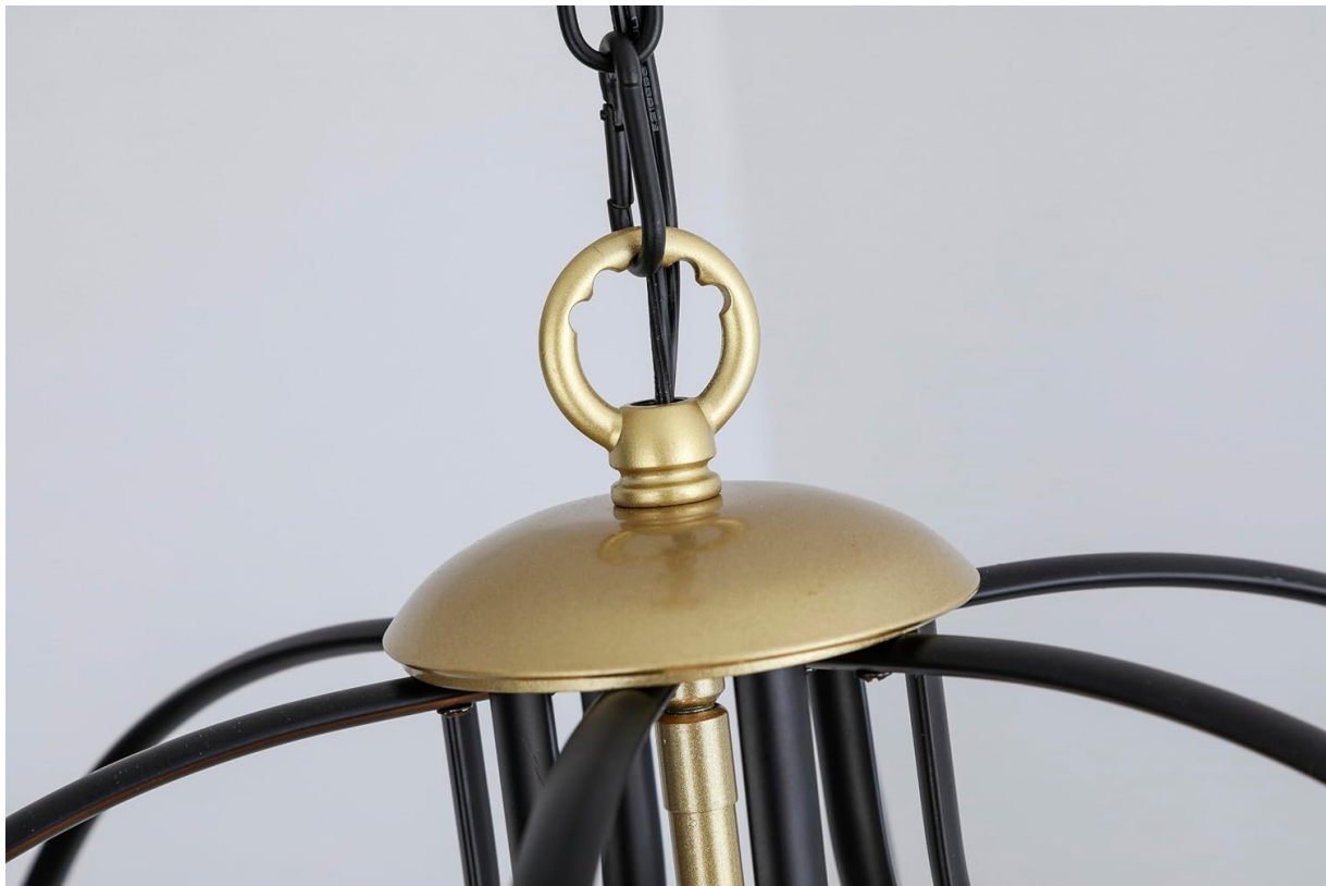
Figure 3: Top Connection Detail. A close-up view of the chandelier's upper section, illustrating the connection point for the adjustable chain.