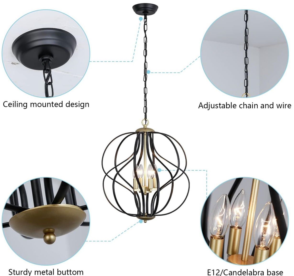
Figure 2: Key Components for Installation. This image highlights the ceiling-mounted design, adjustable chain and wire, sturdy metal bottom, and the E12/Candelabra bulb base.