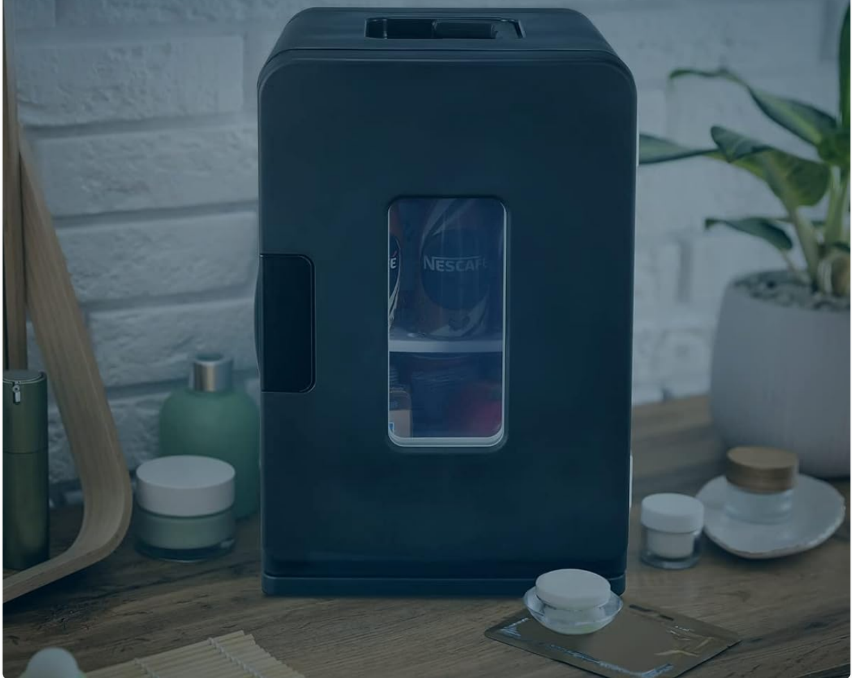
Image: The mini fridge operating in silent mode, highlighting its quiet, environmentally friendly, and energy-saving features.