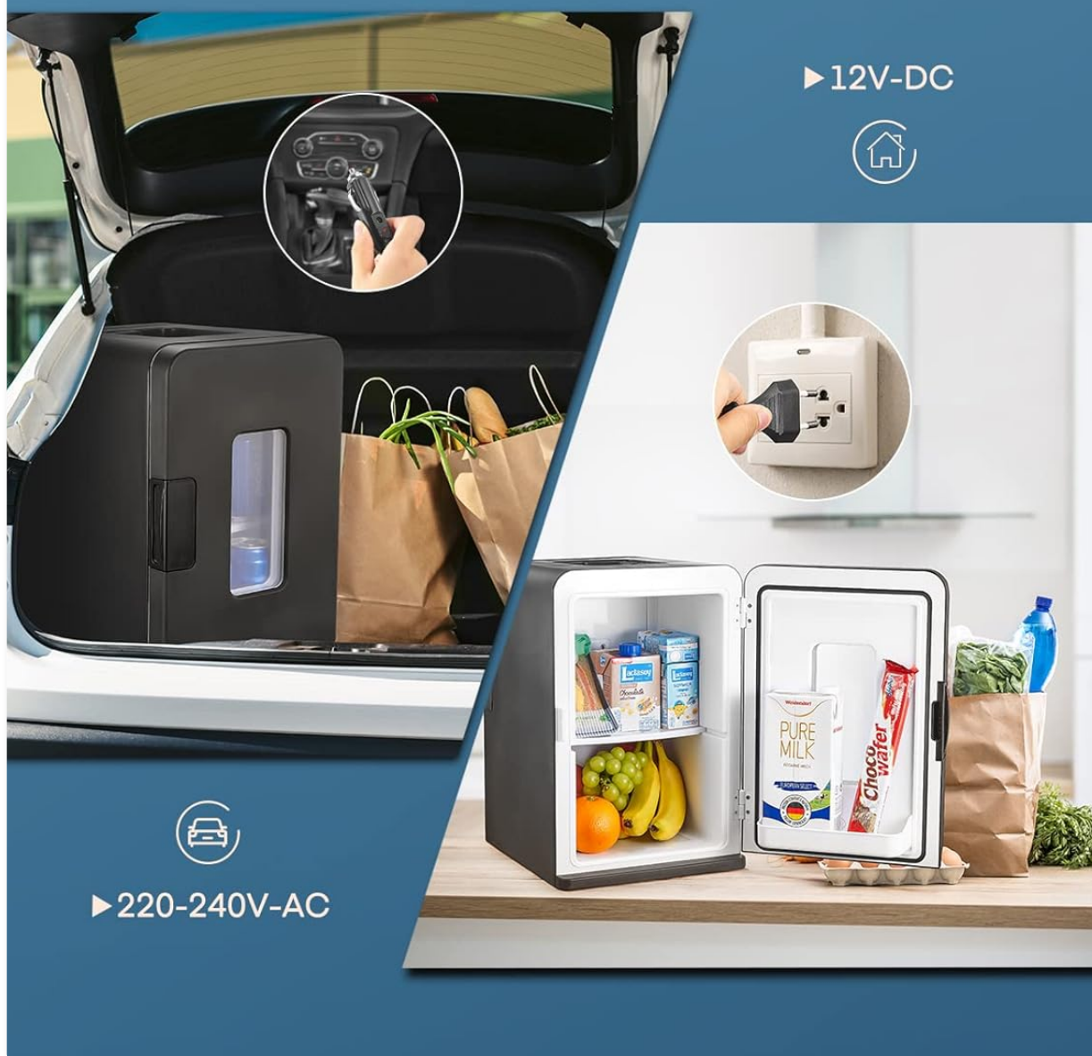
Image: Demonstrating the dual power capability for both home (AC) and car (DC) use.