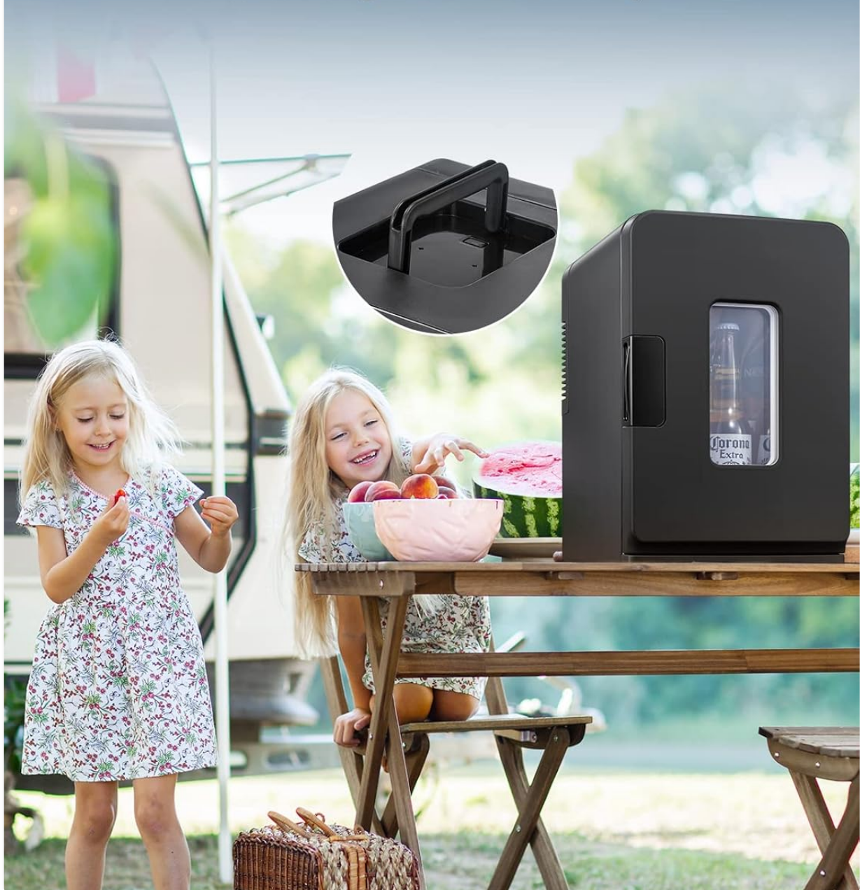
Image: The mini fridge demonstrating its portability with the ergonomic handle, suitable for outdoor use.