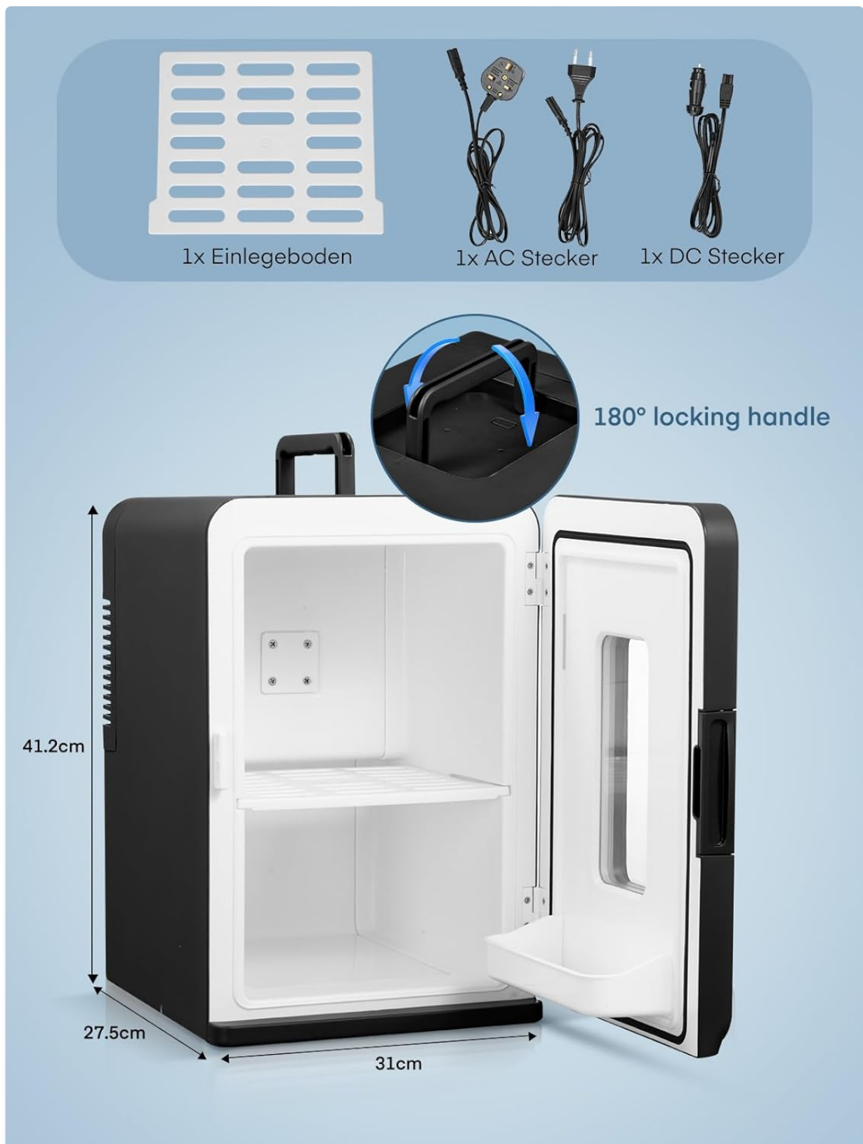
Image: Illustration of the mini fridge and its included accessories: AC power cable, DC power cable, and a removable internal shelf.