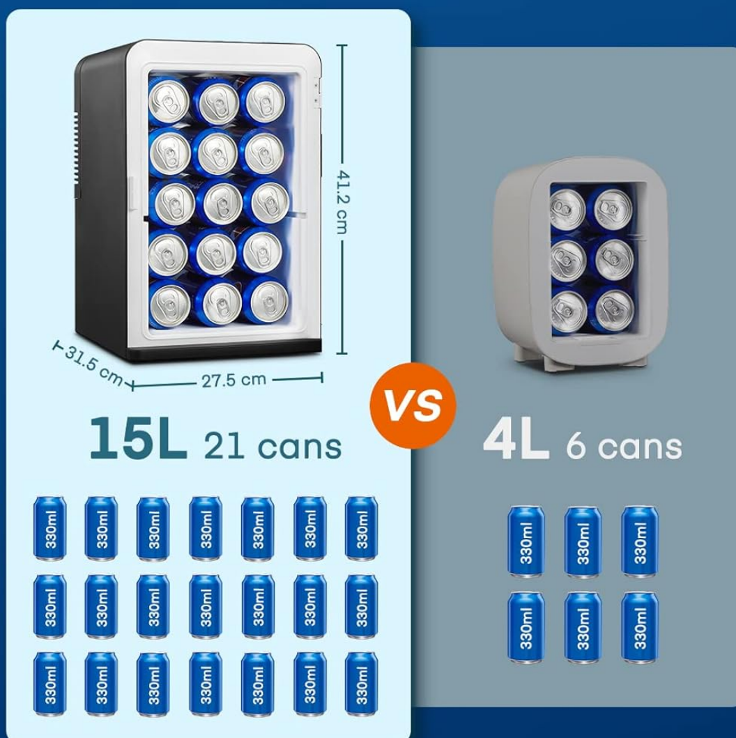
Image: Size comparison illustrating the 15L capacity, capable of holding up to 21 cans.