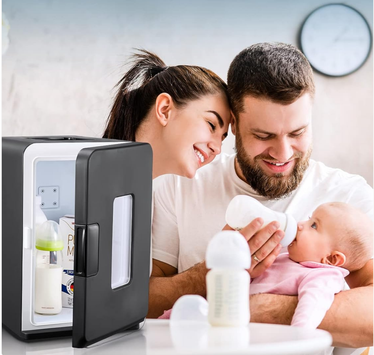
Image: The mini fridge in use for its warming function, suitable for keeping items like baby milk warm.