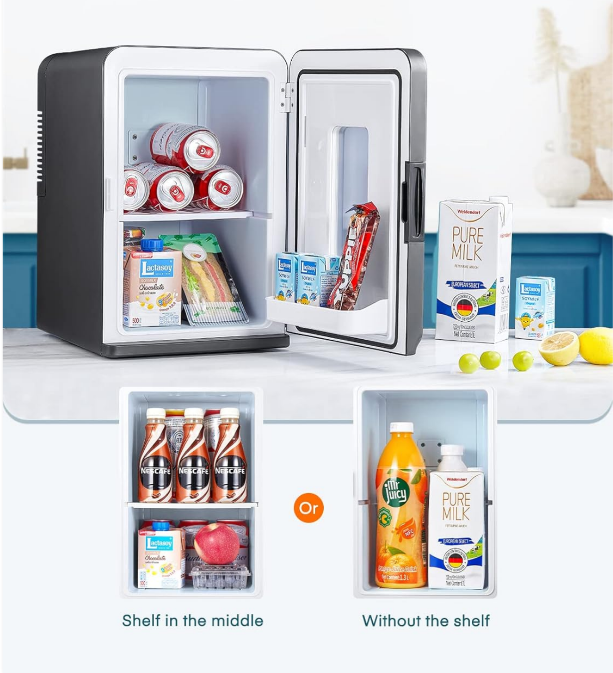
Image: Display of the mini fridge's versatile interior, showing how the removable shelf can be used or removed to fit various item sizes.