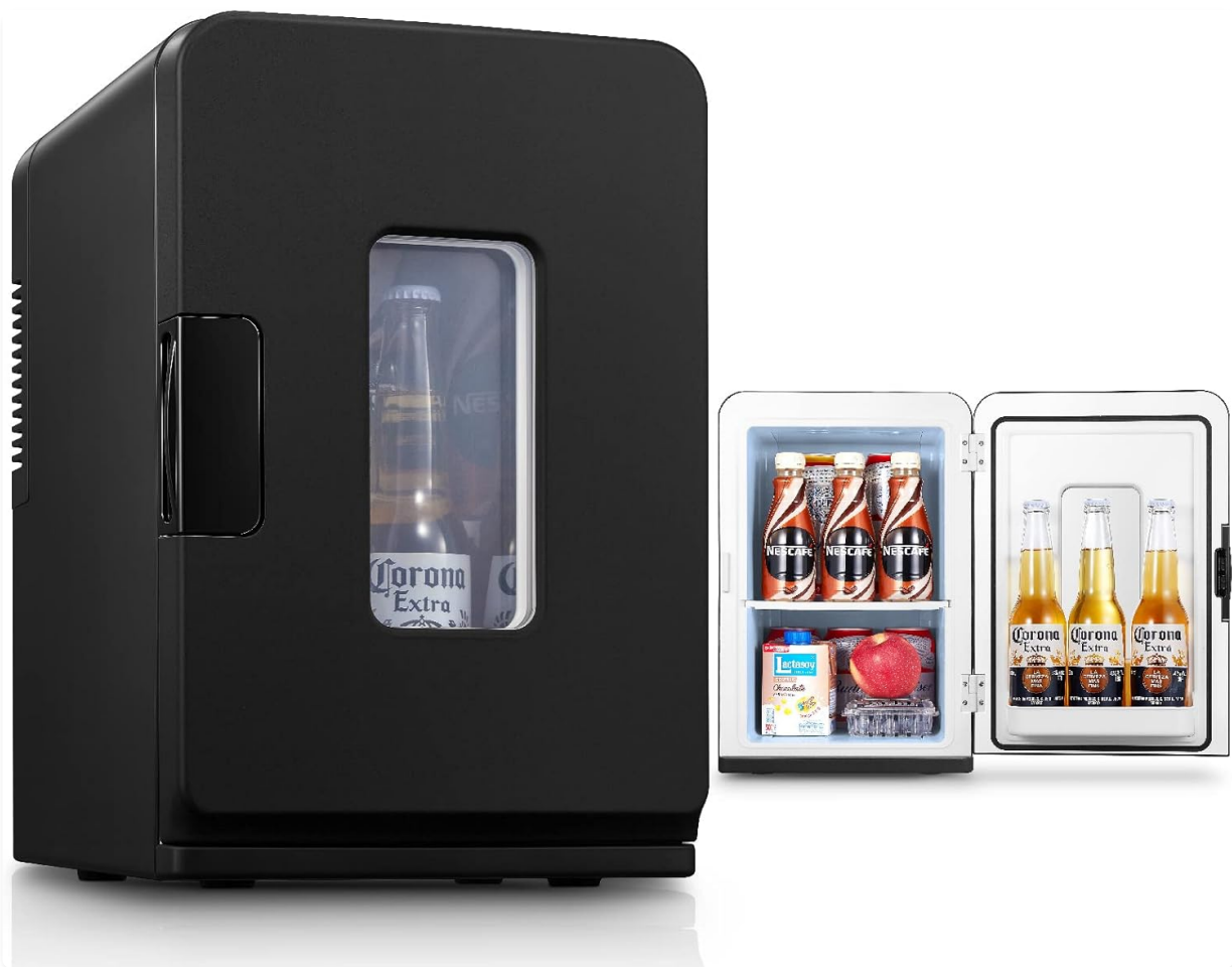
Image: The FOHERE 15L Portable Mini Fridge, showcasing its compact design and internal capacity for various items.