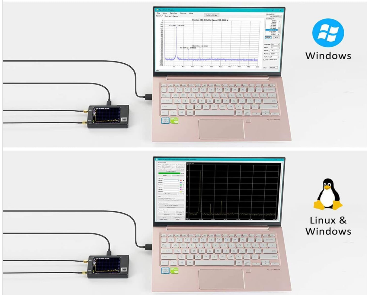
Figure 5: PC control setup with Windows and Linux.