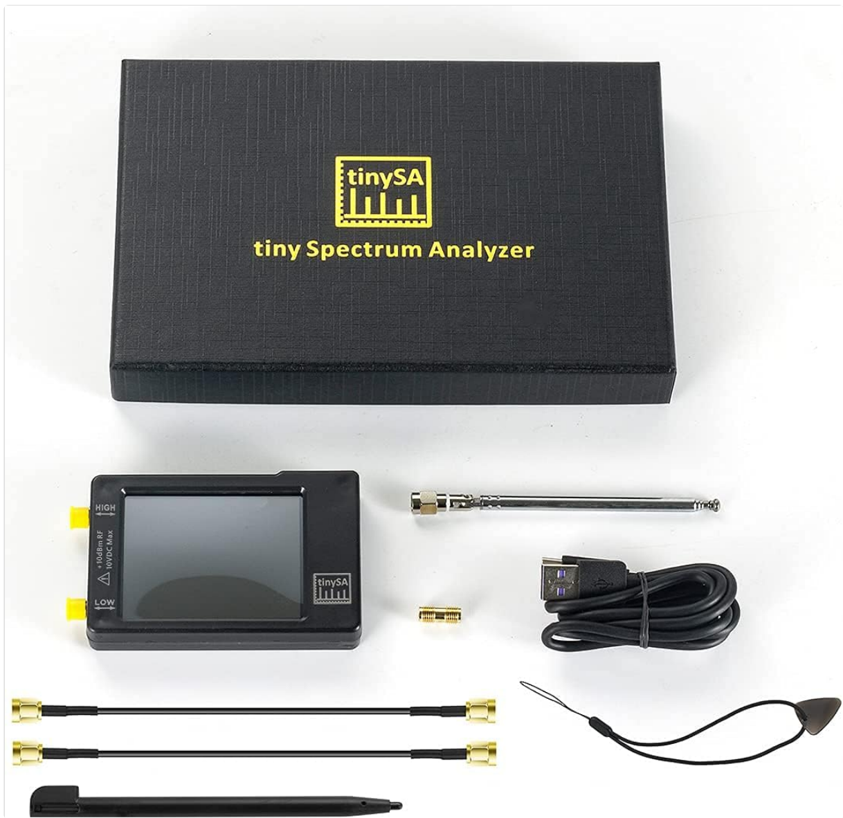
Figure 1: Included components of the Tiny SA Spectrum Analyzer.