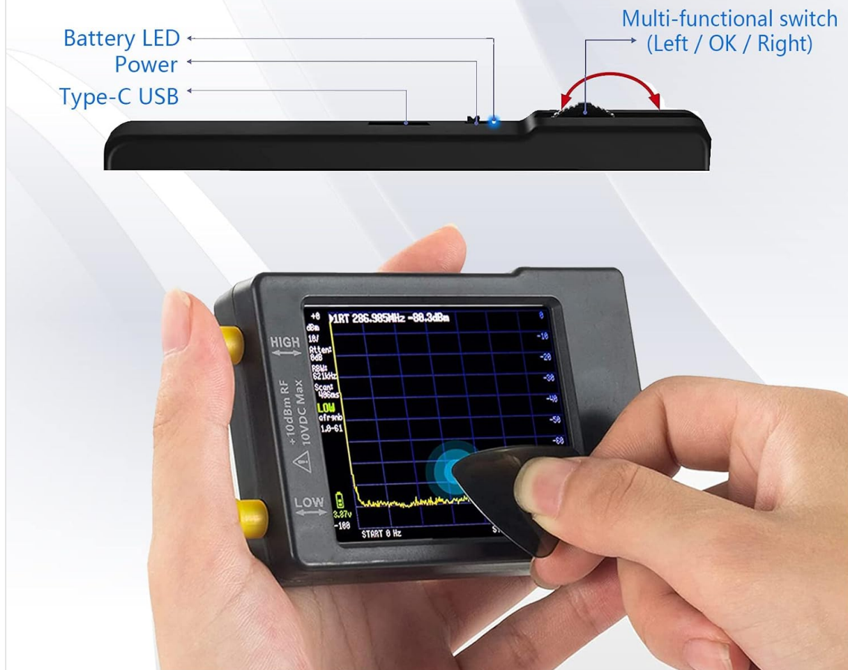
Figure 2: Front view of the Tiny SA Spectrum Analyzer highlighting the touch screen and controls.