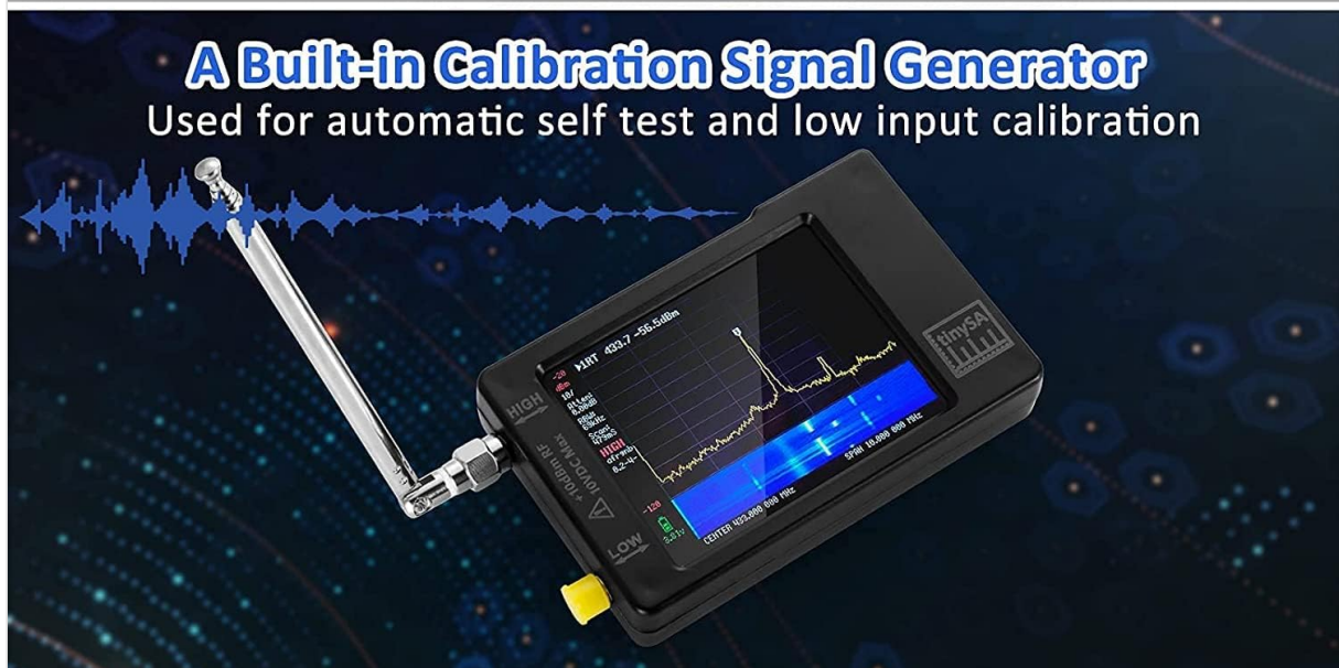
Figure 4: Device operating as a signal generator.