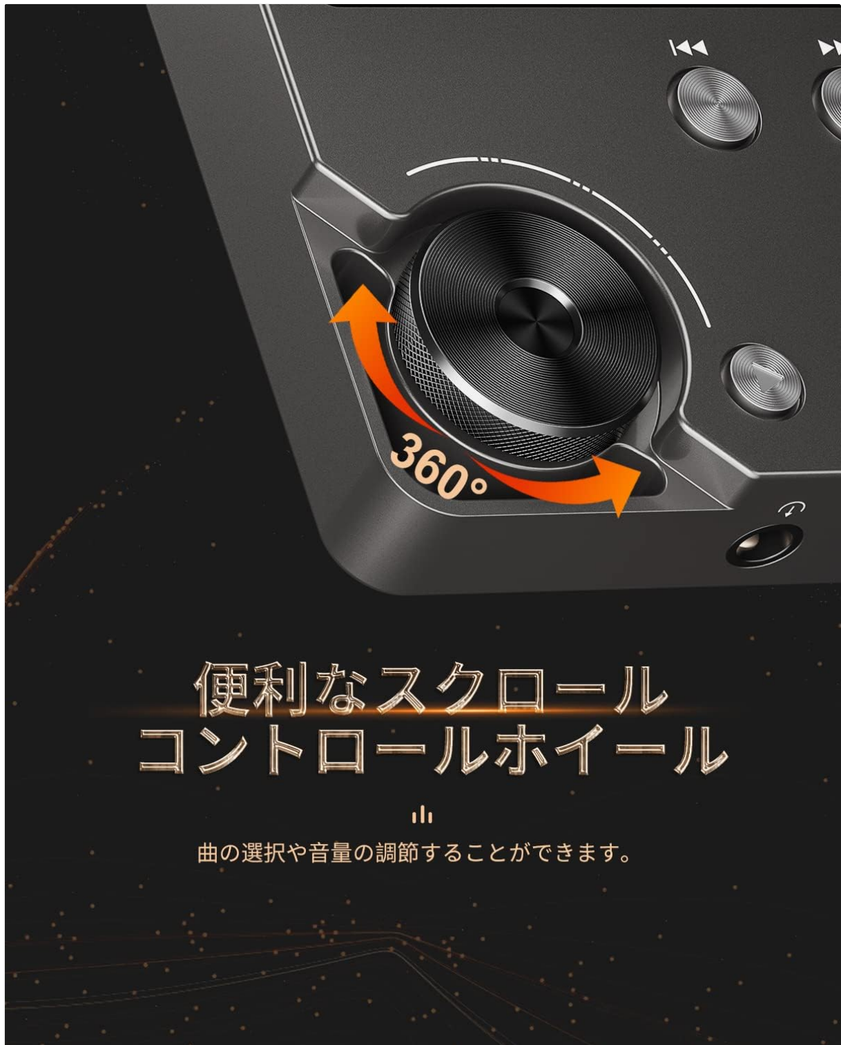
Figure 4: Scroll Control Wheel