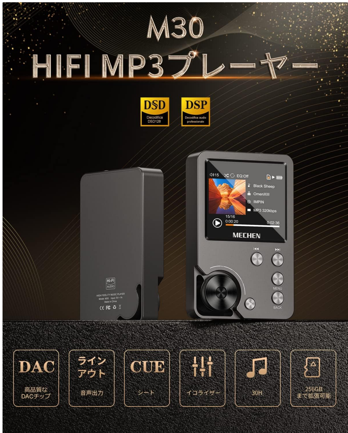
Figure 1: MECHEN M30 HIFI MP3 Player Overview