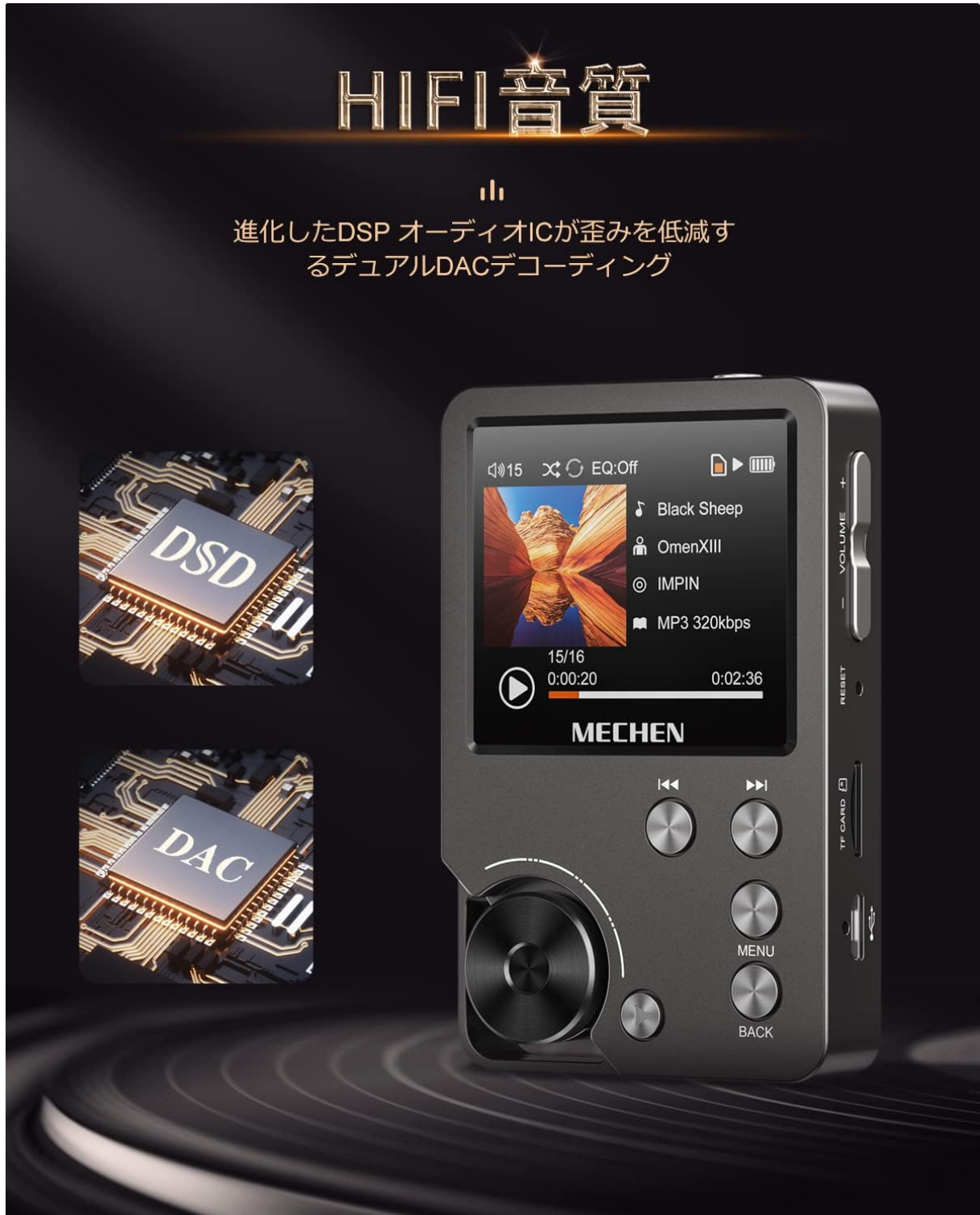
Figure 2: High-Quality DSD and DAC Chips