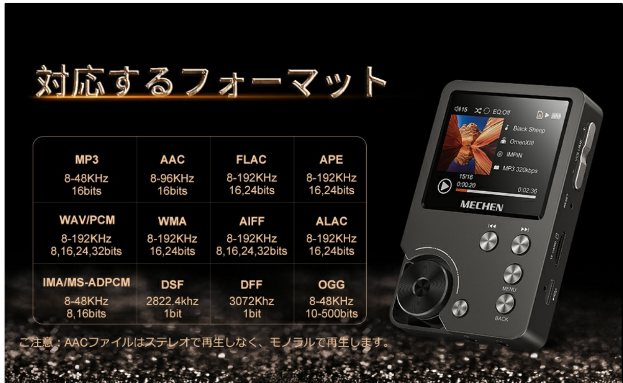
Figure 8: Supported Audio Formats