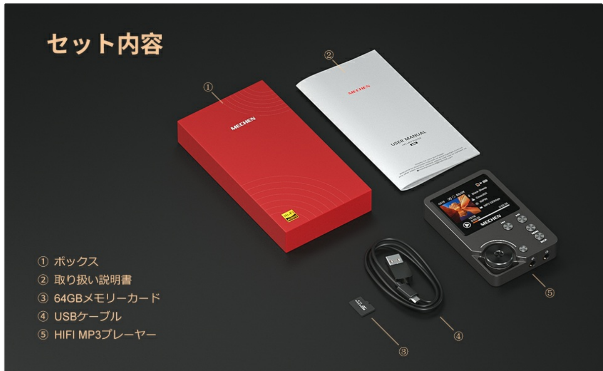
Figure 3: Included Components