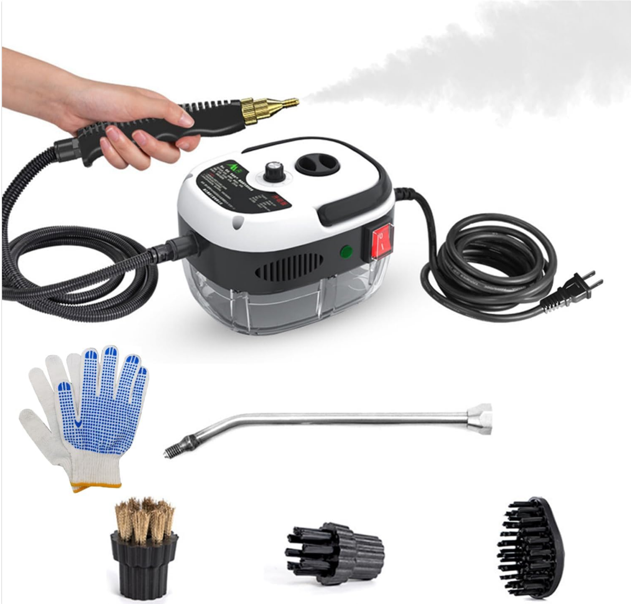
Figure 3.1: Ailgely Steam Cleaner with included accessories.

Familiarize yourself with the parts of your Ailgely Steam Cleaner and its accessories.