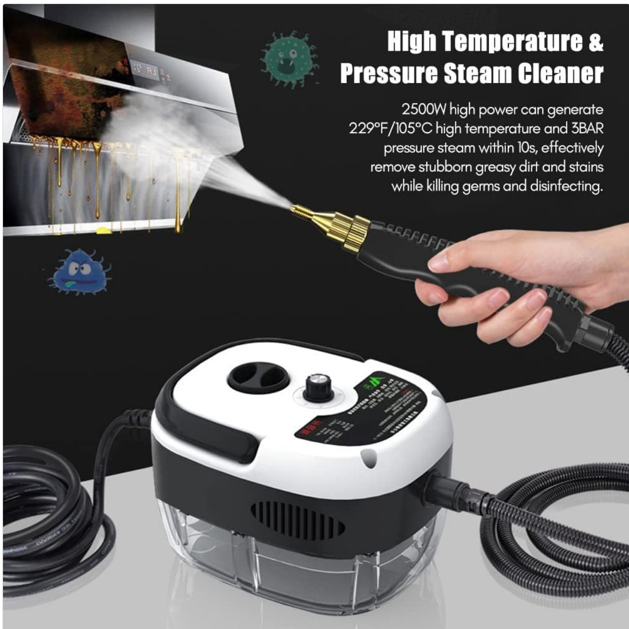
Figure 1.1: Aigely Steam Cleaner generating high-temperature steam.