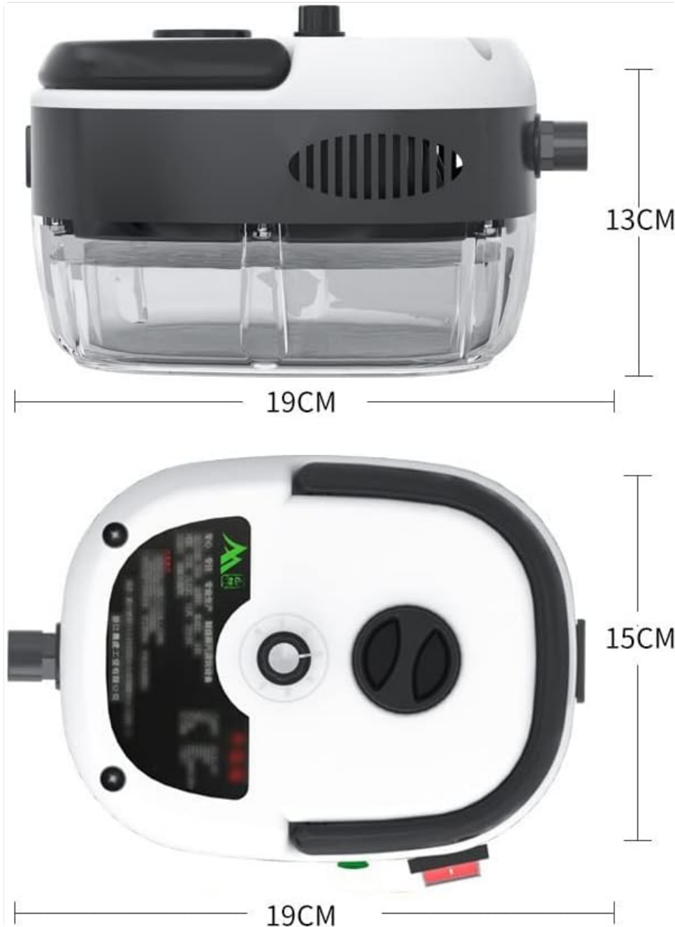
Figure 8.1: Product dimensions.