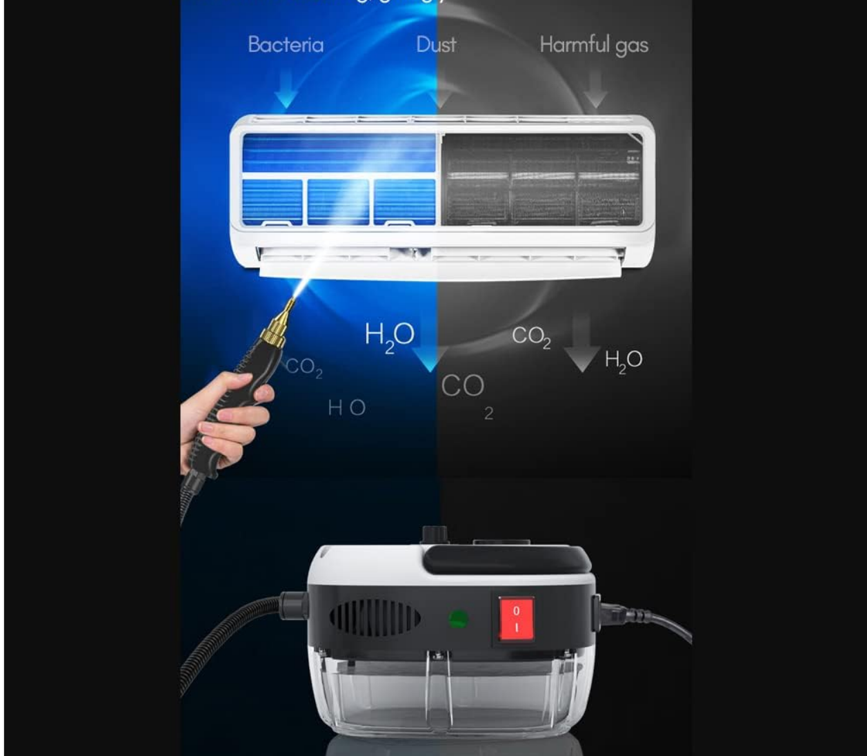
Figure 3.3: Extended reach with steam tube and power cable.

Convenient for cleaning, giving you more movement freedom.