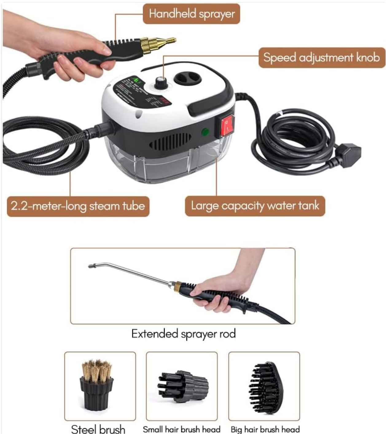
Figure 3.2: Diagram of main components.