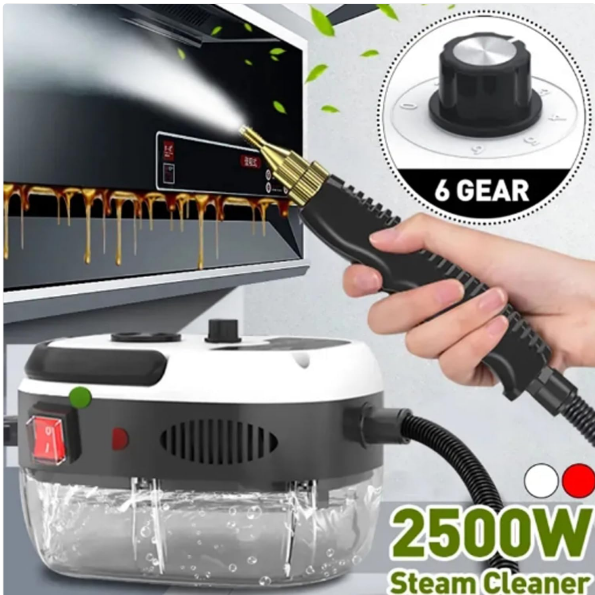
Figure 5.1: Adjusting steam output with the 6-gear dial.