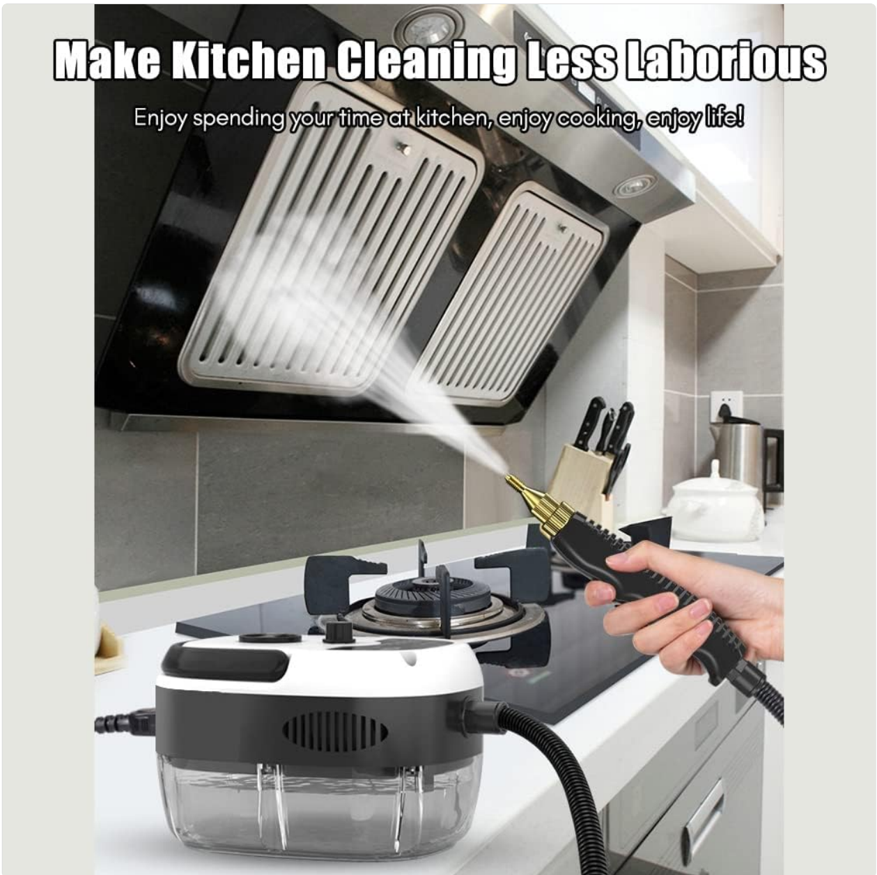
Figure 5.2: Cleaning a kitchen range hood.

Enjoy spending your time at kitchen, enjoy cooking, enjoy life!