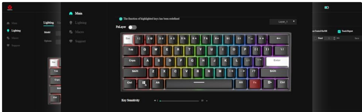
Image: A screenshot of the FANTECH MAXFIT61 software, demonstrating the interface for adjusting RGB lighting modes and creating custom key assignments.

The keyboard features 15 built-in brilliant backlight effects. You can cycle through these effects using specific Fn key combinations. For advanced customization, including per-key RGB lighting, macros, and function key remapping, download and install the FANTECH MAXFIT61 software from the official FANTECH website.