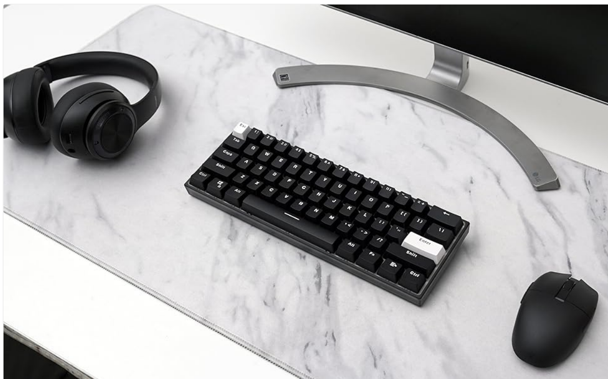
Image: The FANTECH MAXFIT61 Frost Wireless Mechanical Keyboard, showcasing its 5-pin hot-swappable design, 3 connection modes (Bluetooth, 2.4GHz, USB-C), RGB lighting, and switch options (Red and Blue).

Thank you for choosing the FANTECH MAXFIT61 Frost Wireless Mechanical Keyboard. This compact 61-key keyboard offers versatile connectivity options, customizable RGB lighting, and hot-swappable switches for a personalized typing and gaming experience. This manual provides detailed instructions for setup, operation, maintenance, and troubleshooting to ensure optimal performance.