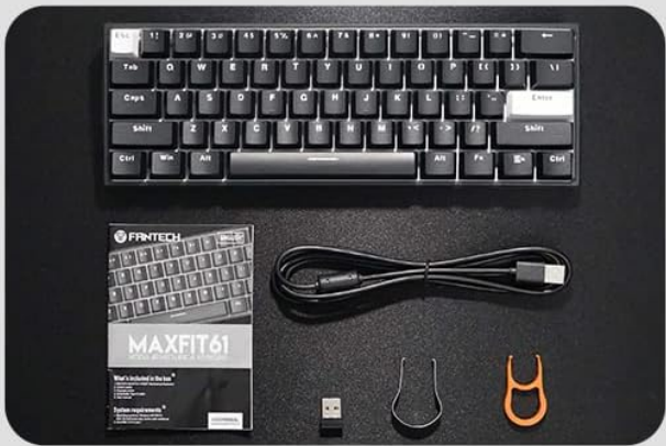
Image: A visual representation of the items included in the product packaging, such as the keyboard, cables, and tools.

The MAXFIT61 Frost Wireless keyboard supports three connection modes: