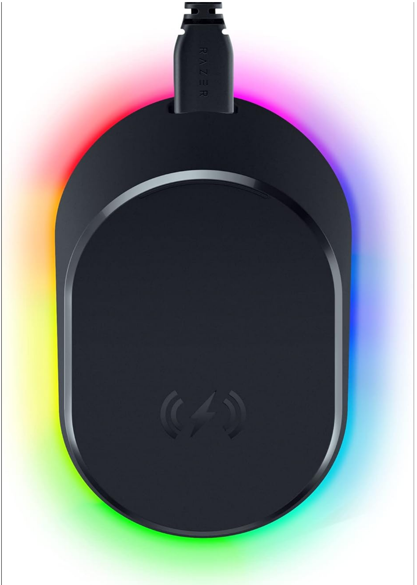
The Razer Wireless Charging Puck, ready for installation on a compatible mouse.