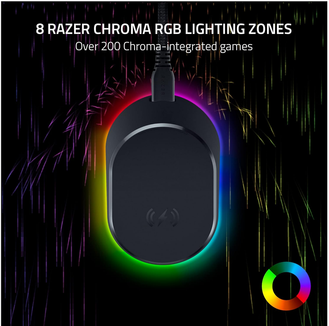
The Razer Mouse Dock Pro showcasing its vibrant 8 Chroma RGB Lighting Zones, customizable via Razer Synapse.