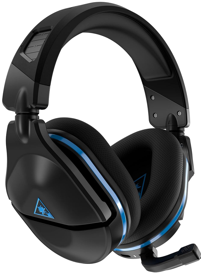
Figure 4.2: Headset with microphone in active position.