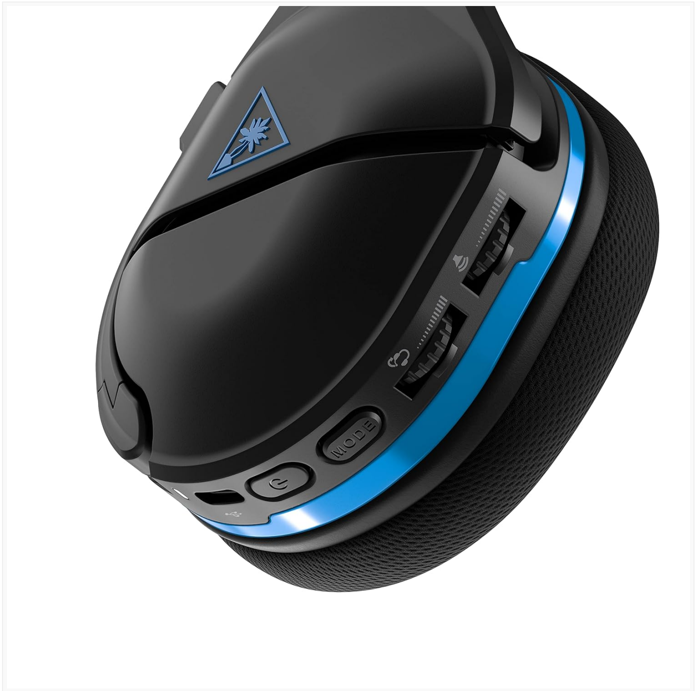
Figure 4.1: Headset Controls on Left Earcup.