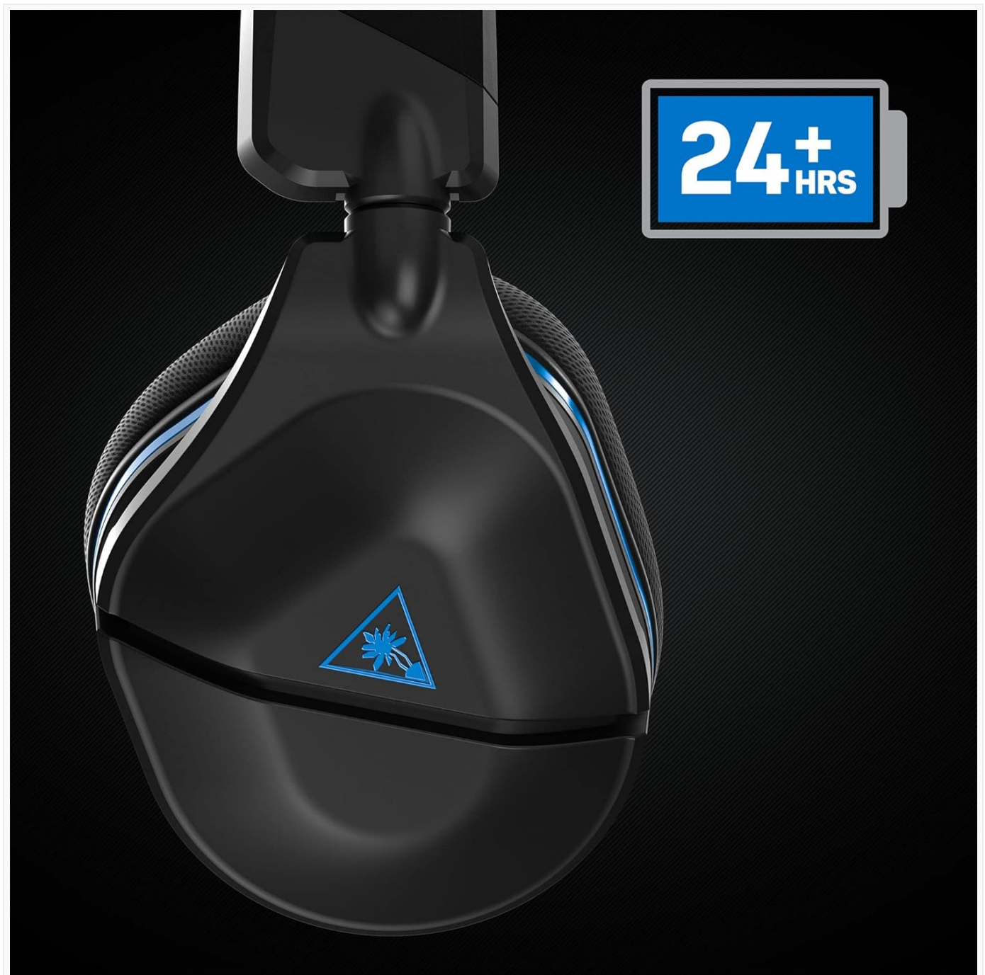
Figure 5.1: Headset highlighting 24+ hour battery life.