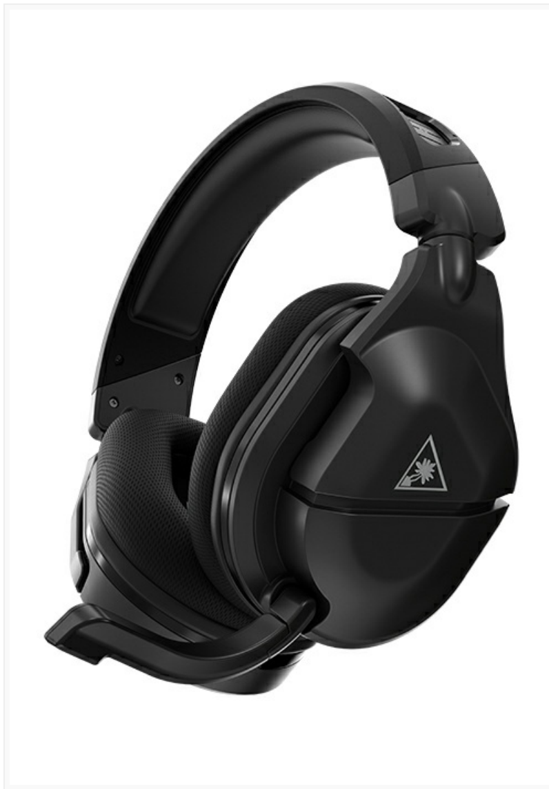
Figure 2.1: Included package contents for the Stealth 600 Gen 2 USB headset.